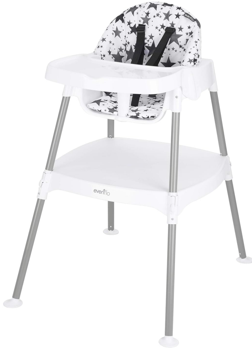
Image: The Evenflo 4-in-1 Eat & Grow Convertible High Chair in its primary high chair configuration, featuring a white frame and a black and white star-patterned seat pad. The chair includes a full-size tray and a secure harness system.