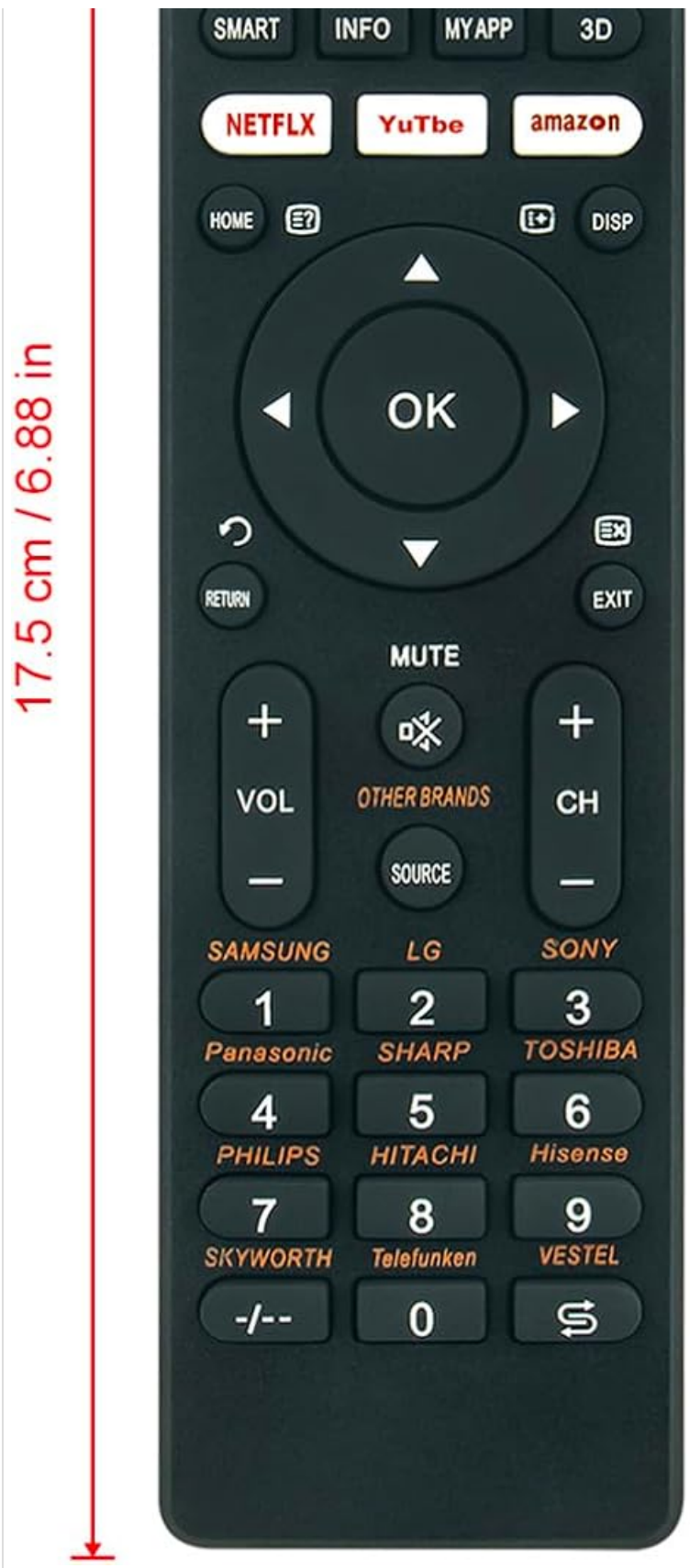
Image: Remote control with labeled dimensions for length and width.