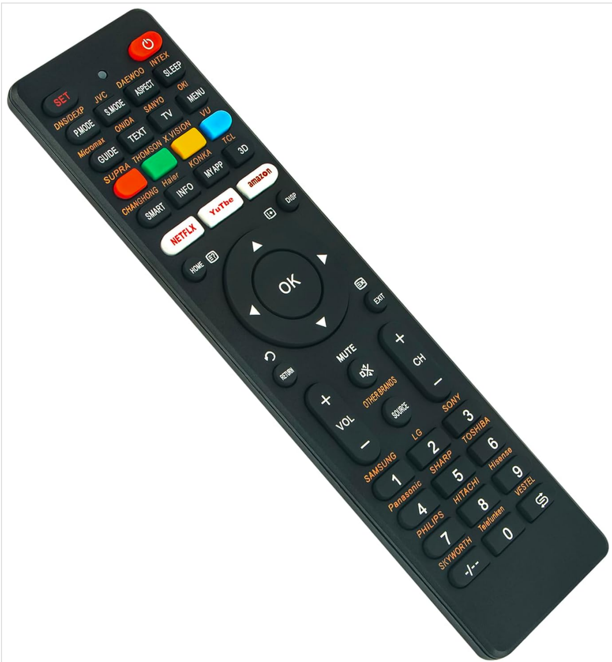
Image: Front view of the remote control displaying its button layout.