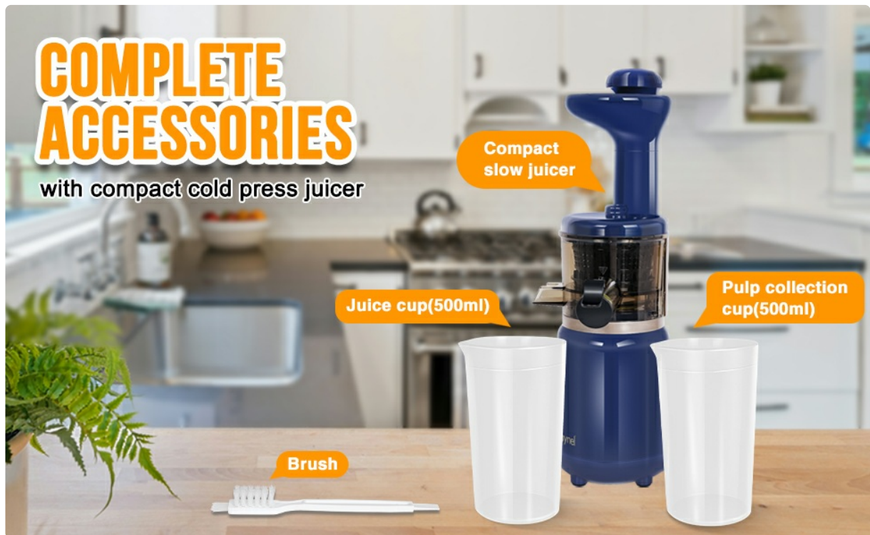
Image: The CAYNEL Compact Cold Press Juicer, highlighting its sleek design and the fresh juice it produces.

Thank you for choosing the CAYNEL Compact Cold Press Juicer. This masticating slow juicer is designed to efficiently extract juice from fruits and vegetables, preserving nutrients and minimizing oxidation. Its compact design makes it suitable for any kitchen space. Please read this manual thoroughly before operating the appliance to ensure safe and optimal performance.