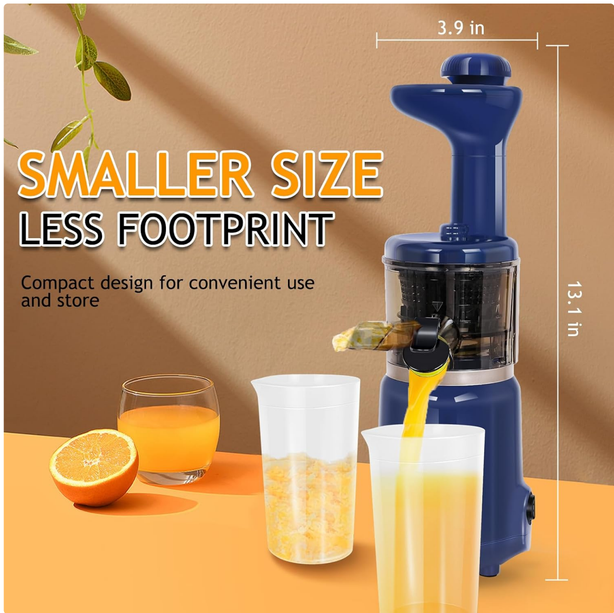
Image: The compact dimensions of the juicer, illustrating its small footprint for convenient use and storage.