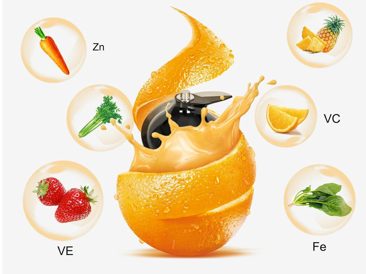
Image: Illustration demonstrating the slow cold pressing process for higher nutrient retention and low oxidation, resulting in 30% more juice yield.