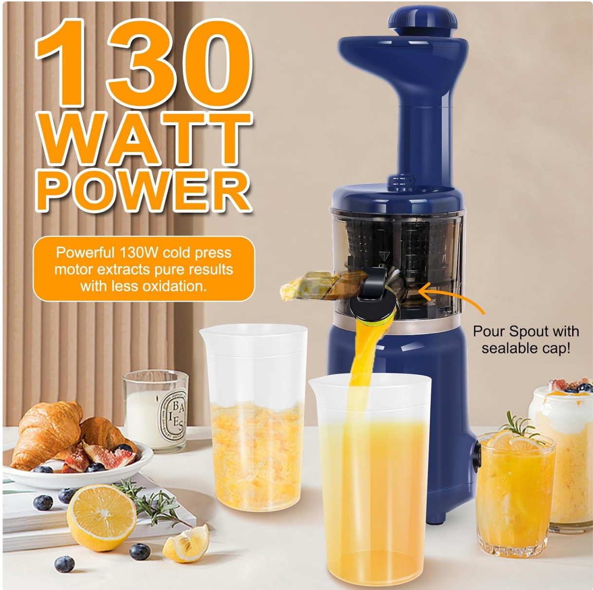
Image: The juicer actively extracting juice, demonstrating its 130-watt motor for efficient cold pressing.

Powerful 130W cold press motor extracts pure results with less oxidation.