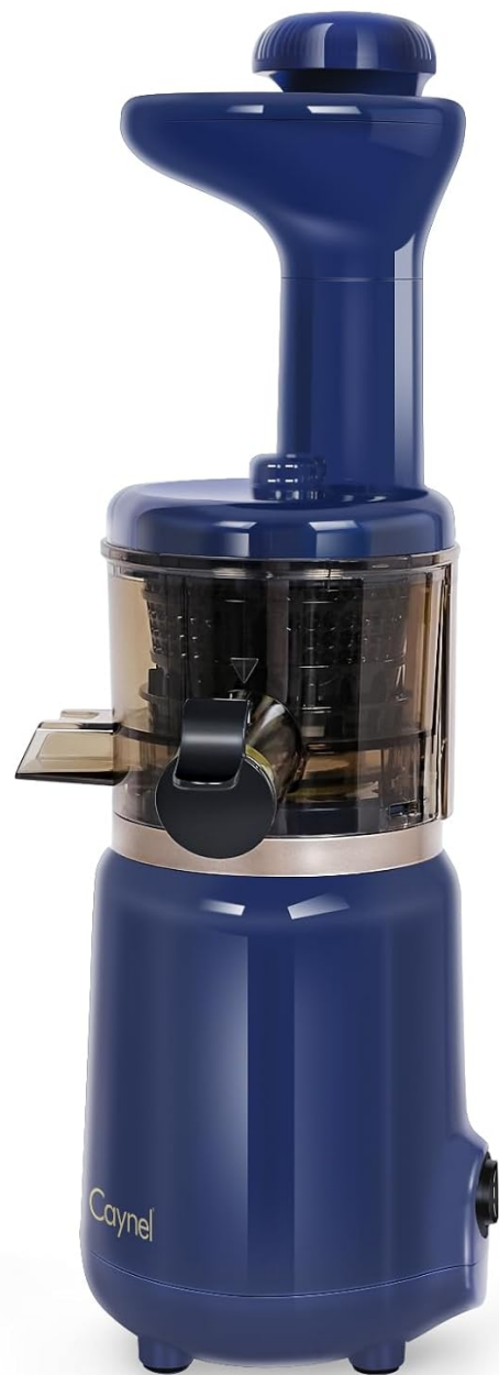
Image: The complete set of the CAYNEL juicer, including the main unit, juice cup, pulp collection cup, and cleaning brush.