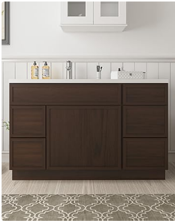
Image 6.1: Regular cleaning with a damp cloth helps maintain the vanity's finish.