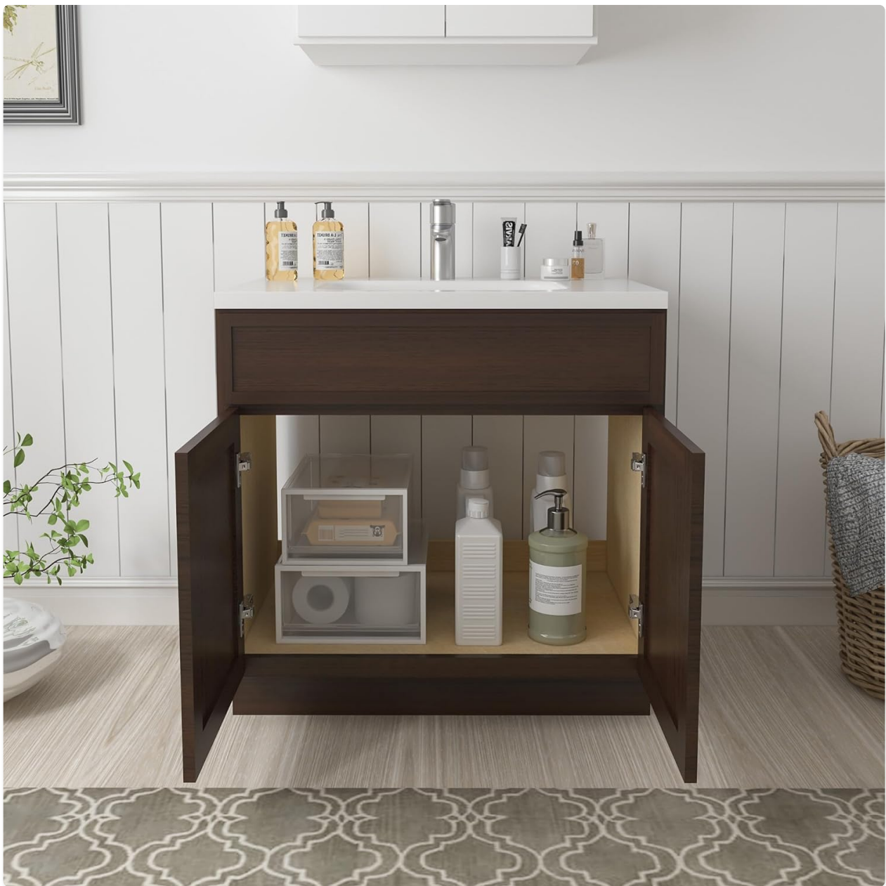
Image 5.1: Interior view demonstrating the ample storage space within the vanity base.