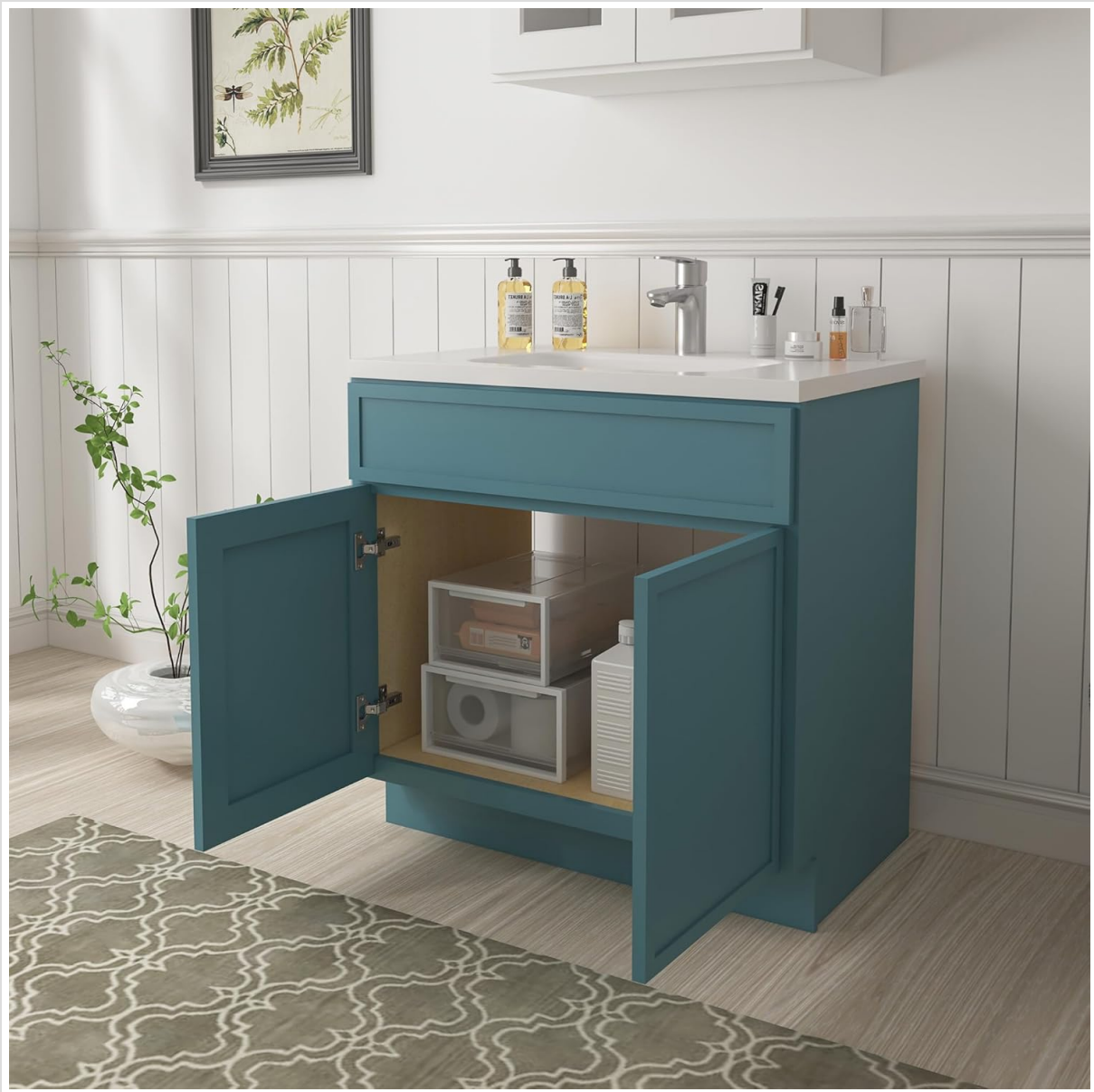
Image: Vanity base with doors open, demonstrating internal storage space.