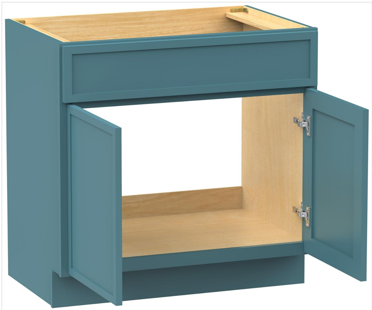
Image: Vanity base with doors open, illustrating the interior structure during assembly.

This is a freestanding, floor-mount cabinet. Choose a level location in your bathroom for installation.