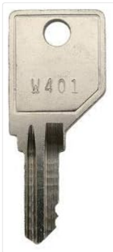
Figure 1: Example of a replacement key. Note: The key shown is for illustrative purposes and may display a different code (e.g., W401) than your specific W268 key.

It is a genuine original equipment part, ensuring compatibility and proper function with your office furniture locking mechanisms.