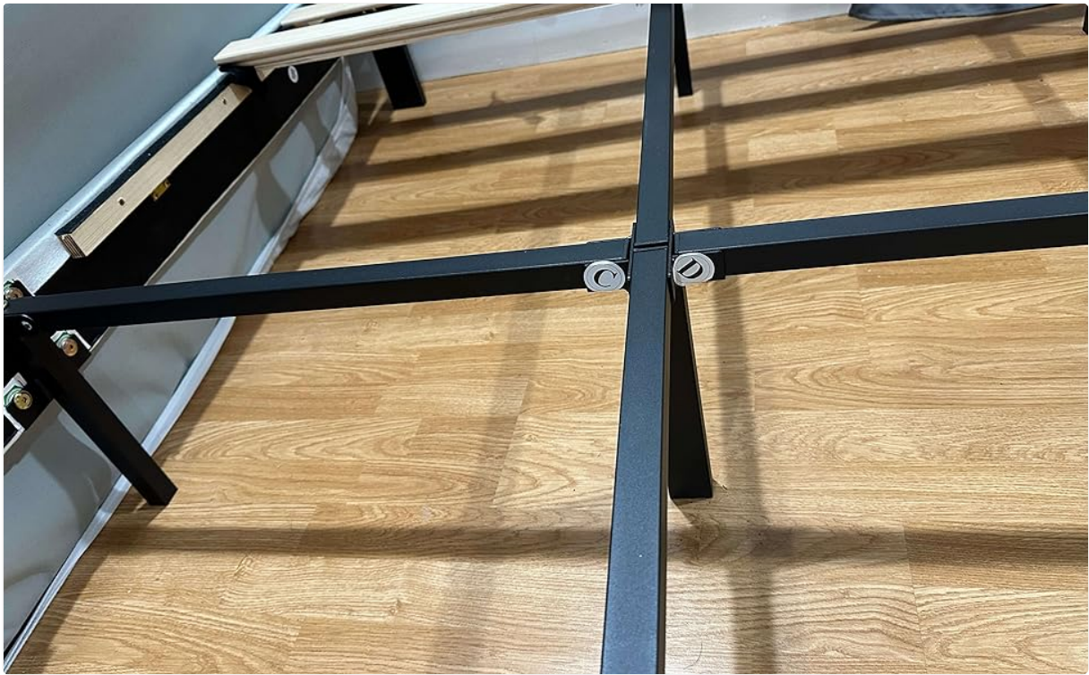
Image: Underside view of the bed frame. This image displays the robust metal support structure and the nine sturdy support legs, ensuring stability and weight capacity.