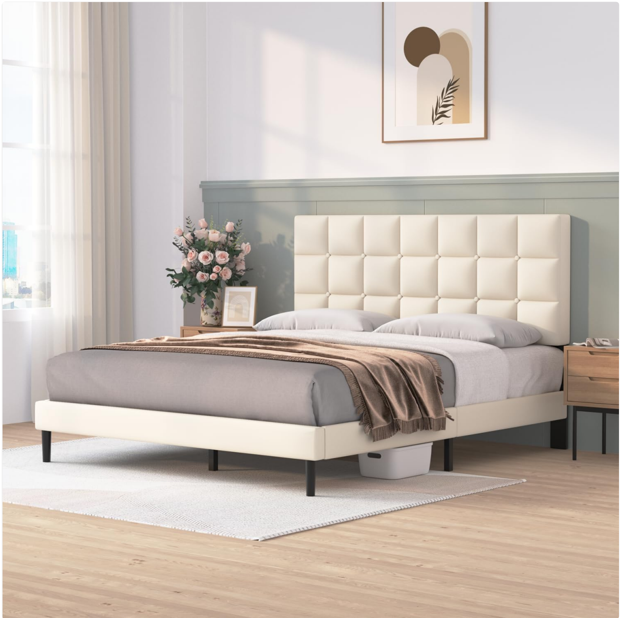
Image: Assembled King size bed frame. This image shows the complete bed frame with a mattress, demonstrating its appearance in a bedroom environment.