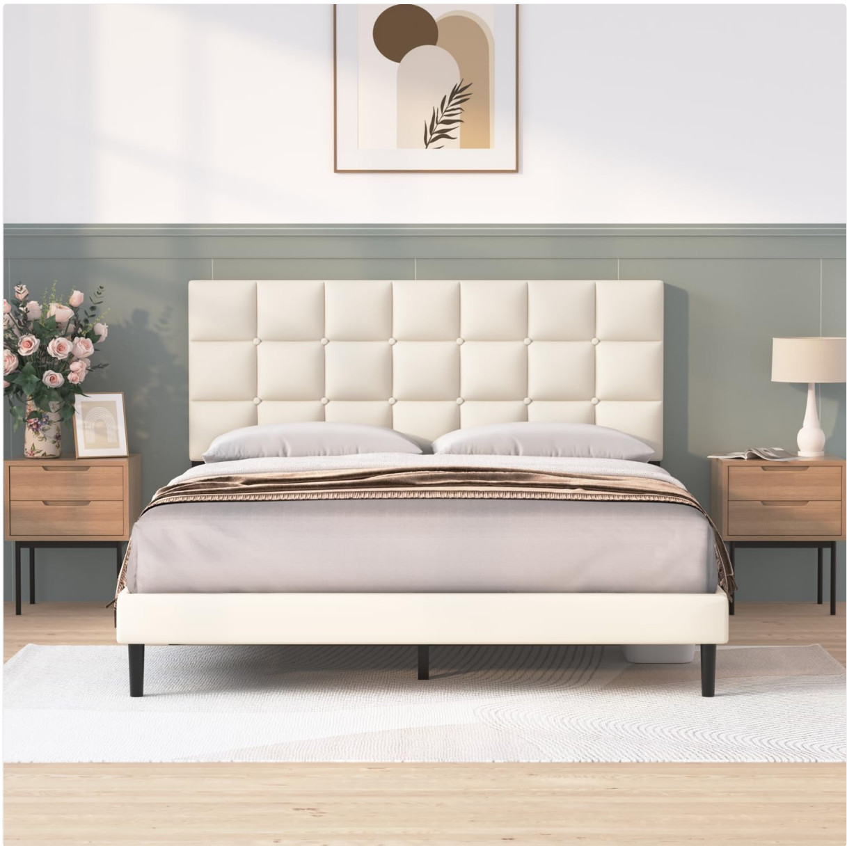
Image: Under-bed storage space. This image demonstrates the available clearance beneath the bed frame, suitable for storing various items.