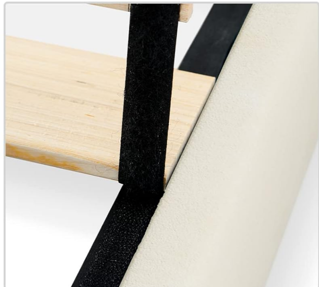
Image: Overview of bed frame components. This image illustrates the main structural parts of the bed frame, including the metal frame and wooden slats.