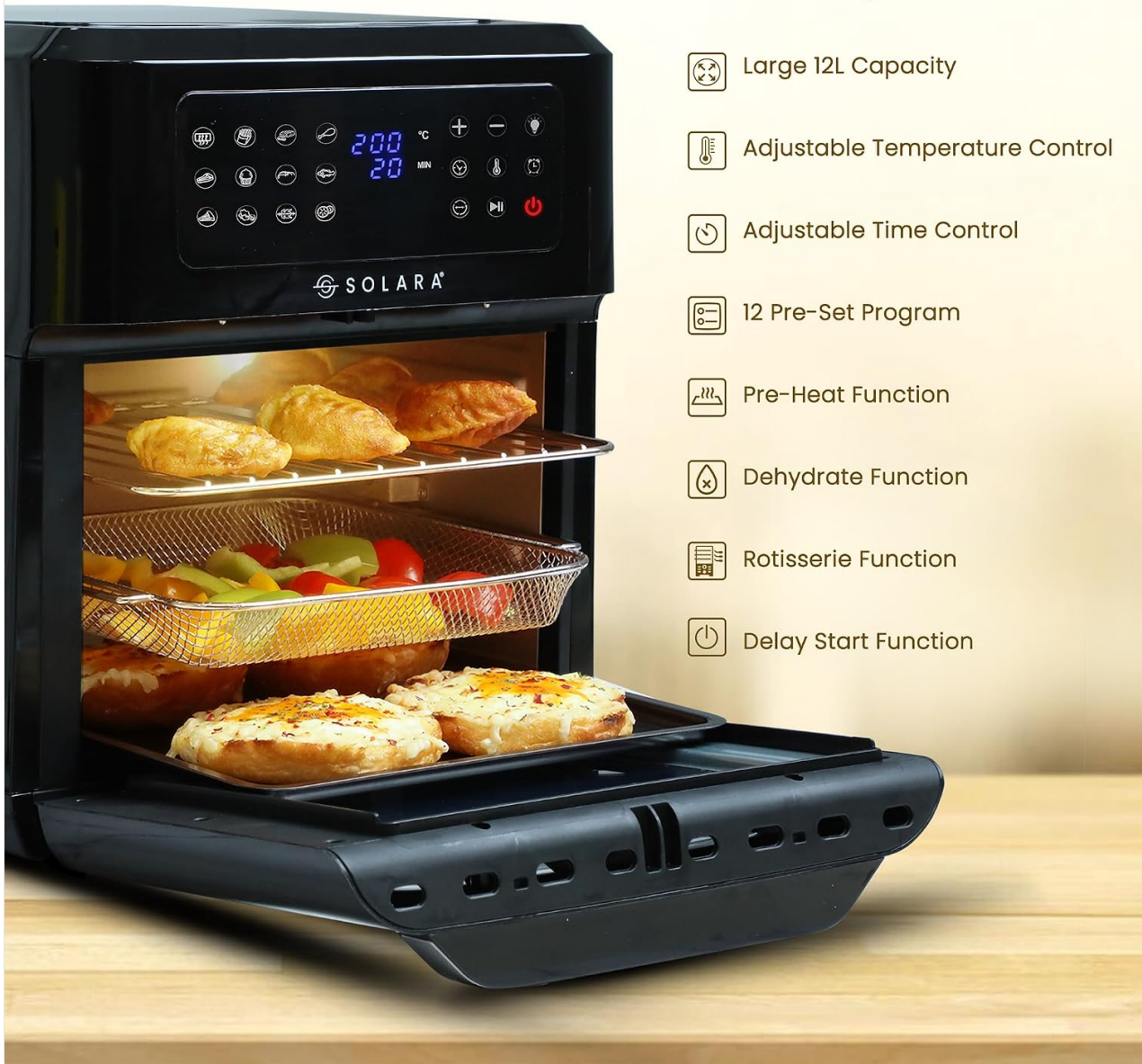
Image 1.1: The SOLARA 12L Air Fryer Oven, demonstrating its internal capacity and multi-tier cooking capability.