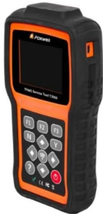
Image 1.1: BoxWave ClearTouch Crystal ToughShield 9H Screen Protector shown with a compatible Foxwell T2000WF device.