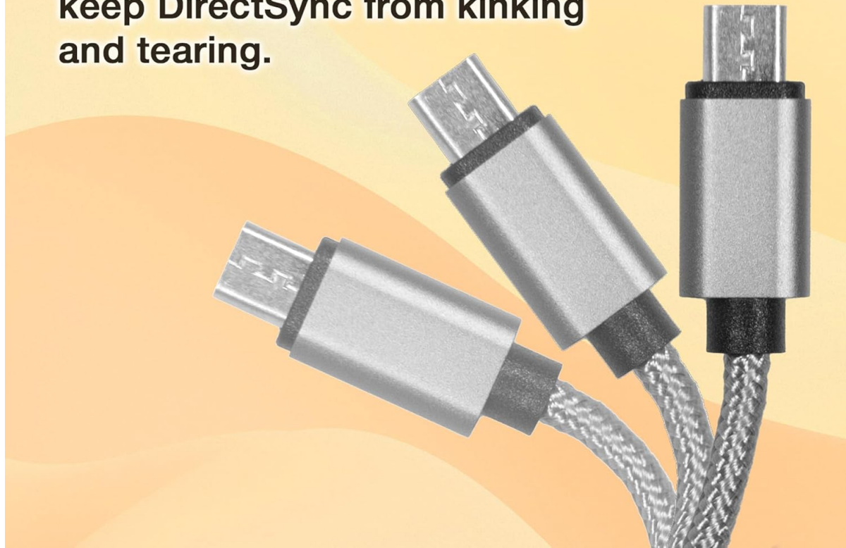
Image 5.2: Illustration of the reinforced strain relief at the connector ends, which helps prevent kinking and tearing.

Rubberized connector supports keep DirectSync from kinking and tearing.