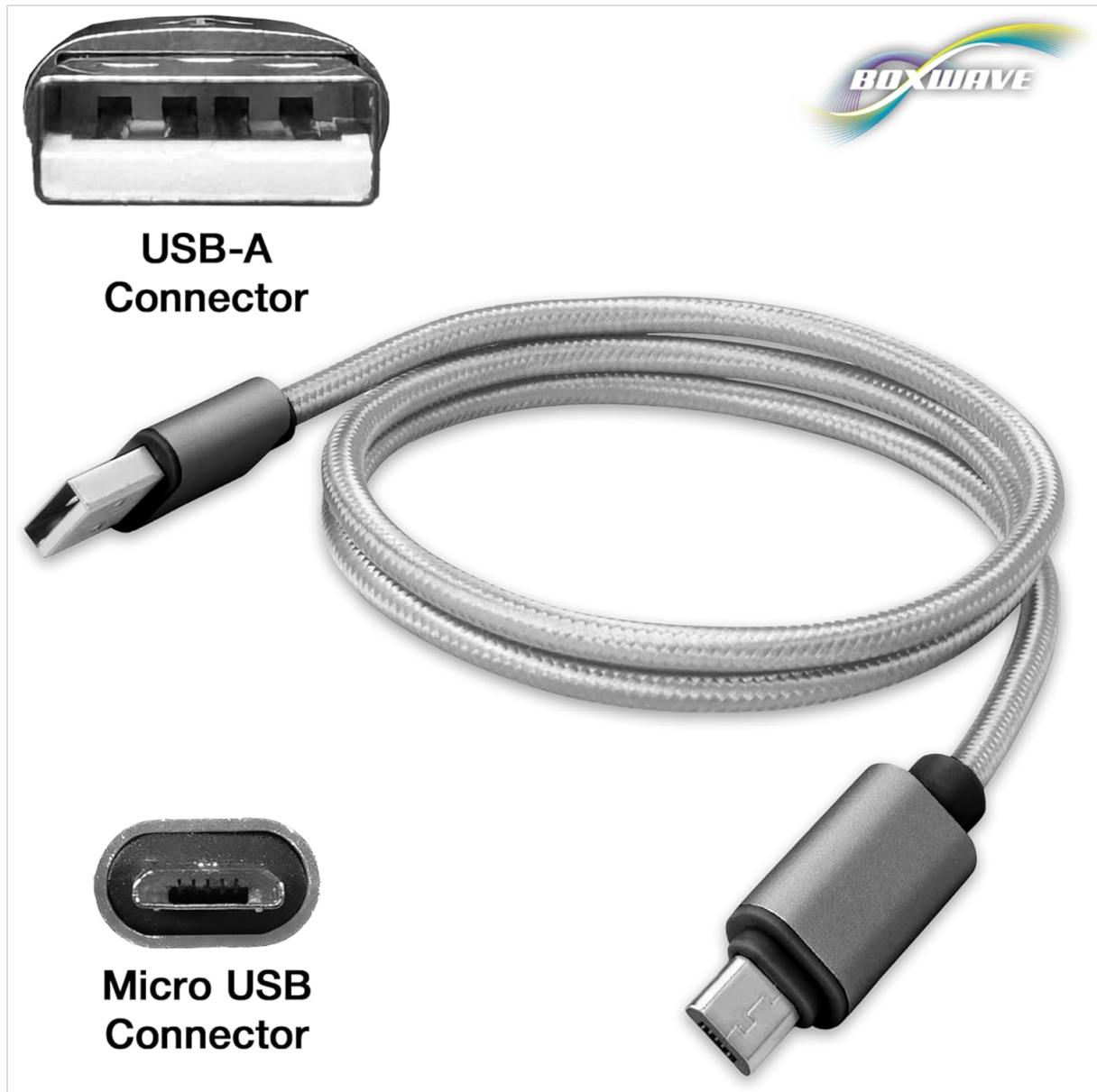
Image 3.1: Close-up view of the Micro USB and standard USB-A connectors on the DuraCable, indicating their respective shapes for correct insertion.