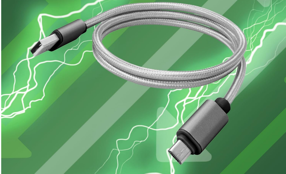
Image 1.1: The BoxWave Micro USB DuraCable, illustrating its dual function for charging and data synchronization.