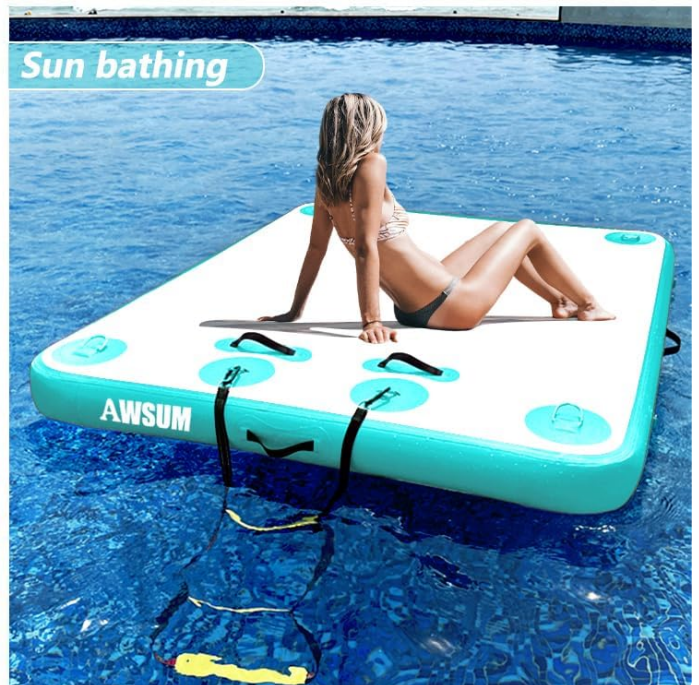
Image: Various uses of the inflatable dock, including yoga, tethering to a boat, leisure activities, and sunbathing.