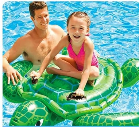
Floating Row Mat