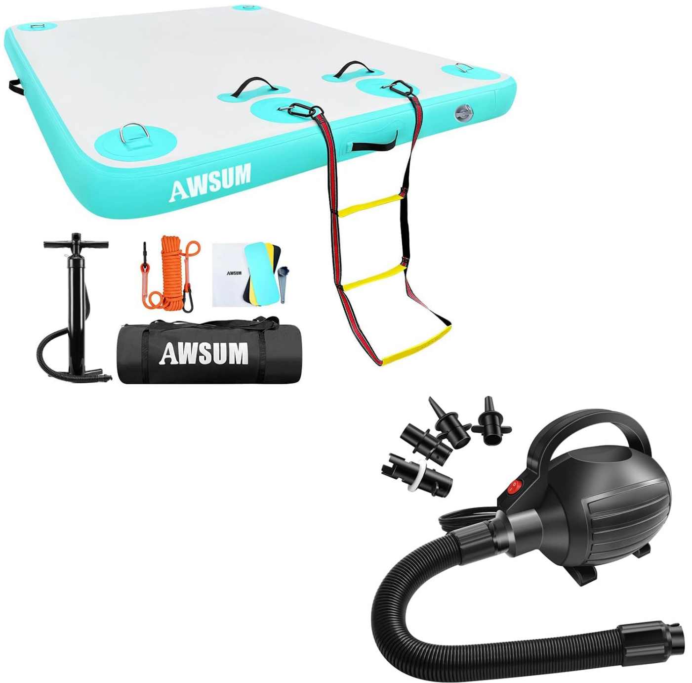
Image: Complete package contents including the inflatable dock, electric pump, hand pump, storage bag, and ladder.