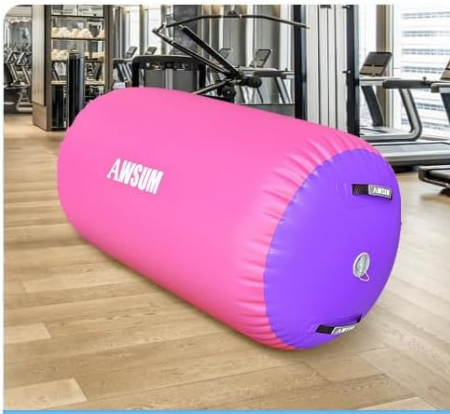
Gymnastics Air Roller