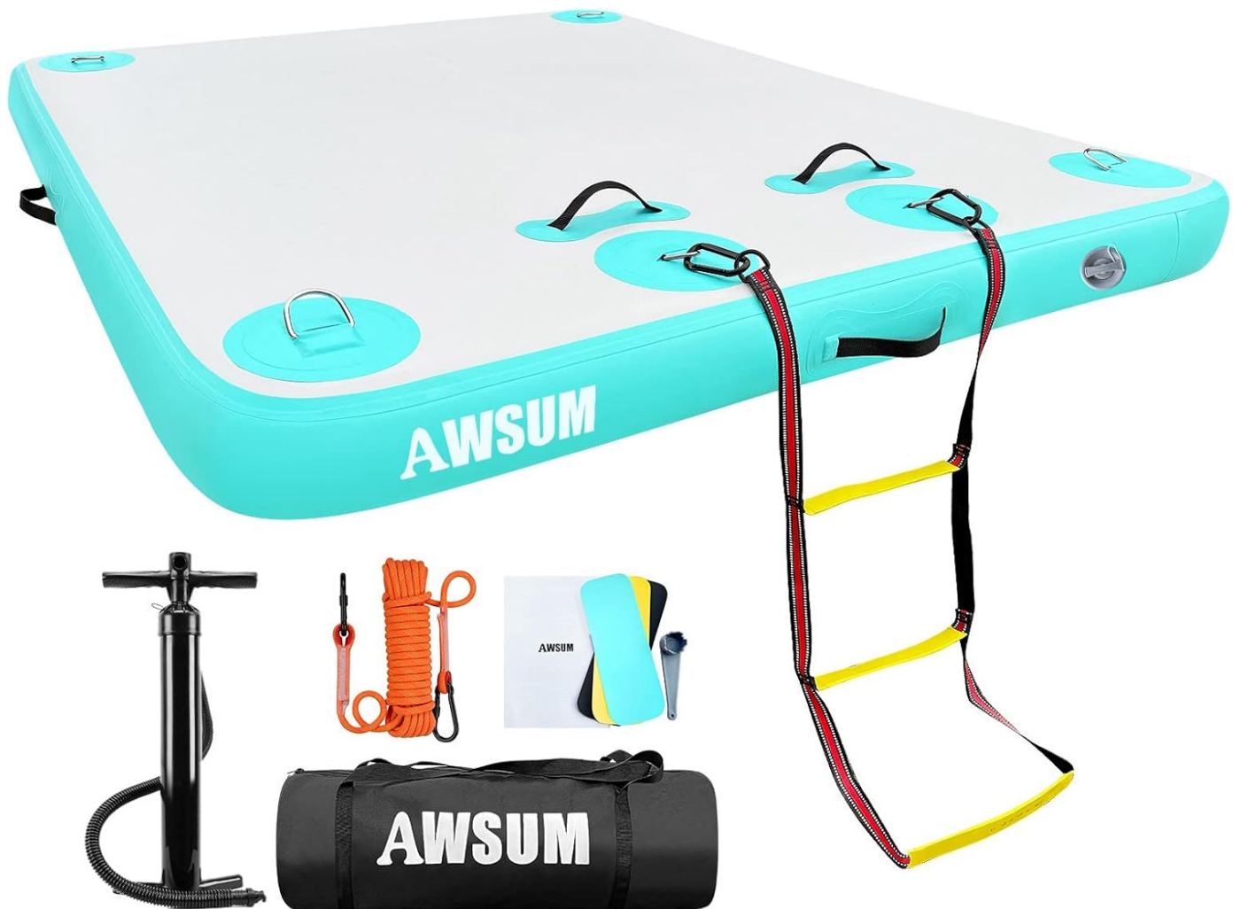
Image: The inflatable dock shown with the hand pump, ropes, and a repair kit.