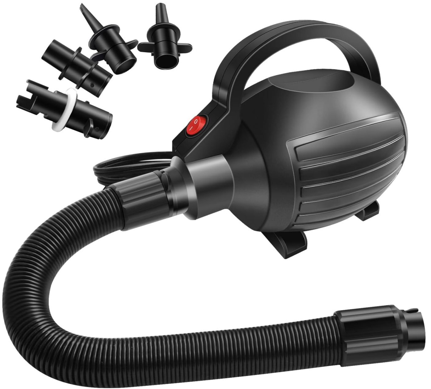
Image: The electric air pump with its hose and various detachable nozzles for different inflation needs.