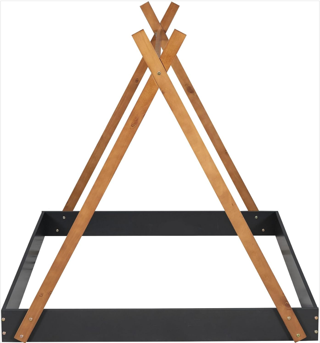
Image: An angled view of the assembled Mirightone Full Size Wood Teepee Floor Bed frame, highlighting the sturdy construction.