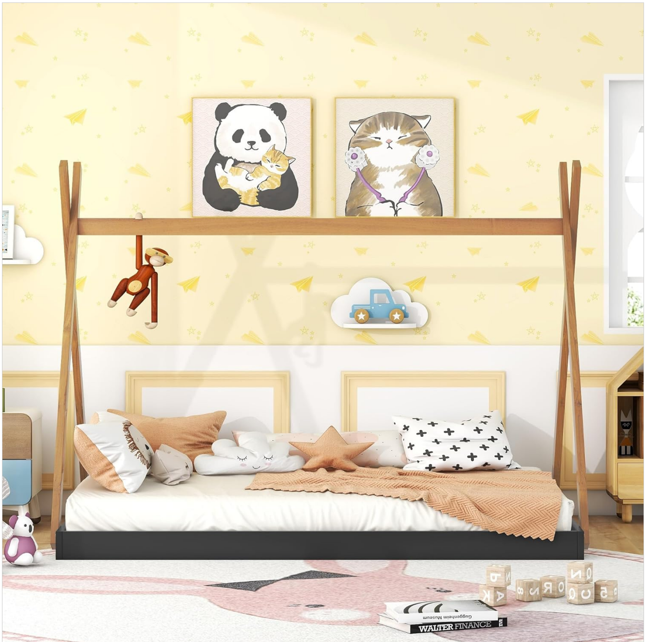
Image: A front view of the Mirightone Full Size Wood Teepee Floor Bed in a child's room, illustrating its low profile and decorative potential.