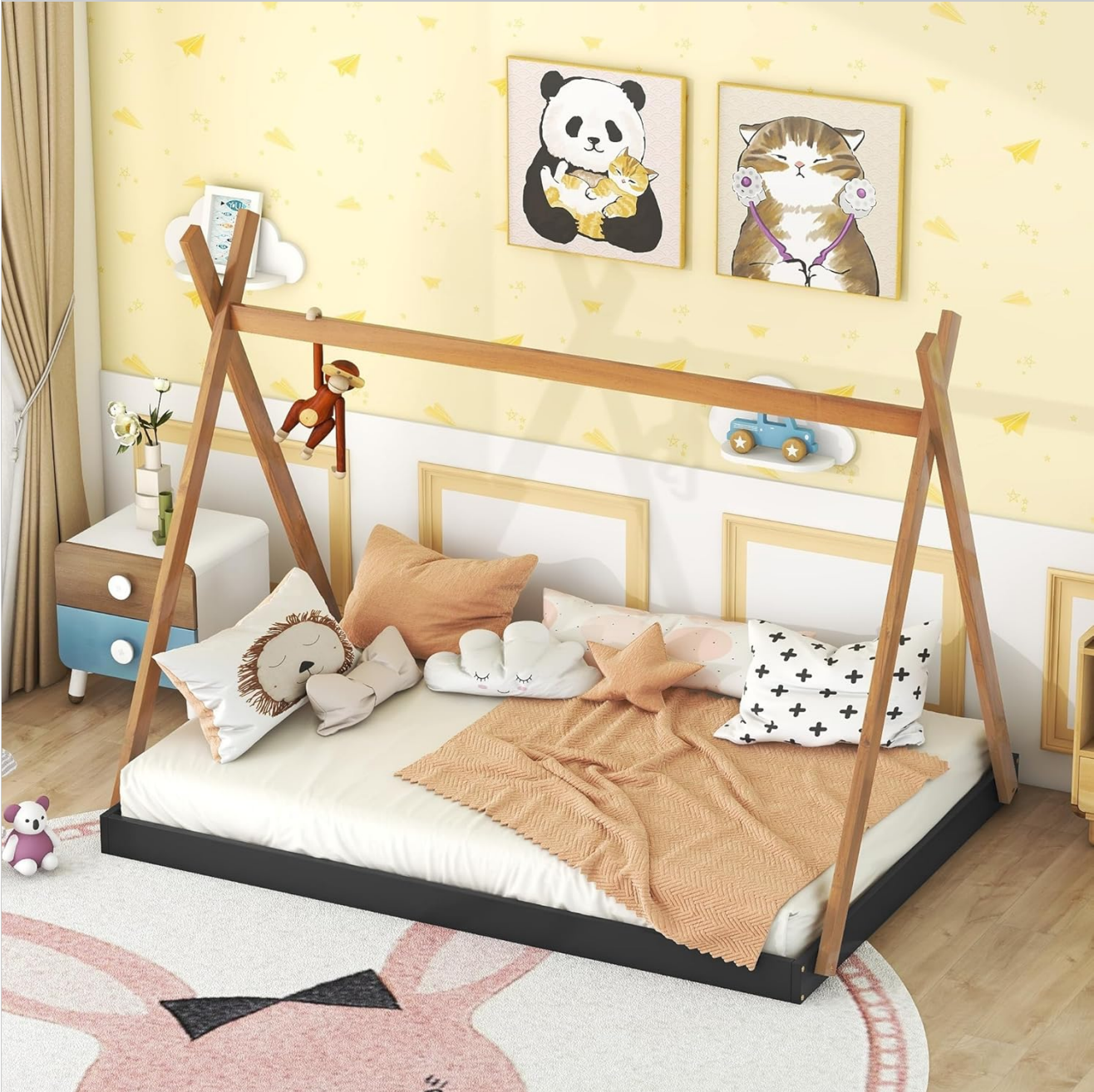
Image: The Mirightone Full Size Wood Teepee Floor Bed in a decorated child's room, showcasing its use with a mattress and various accessories.

teepee structure as it is not designed for climbing.