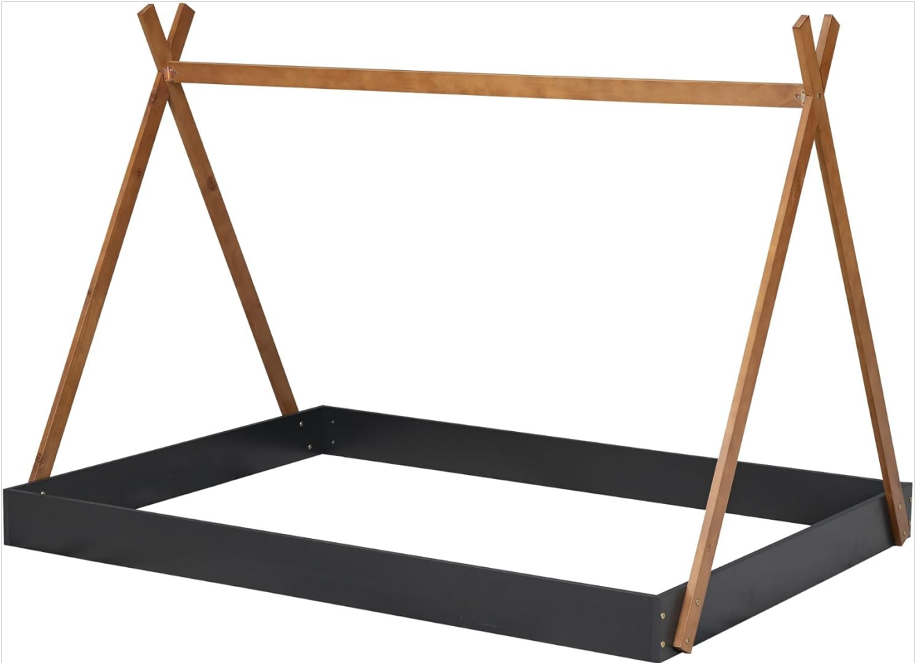
Image: The assembled Mirightone Full Size Wood Teepee Floor Bed frame, showing the black base and natural wood teepee structure.