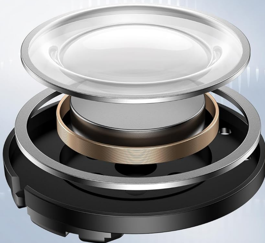
Image: Close-up internal view of the Baseus Bowie E20 earbud highlighting the dual-mic setup for Environmental Noise Cancellation (ENC).

The 12mm PU diaphragm produces strong and accurate ultra-low-frequencies