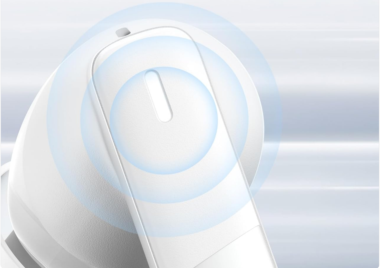
Image: Diagram illustrating the touch control functions on the Baseus Bowie E20 earbuds, including play/pause, voice assistant, noise cancellation, and spatial audio.

•• (L or R) cycle through Music mode>Theater Mode> Normal(default)