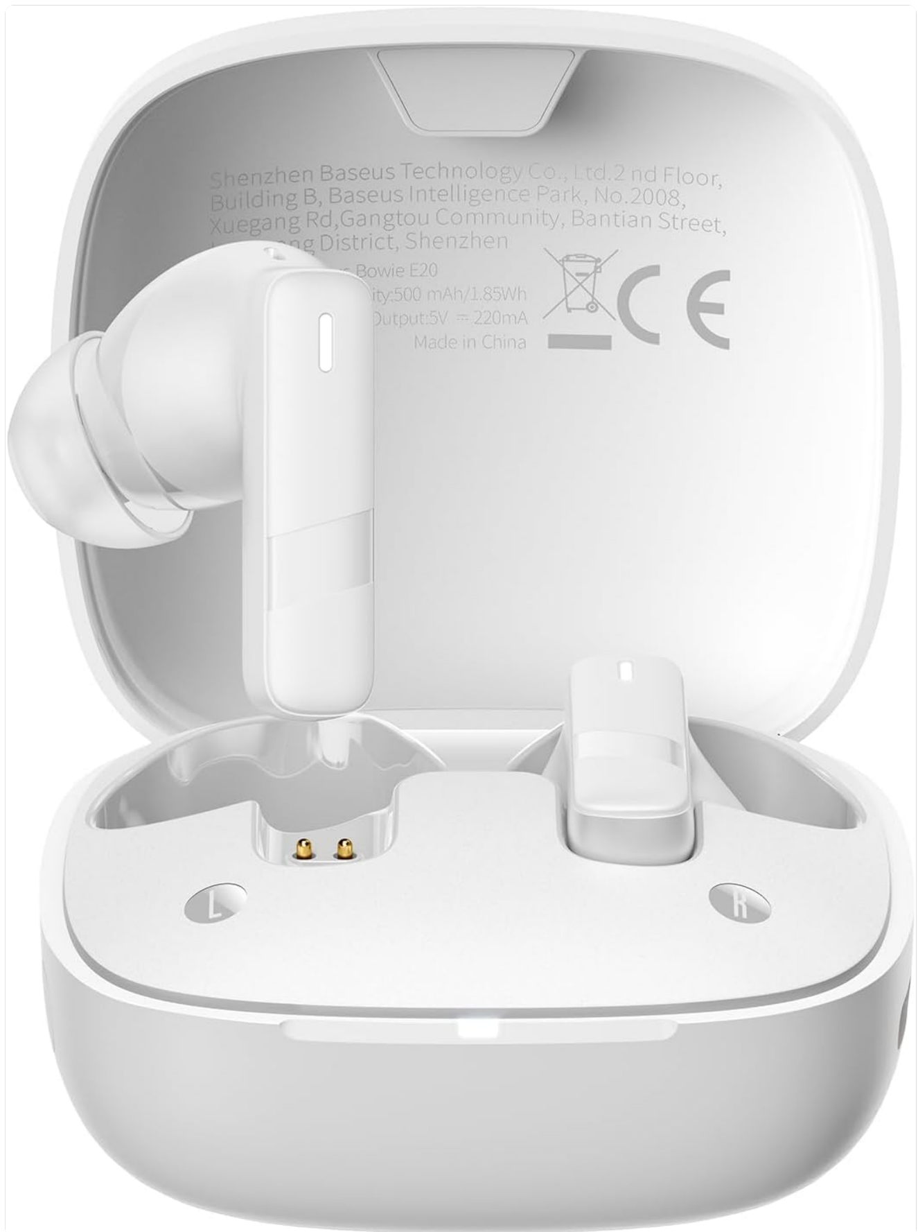
Image: The Baseus Bowie E20 earbuds placed inside their open charging case, showing the charging contacts and internal layout.