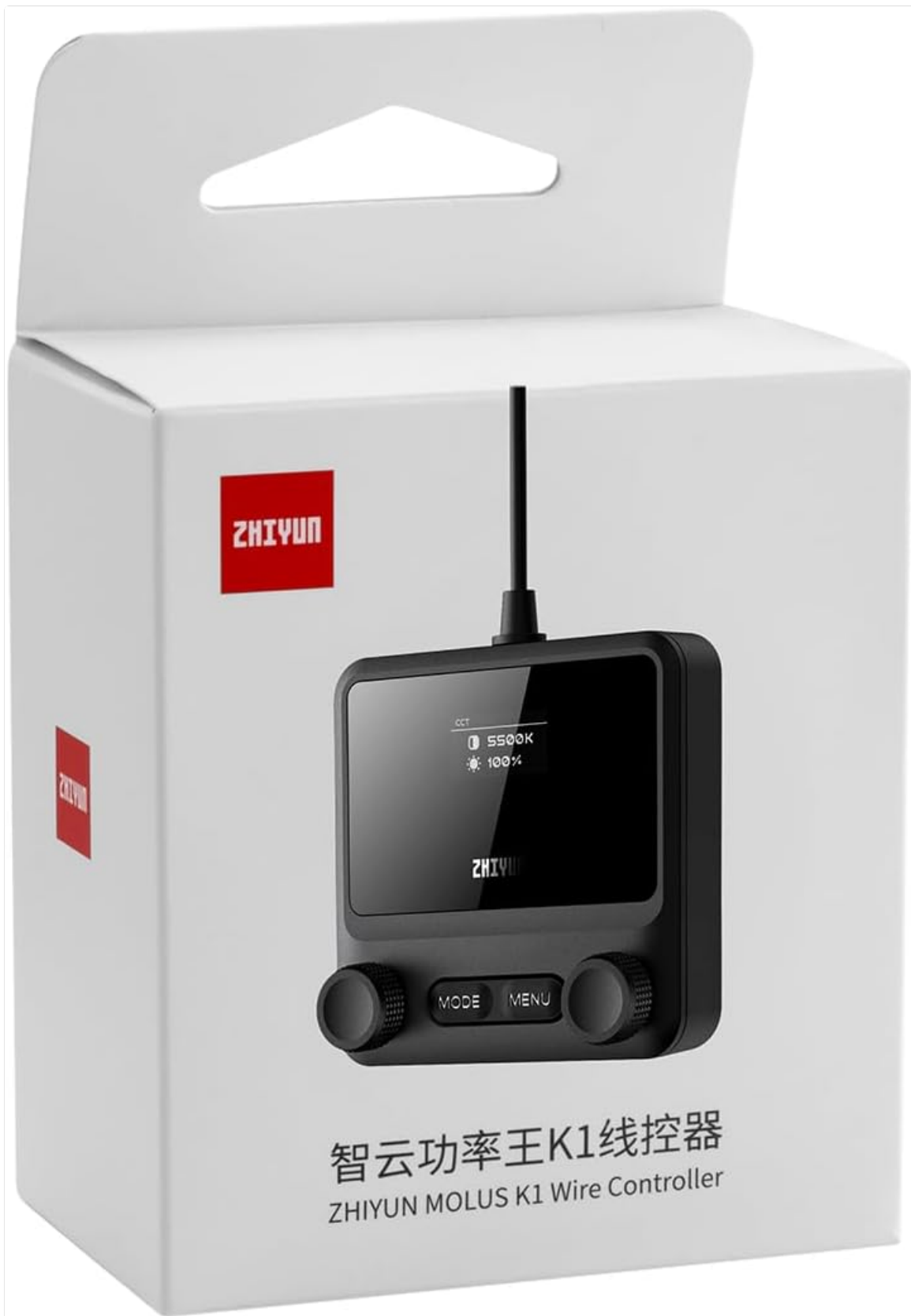
Figure 3: ZHIYUN K1 Cable Remote Controller (Rear View)

This image shows the back of the controller, featuring a textured, ribbed surface for improved grip and heat dissipation. The cable is visible extending from the top.