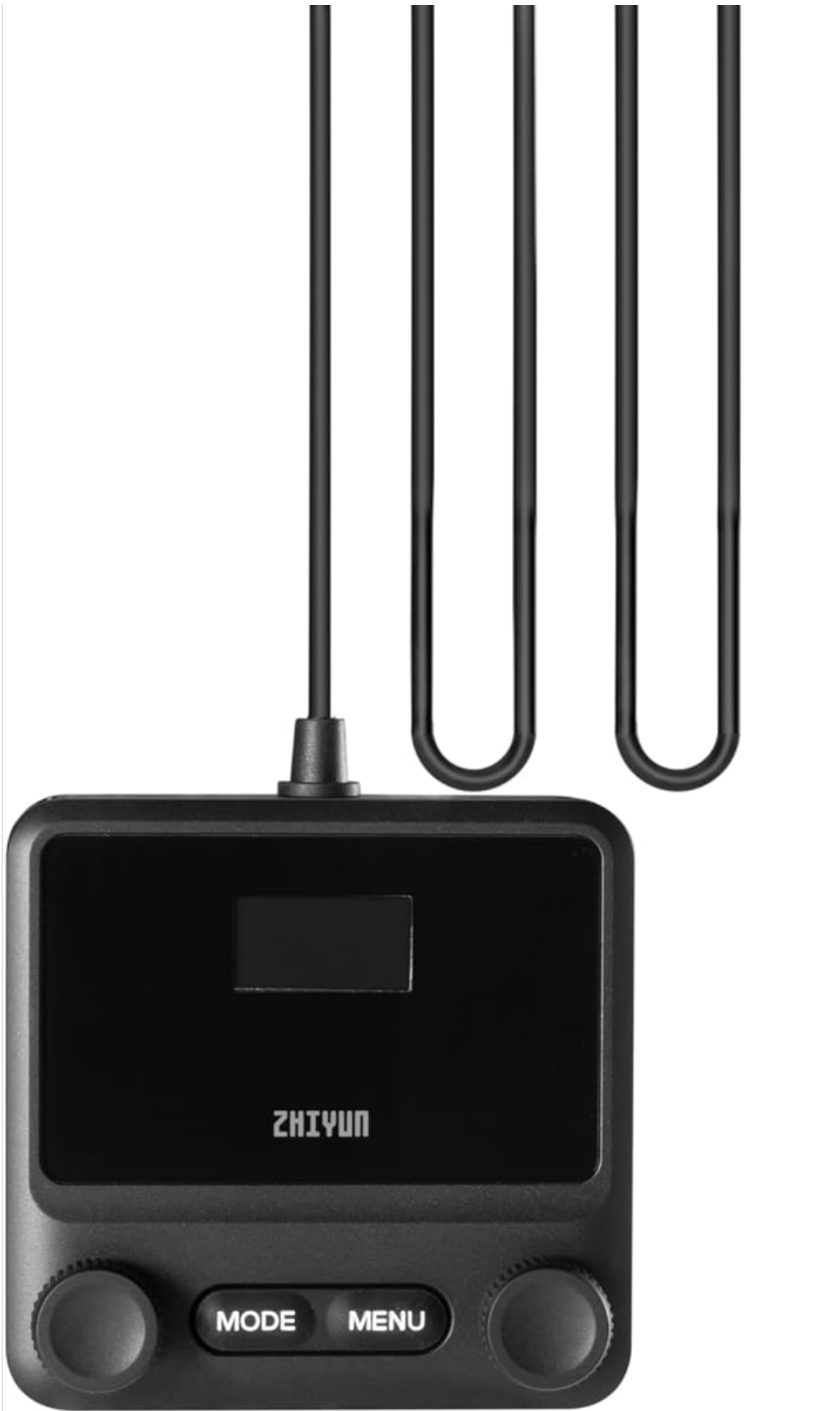
Figure 1: ZHIYUN K1 Cable Remote Controller (Overall View)

This image displays the ZHIYUN K1 Cable Remote Controller, showing its main body, attached cable, and USB-C connector. The controller features a compact, rectangular design with control dials and buttons on the front face.