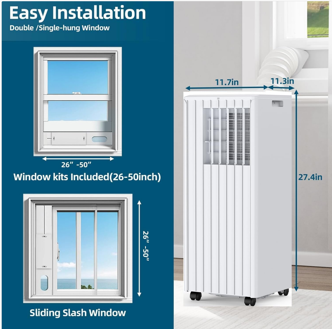
Figure 5.2: The adjustable window kit is compatible with both double-hung and sliding sash windows, accommodating widths from 26 to 50 inches.