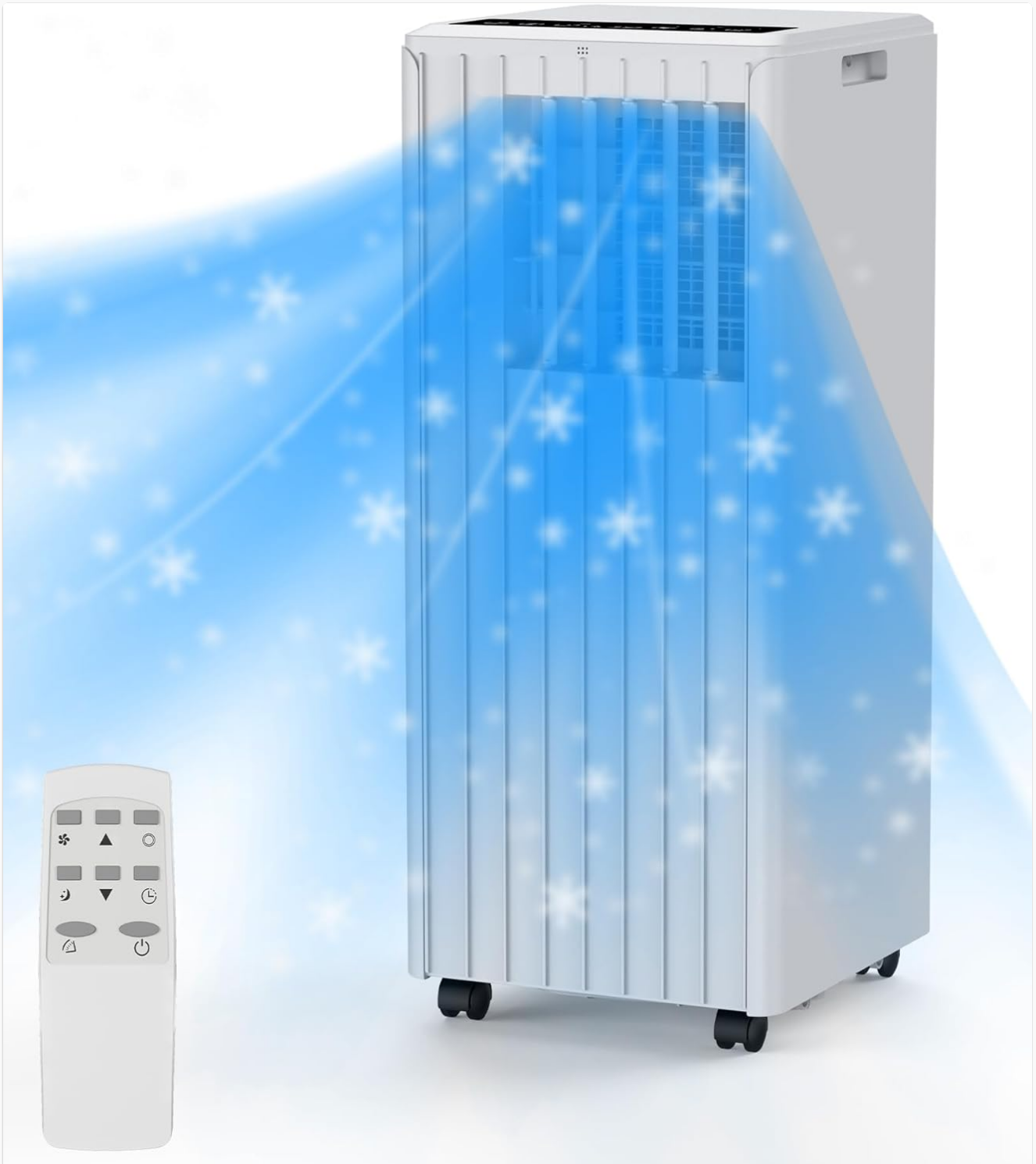
Figure 4.1: Front view of the portable air conditioner with cool air visually represented as flowing from its front vents, alongside its remote control.

The Takywep Portable Air Conditioner is designed for optimal performance and user convenience. It features a compact design with integrated handles and swivel casters for easy mobility.