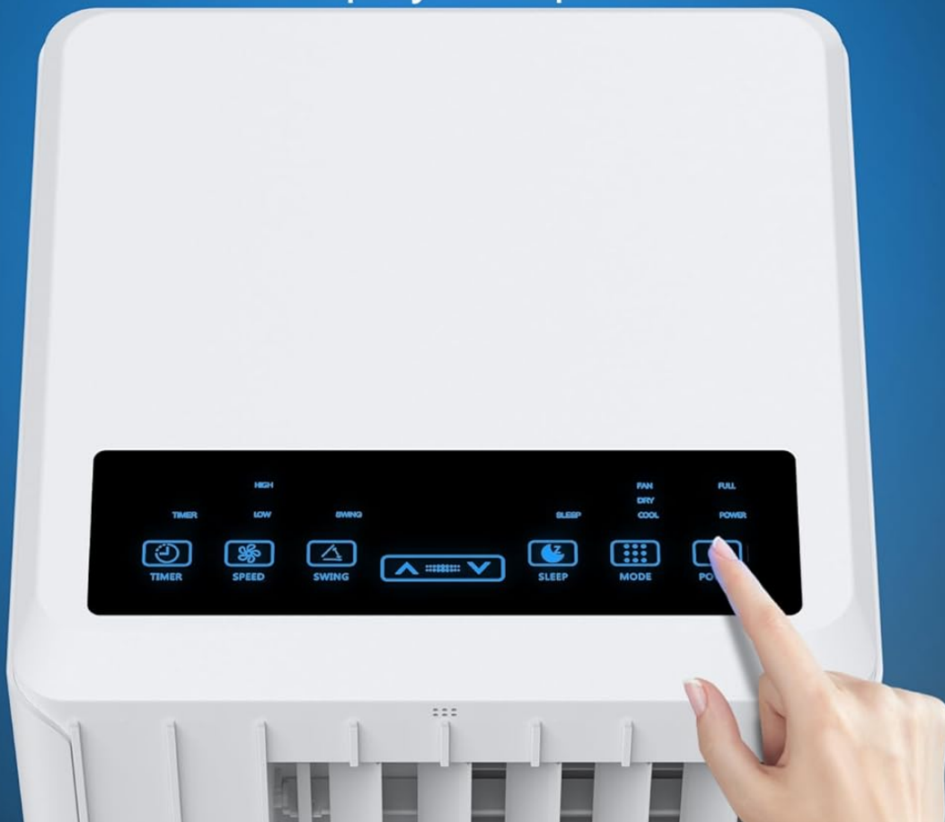
Figure 4.2: Detailed view of the unit's top control panel, showing buttons for Swing, Timer, Speed, Up/Down temperature, LED Display, Sleep Mode, and Power. The display shows '72' degrees.