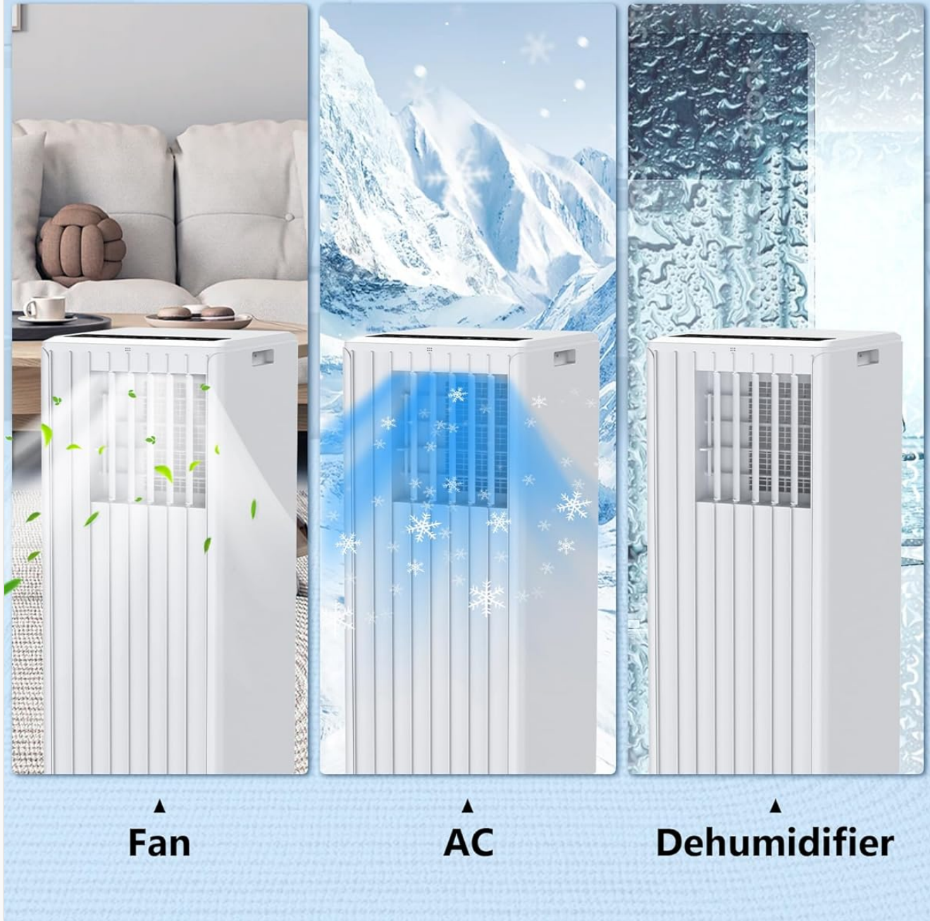
Figure 6.1: The unit offers versatile 3-in-1 functionality: Fan, AC (Cooling), and Dehumidifier.