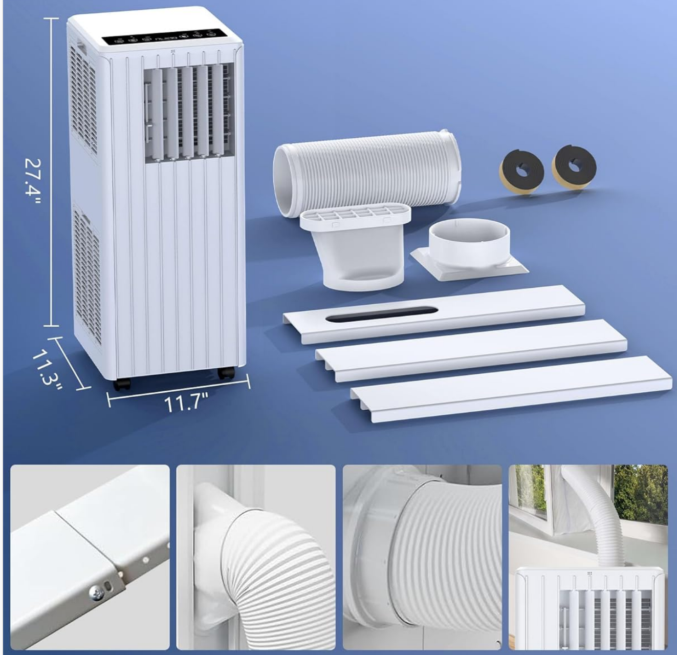
Figure 3.1: Included Components. The image displays the main portable air conditioner unit, an extendable exhaust hose, a multi-piece adjustable window sealing kit, a remote control, and a small drainage pipe.

Window kits and instructions are included