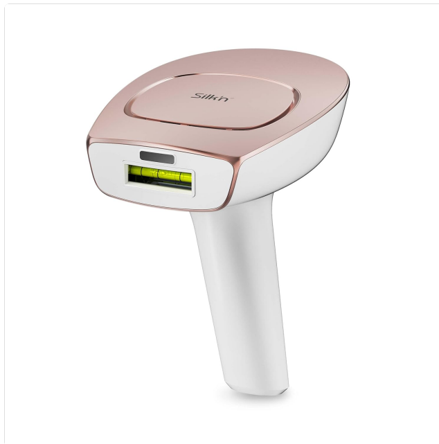
Image: The Silk'n IPL Motion Premium Device in rose gold and white, showing its ergonomic design and treatment window.