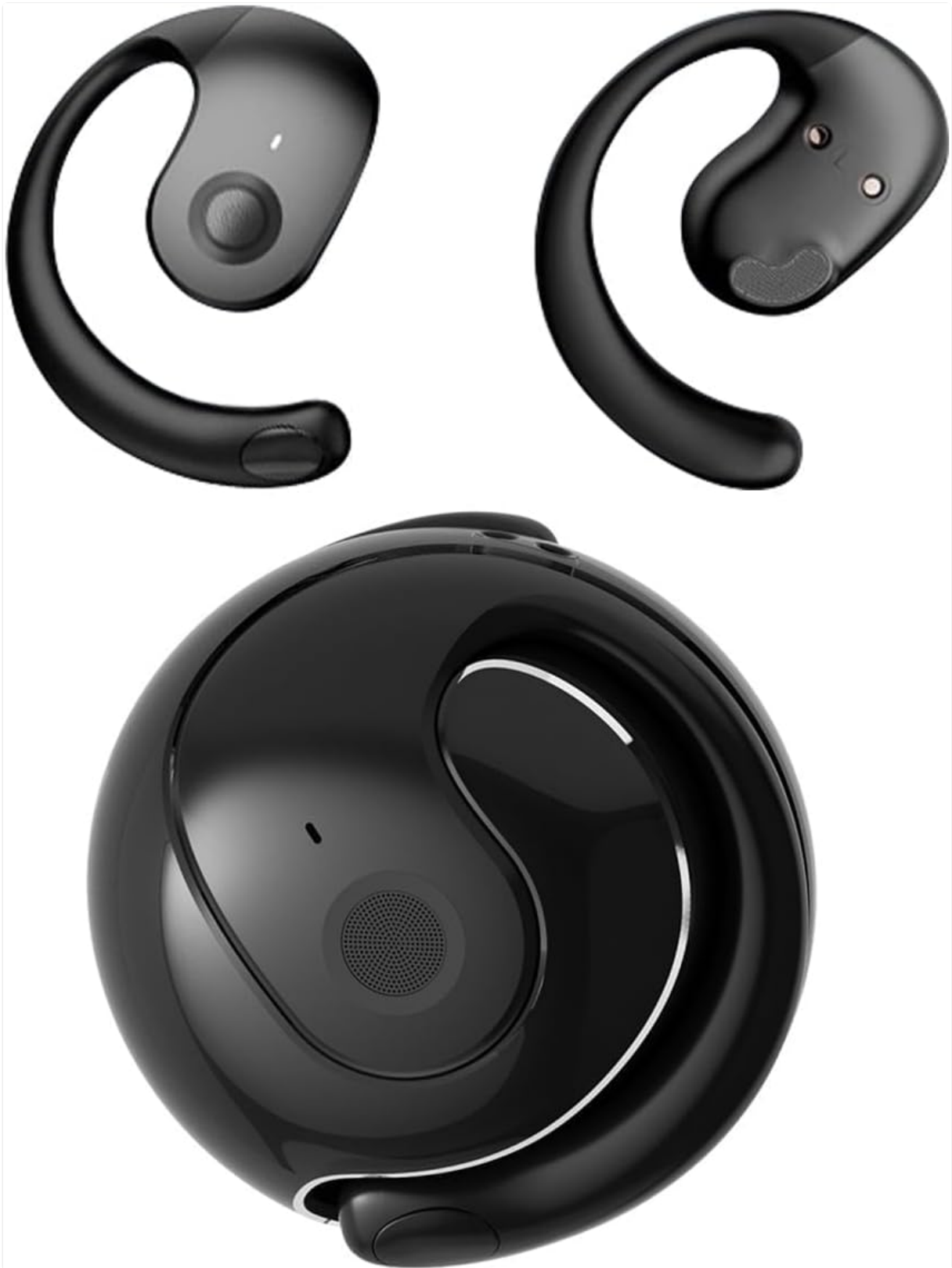
Image 1.1: Ttbesmi JM13 Open Ear Wireless Bluetooth Headphones and their charging case.