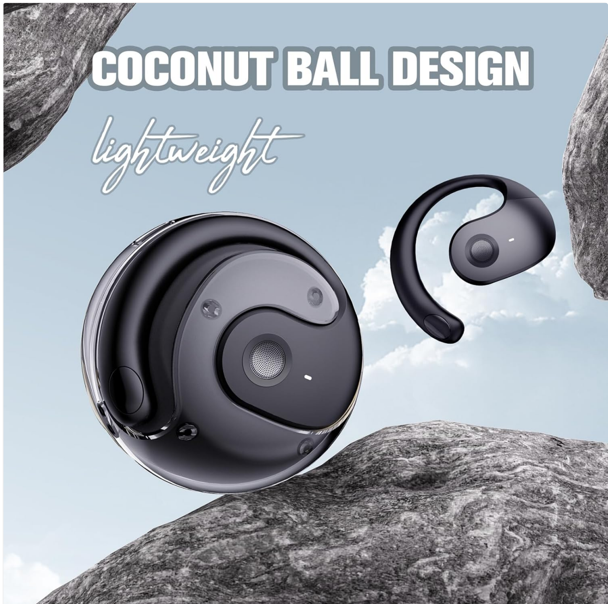
Image 3.1: The compact and lightweight design of the Ttbesmi JM13 headphones and charging case.