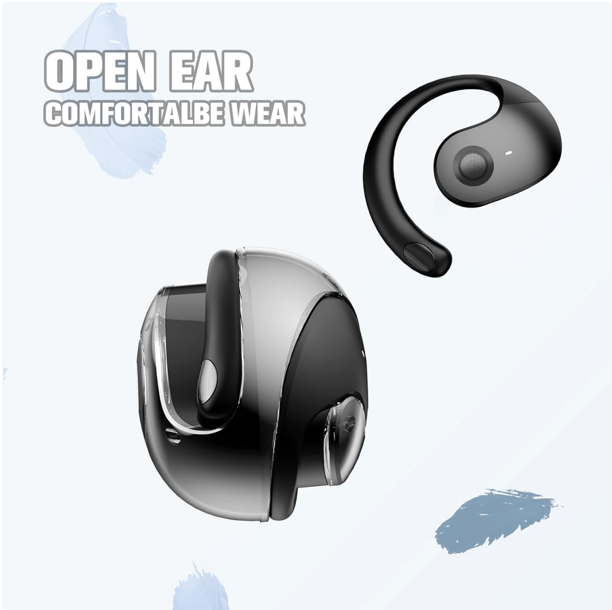
Image 3.4: The open-ear design ensures comfortable wear for extended periods.