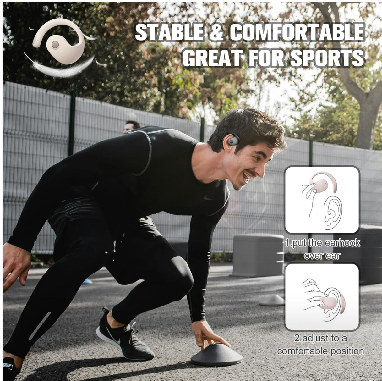
Image 5.1: Proper wearing technique for the Ttbesmi JM13 headphones.