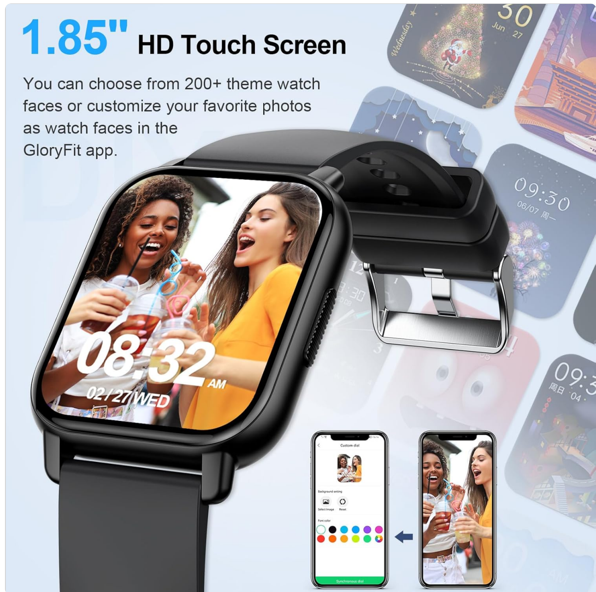
Image 5.1: 1.85" HD Touch Screen. The image illustrates the vibrant display and the ability to customize watch faces through the GloryFit app.

The smartwatch features a 1.85-inch HD touch screen. Swipe left, right, up, or down to navigate through menus and functions. Tap to select an option or confirm an action.