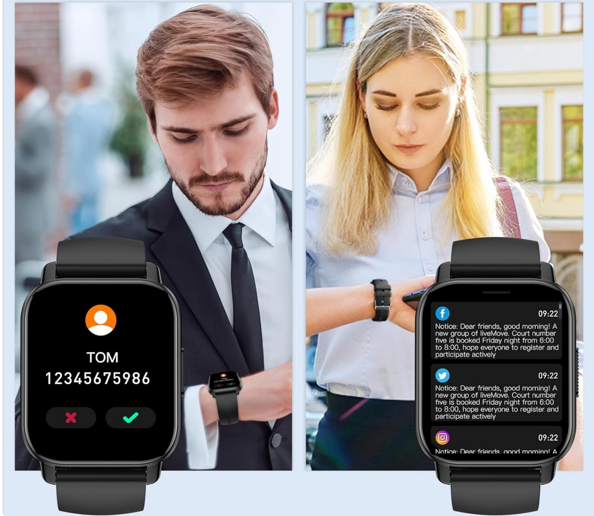
Image 5.2: Bluetooth Call and Message Reminders. This image demonstrates the watch's capability to handle calls and display app notifications.