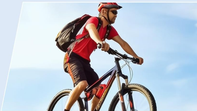
Image 5.4: 112+ Sports Modes. The image displays the watch interface for selecting different sports activities and shows individuals participating in various sports.