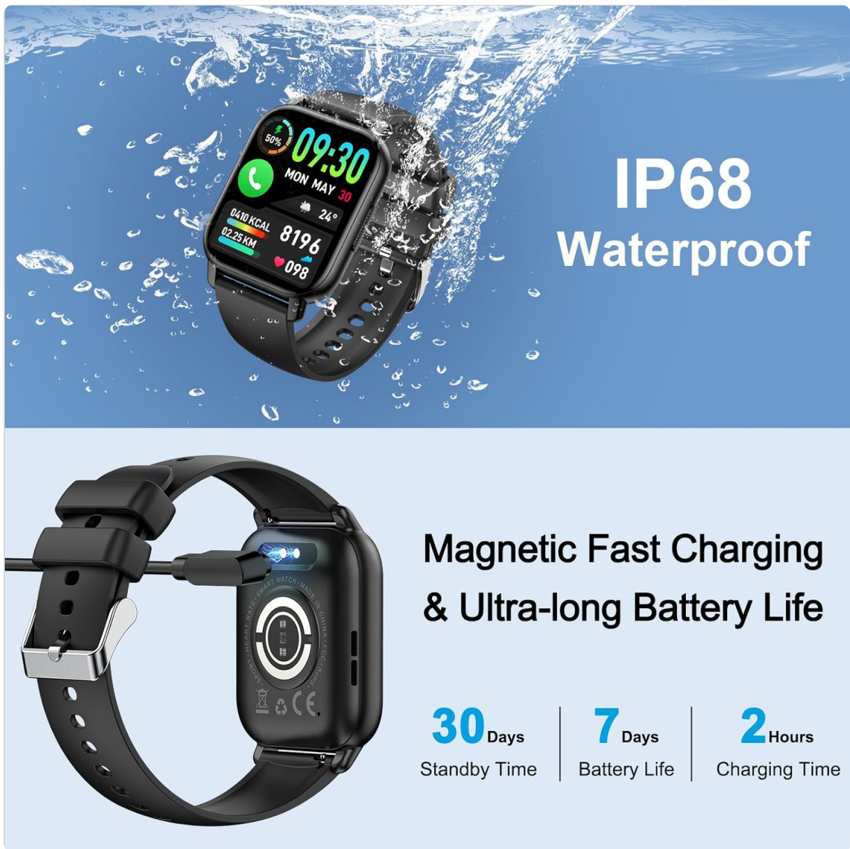
Image 4.1: Magnetic Fast Charging. The image shows the smartwatch connected to its magnetic charging cable, highlighting its IP68 waterproof rating and battery specifications.