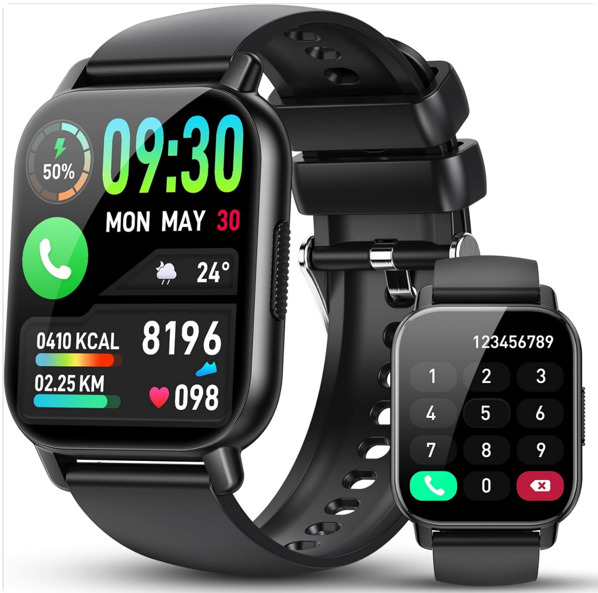
Image 3.1: WeurGhy Smartwatch Y6. The watch face displays current time, date, weather, battery level, step count, calorie burn, distance, and heart rate. A secondary image shows the watch's dial pad for making calls.