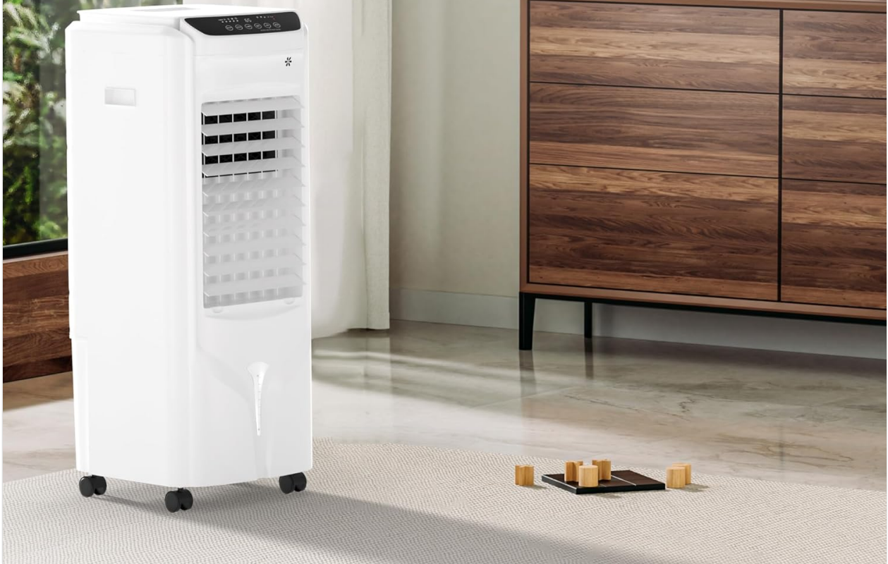
Image: The AKIRES Portable Evaporative Air Cooler showcasing its three primary functions: Fan (without water), Humidifier (add water), and Cooler (add water & ice).