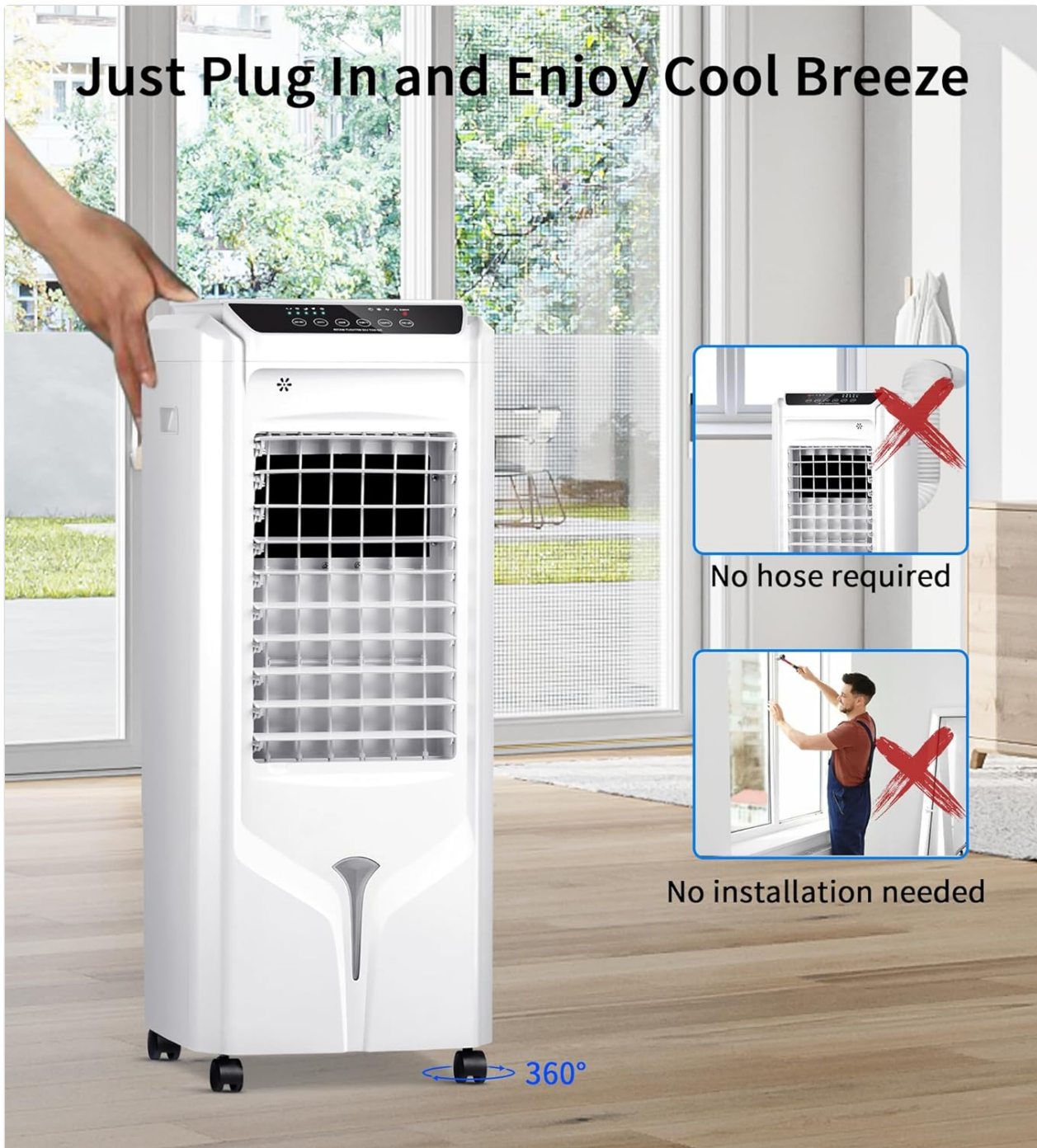
Image: The AKIRES Portable Evaporative Air Cooler on its wheels, being easily moved across a room, emphasizing that no complex installation is required.