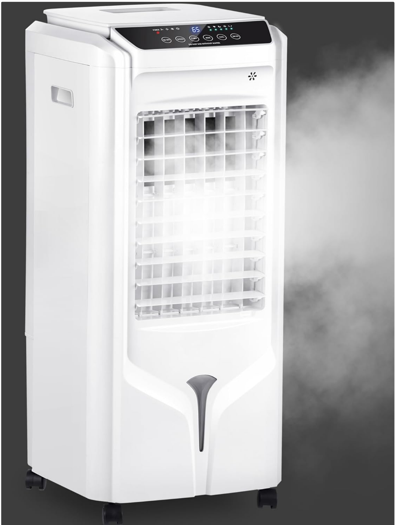
Image: A front view of the AKIRES Portable Evaporative Air Cooler, showing its sleek white design and the mist being emitted from the top.