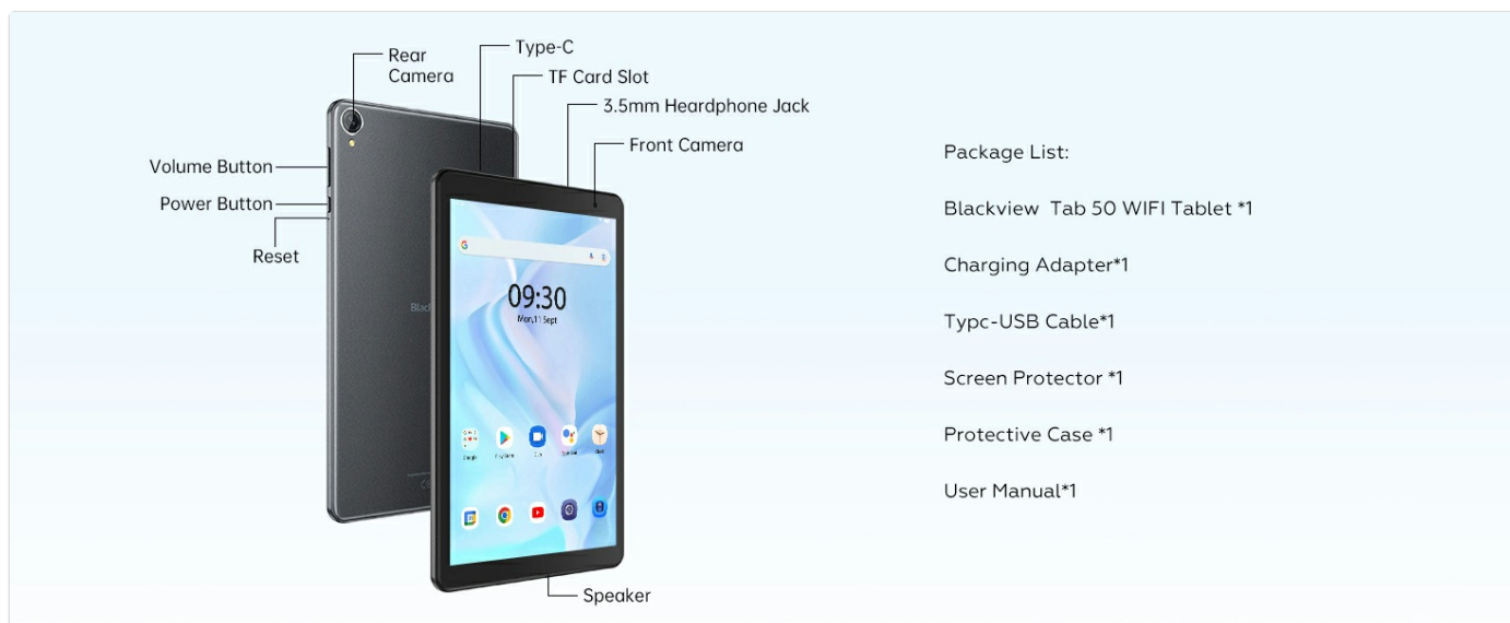
Image: Contents of the Blackview Tab 50 WIFI package, including the tablet, charging accessories, protective case, and screen protector.