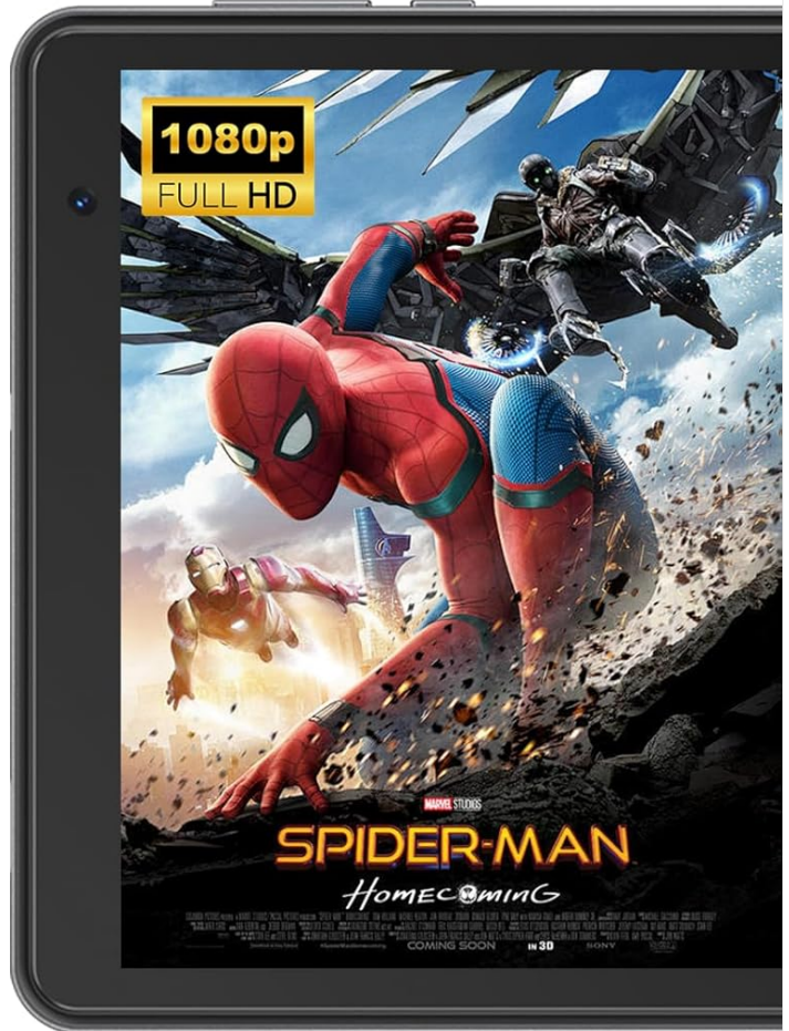
Image: Comparison showing 720p vs 1080p Full HD video streaming on the Blackview Tab 50 WIFI, highlighting Widevine L1 support for platforms like YouTube and Netflix.