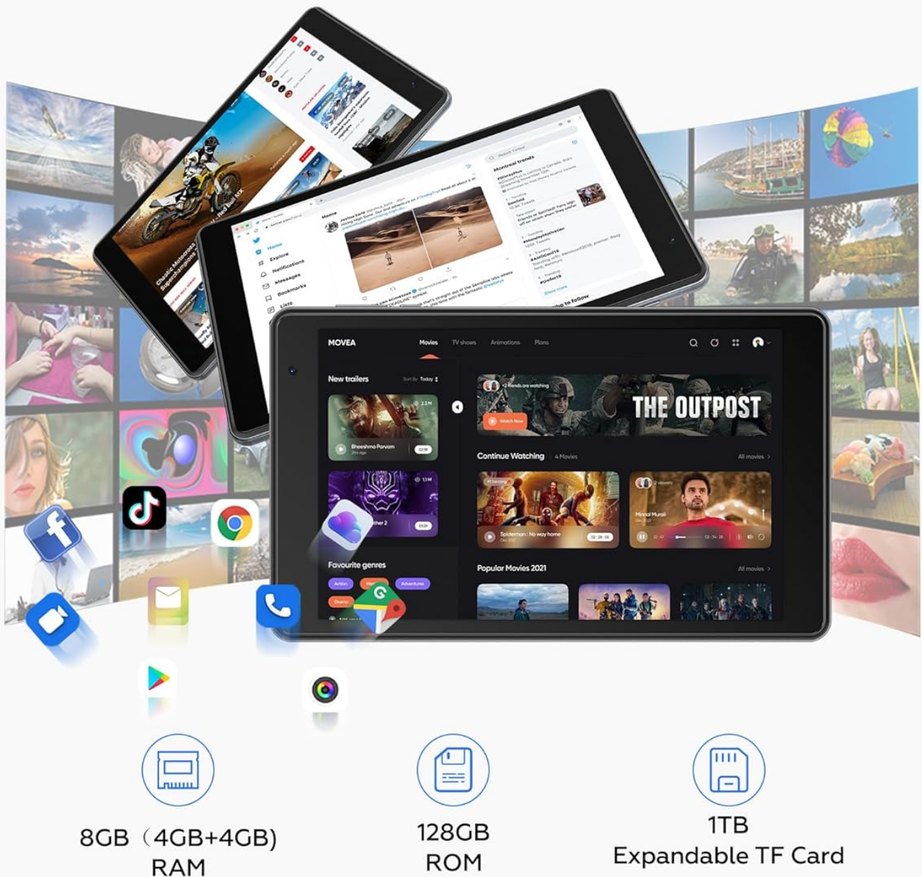
Image: Visual representation of the Blackview Tab 50 WIFI's 8GB RAM and 128GB ROM, expandable up to 1TB with a TF card.