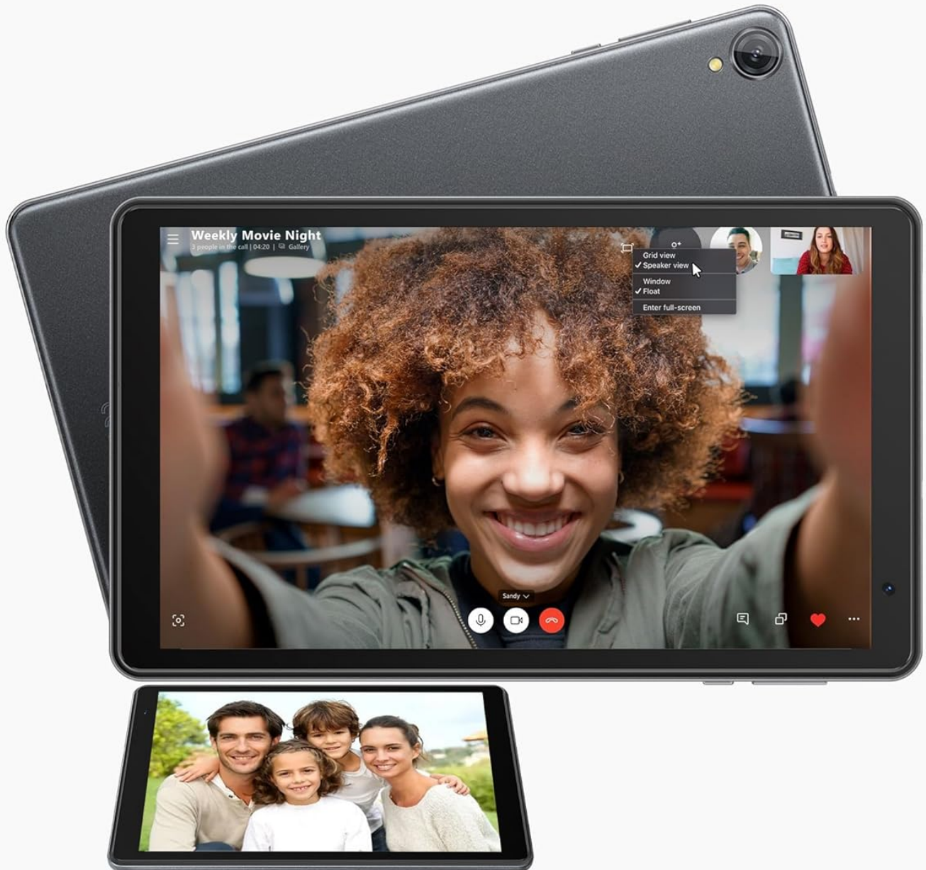
Image: The Blackview Tab 50 WIFI being used for video calls, demonstrating its front camera capabilities.