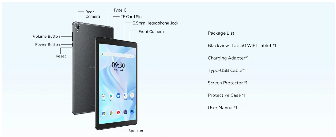
Image: Diagram illustrating the various components of the Blackview Tab 50 WIFI, including the rear camera, Type-C port, TF card slot, 3.5mm headphone jack, front camera, volume button, power button, reset button, and speaker.

Familiarize yourself with the physical components and controls of your Blackview Tab 50 WIFI.