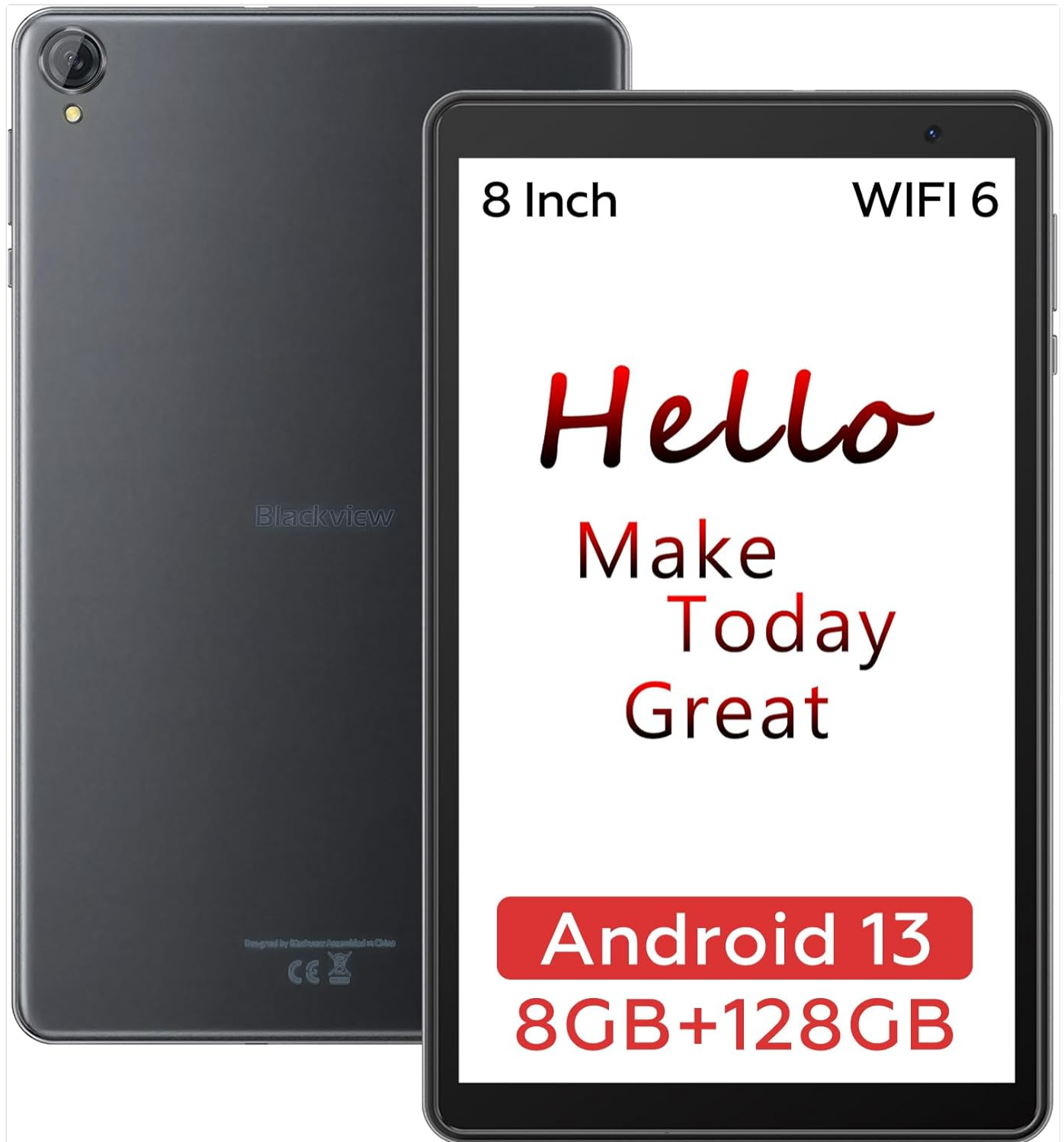
Image: The Blackview Tab 50 WIFI tablet, showcasing its compact design and 8-inch display.