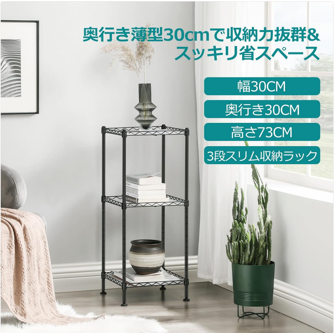
Figure 5: The rack's slim depth (30cm) allows it to fit into tight spaces, offering efficient storage without occupying much floor area.