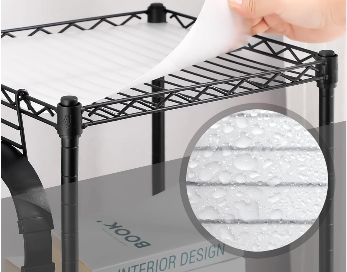
Figure 7: The premium 0.5mm PP liners are waterproof and simplify cleaning, protecting items from the wire grid.