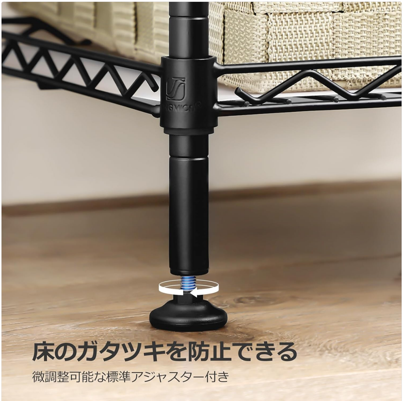
Figure 4: The adjustable feet ensure stability and prevent wobbling on uneven floors.