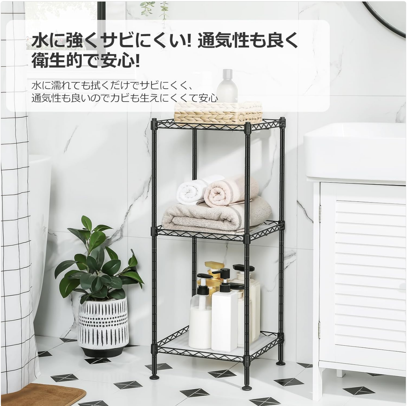
Figure 6: The rack's material is resistant to water and rust, and its open design ensures good ventilation for hygienic storage.