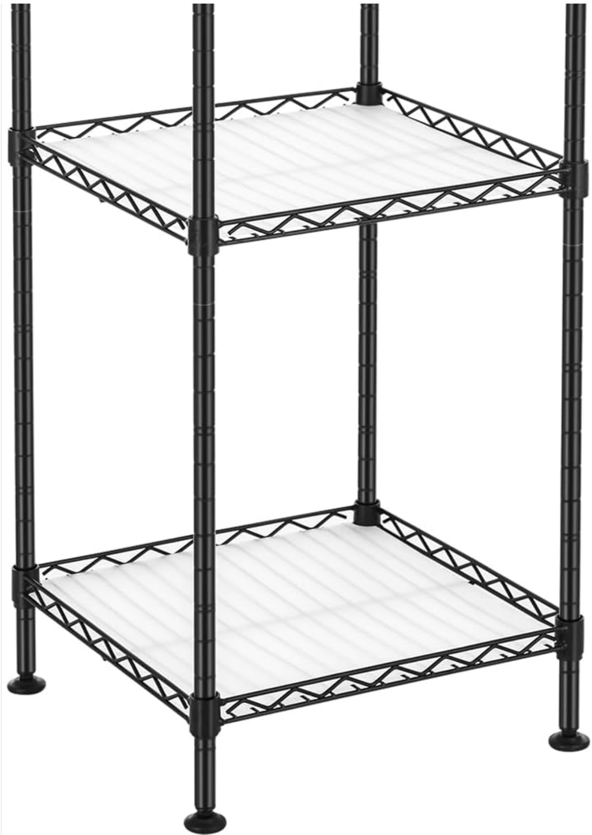
Figure 1: Main view of the SONGMICS 3-Tier Slim Steel Rack.