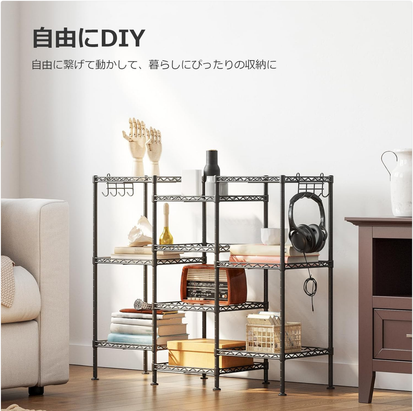
Figure 3: The rack's design allows for flexible shelf height adjustment, enabling efficient use of storage space for various items.