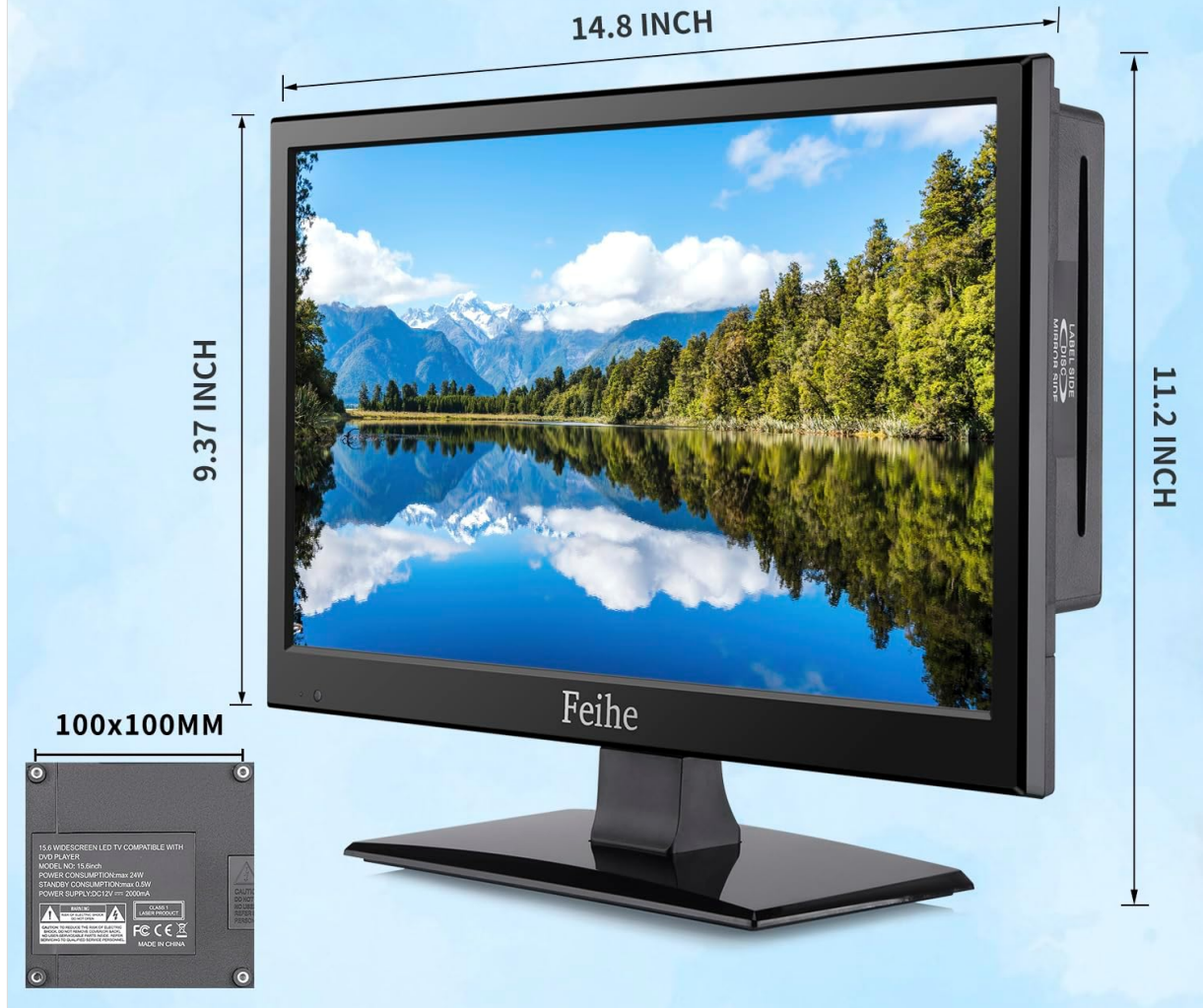
Image: Side view of the ZOSHING TV, showing the slot for the built-in DVD player.

PLEASE SEE DIMENSIONS BELOW TO ENSURE FITMENY