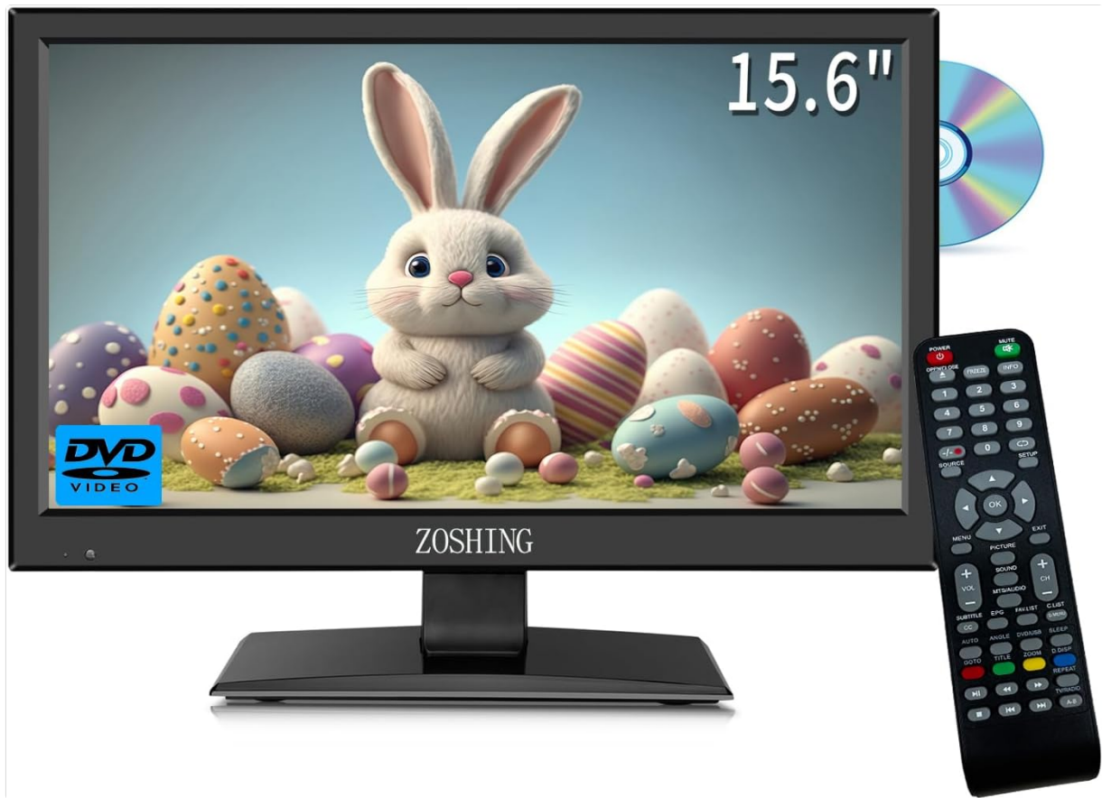
Image: Front view of the ZOSHING 16-inch TV, showing the screen displaying an image of a rabbit, a remote control, and a DVD disc. The screen size is indicated as 15.6 inches.