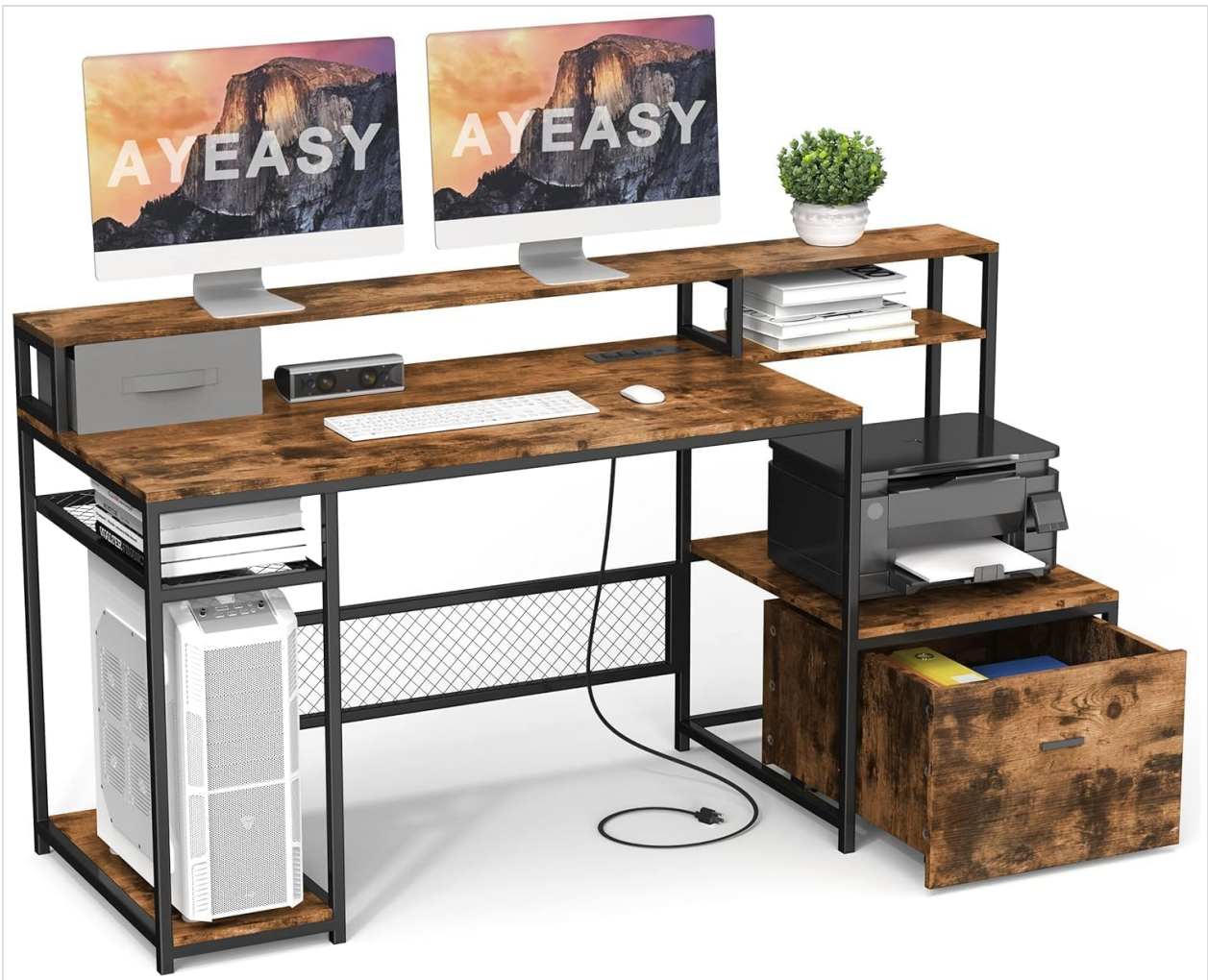
Image 1.1: Overview of the AYEASY 66-Inch Rustic Brown Computer Desk, showcasing its dual monitor setup, integrated power strip, and storage options.