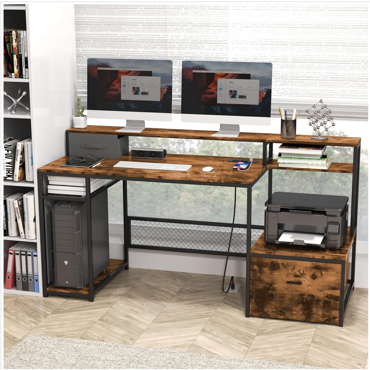
Image 5.3: Examples of the desk's storage capabilities, including the file drawer, PC tower space, and printer shelf.