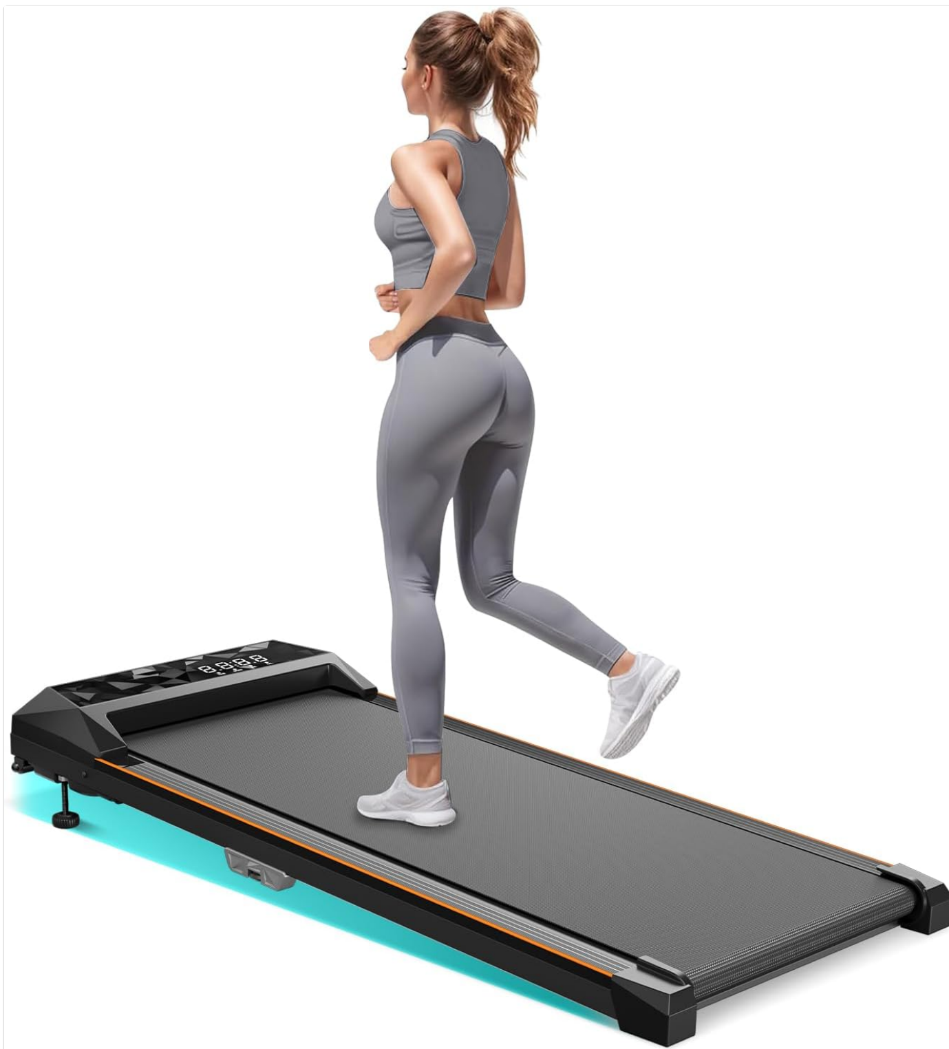
Figure 1: AIRHOT Walking Pad Treadmill in use.

This image displays the AIRHOT Walking Pad Treadmill in operation, demonstrating its use for fitness activities.