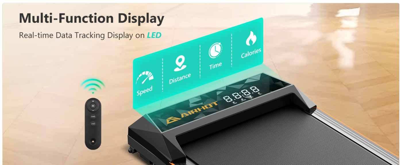
Figure 2: Included Components

This image displays the AIRHOT Walking Pad Treadmill along with its accessories: a bottle of lubricating oil, the instruction manual, an L-shaped wrench, the remote control, and batteries.