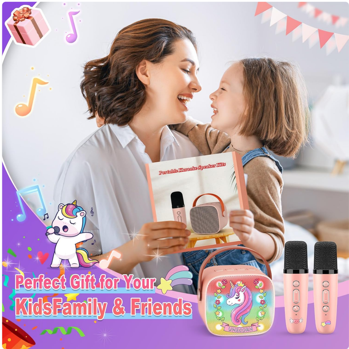
Figure 1: Package Contents. The image displays the main speaker unit, two wireless microphones, a USB charging cable, and a user manual, illustrating all items included in the product package.