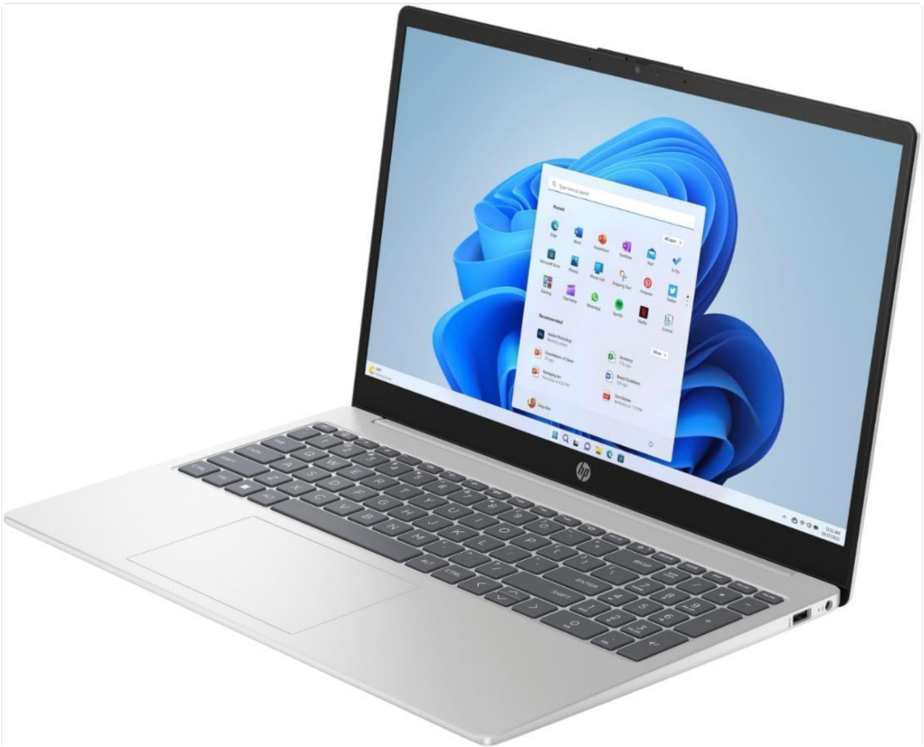
Figure 3: Close-up view of the laptop's keyboard and large touchpad.

The laptop features a full-size keyboard with a dedicated numeric keypad for efficient data entry. The integrated touchpad supports multi-touch gestures for intuitive navigation.