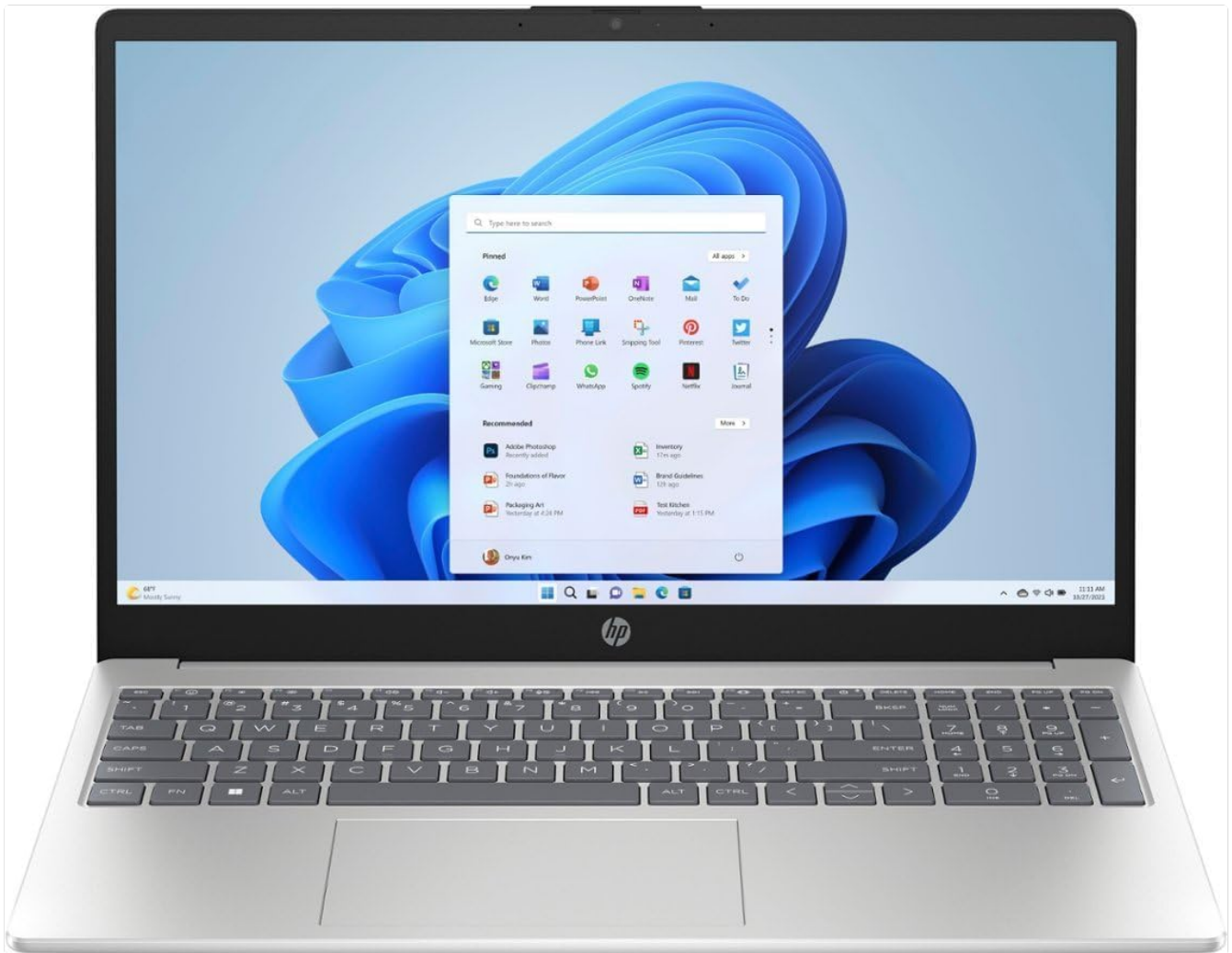
Figure 1: Front view of the HP 15.6 Full HD Laptop displaying the Windows 11 desktop interface.