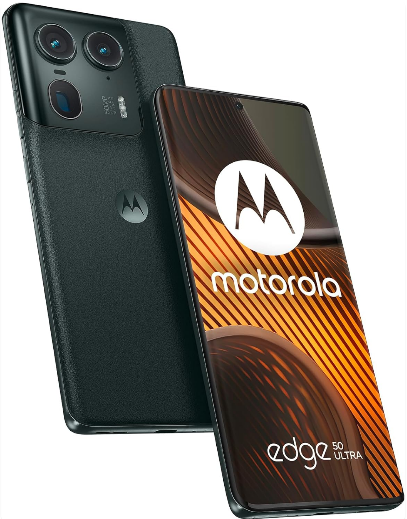
The Motorola Edge 50 Ultra 5G in Forest Grey, showcasing its sleek design and camera module.