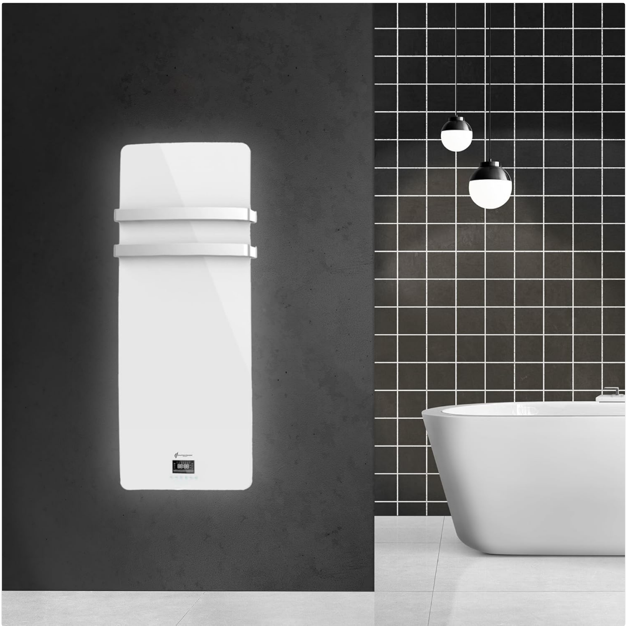
Image 5.1: The Sannover Omiros towel dryer elegantly installed on a bathroom wall, demonstrating typical placement.