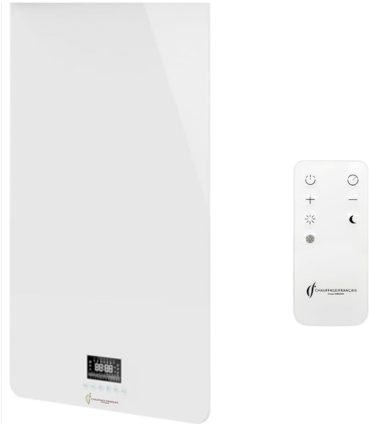
Image 1.1: Front view of the Sannover Omiros 850W Wall-Mounted Electric Glass Towel Dryer with its wireless remote control.