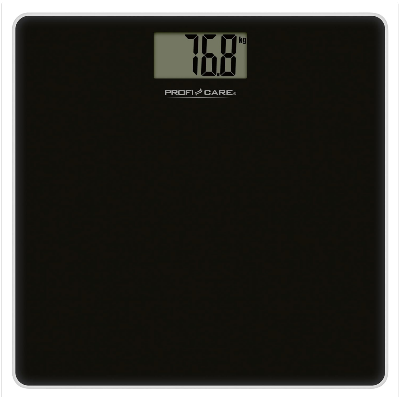
Image: Front view of the ProfiCare PC-PW3122 electronic personal scale, displaying a weight of 76.8 kg on its LCD screen. The scale has a black tempered glass surface.