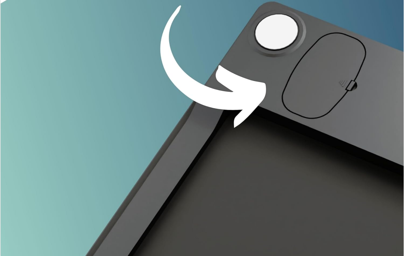
Image: A close-up showing the quick-access battery compartment on the underside of the scale, indicating ease of battery replacement.