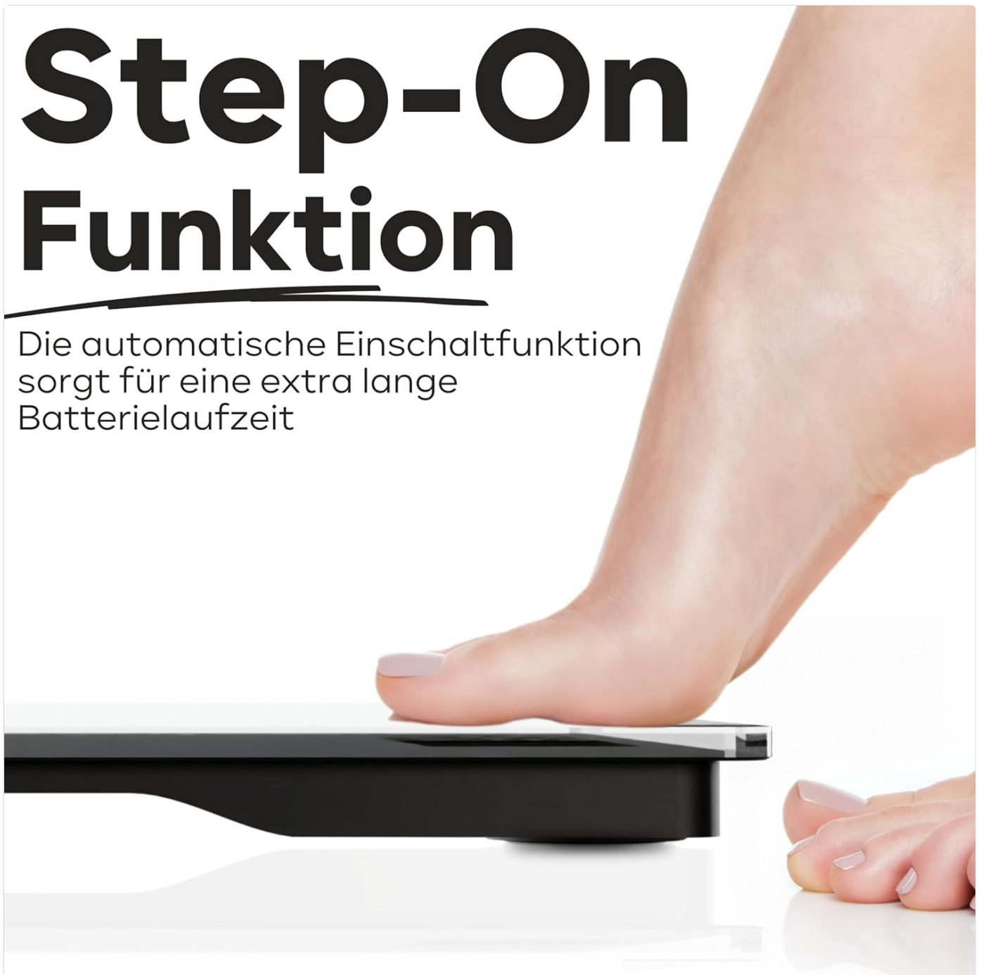
Image: A foot stepping onto the ProfiCare scale, illustrating the "Step-On" function where the scale automatically activates upon contact. This automatic turn-on feature ensures extended battery life.

Die automatische Einschaltfunktion sorgt für eine extra lange Batterielaufzeit