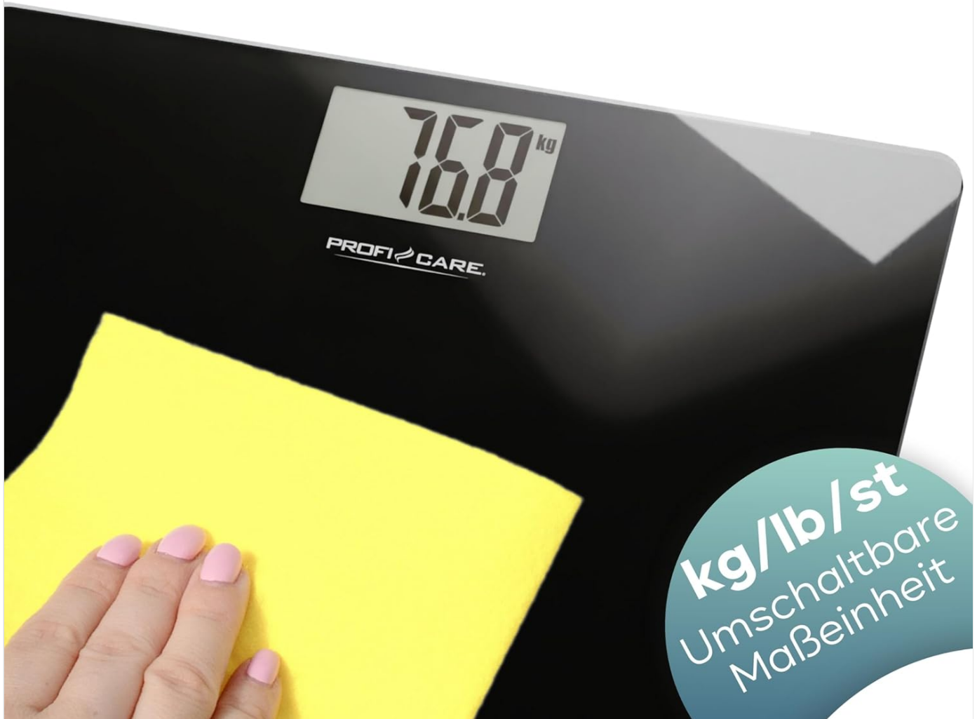
Image: A close-up of the ProfiCare scale's high-quality LCD display, showing a weight reading of 76.8 kg. The display is clearly visible, even in poor lighting conditions.

Die hochwertige Glasoberfläche lässt sich sehr einfach sauber halten