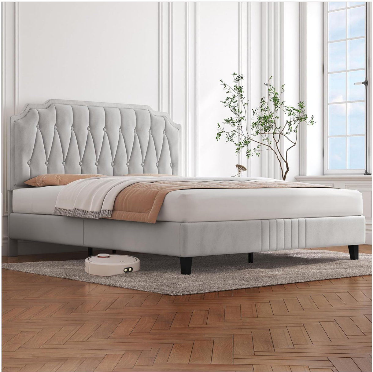
Image: The Yaheetech Double Upholstered Bed Frame in a bedroom, illustrating its design and the ample ground clearance for cleaning robots.