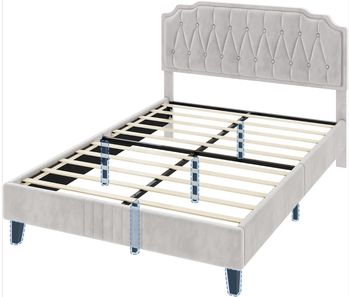
Image: Multi-support structure of the bed frame, highlighting the stable and sturdy design capable of holding up to 363 kg.

Stable and sturdy structure holds up to 363 kg