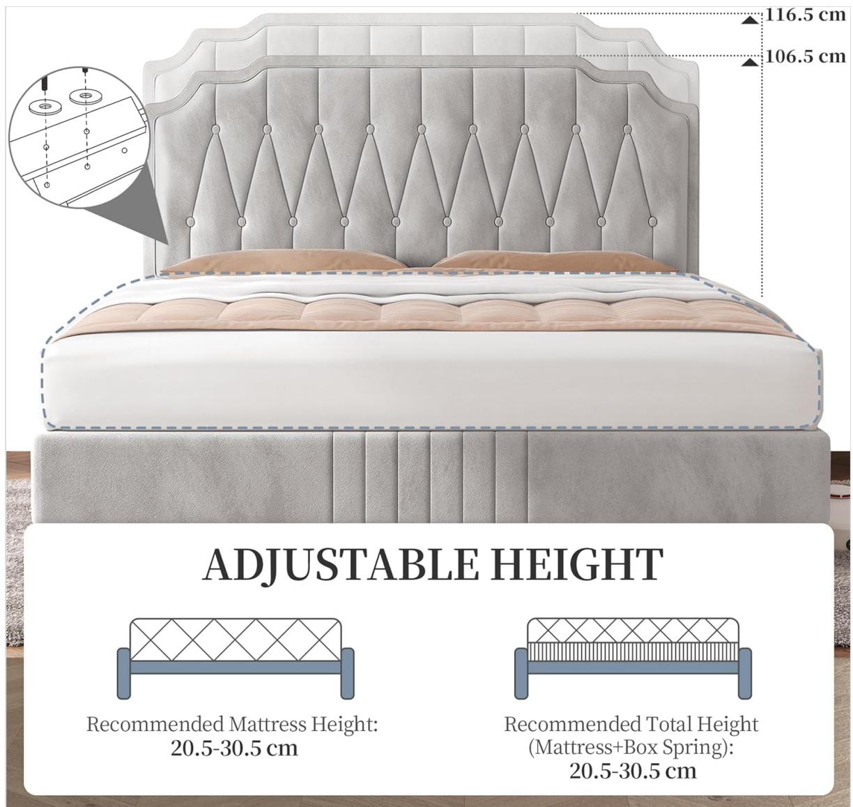
Image: Adjustable headboard height mechanism. The headboard can be set to different heights to suit your mattress.