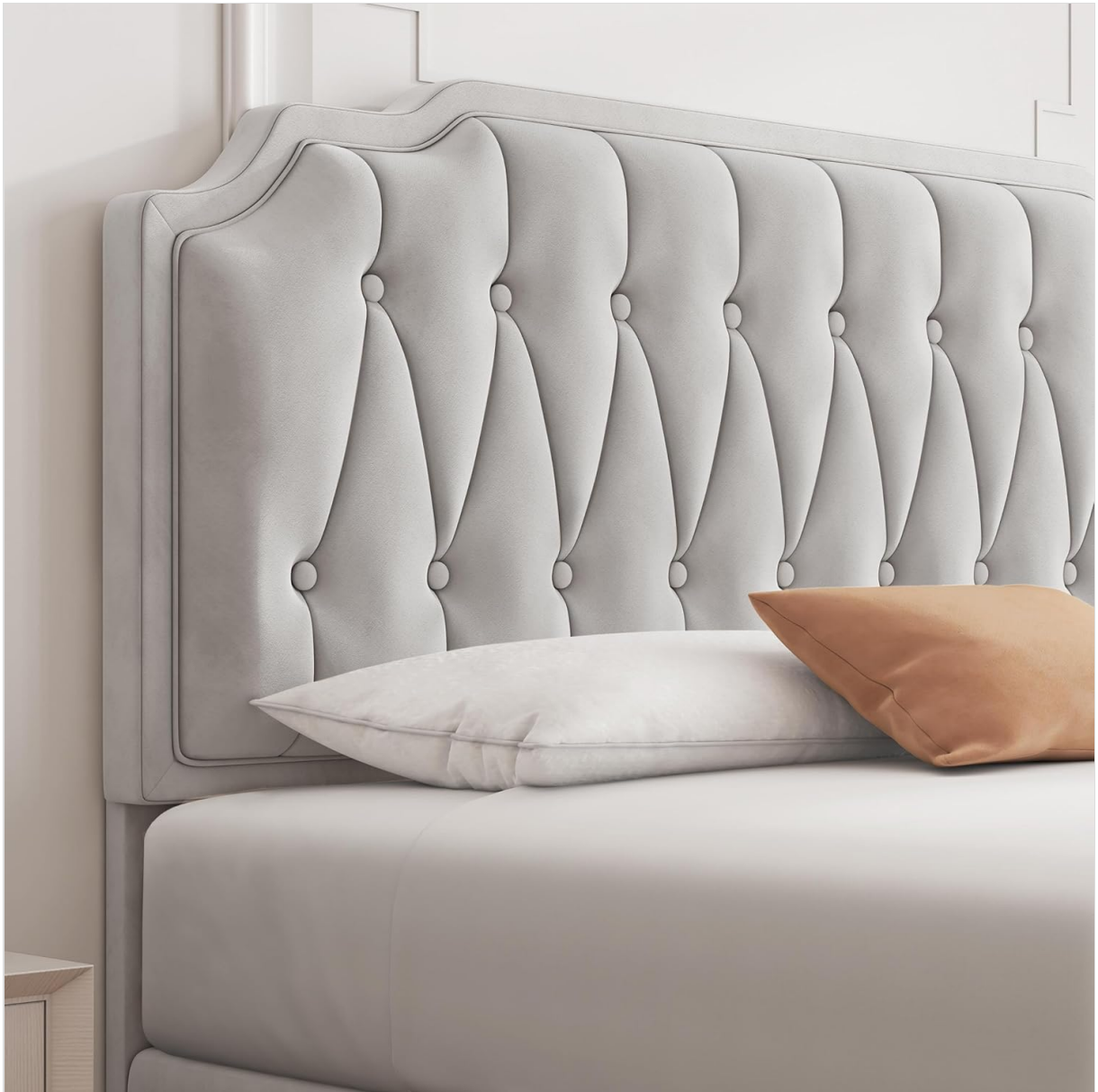
Image: A close-up view of the tufted velvet headboard, showcasing the soft, comfortable cushioning and button detailing.