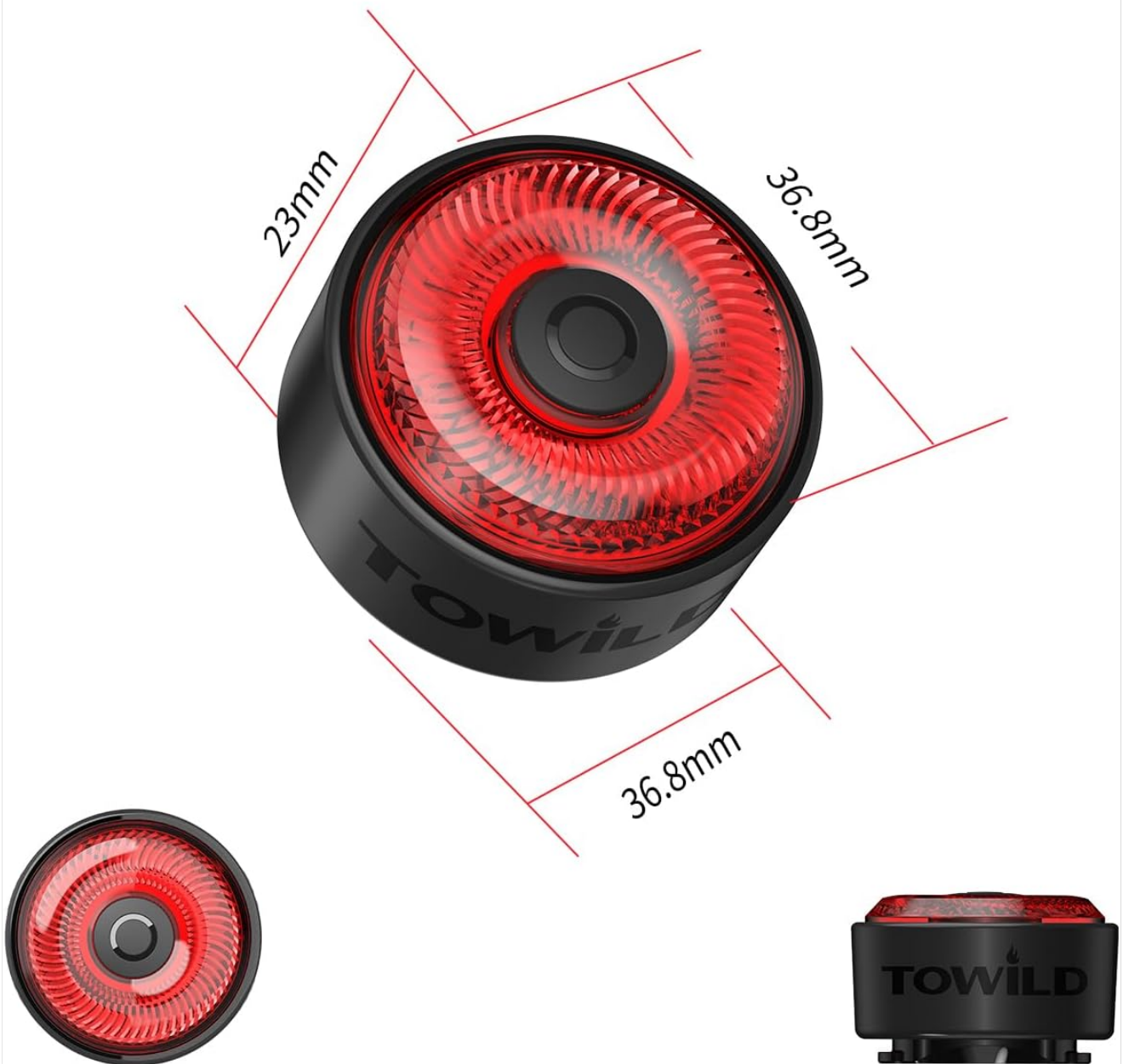
Detailed dimensions of the TOWILD TL03 tail light, illustrating its compact and lightweight design.