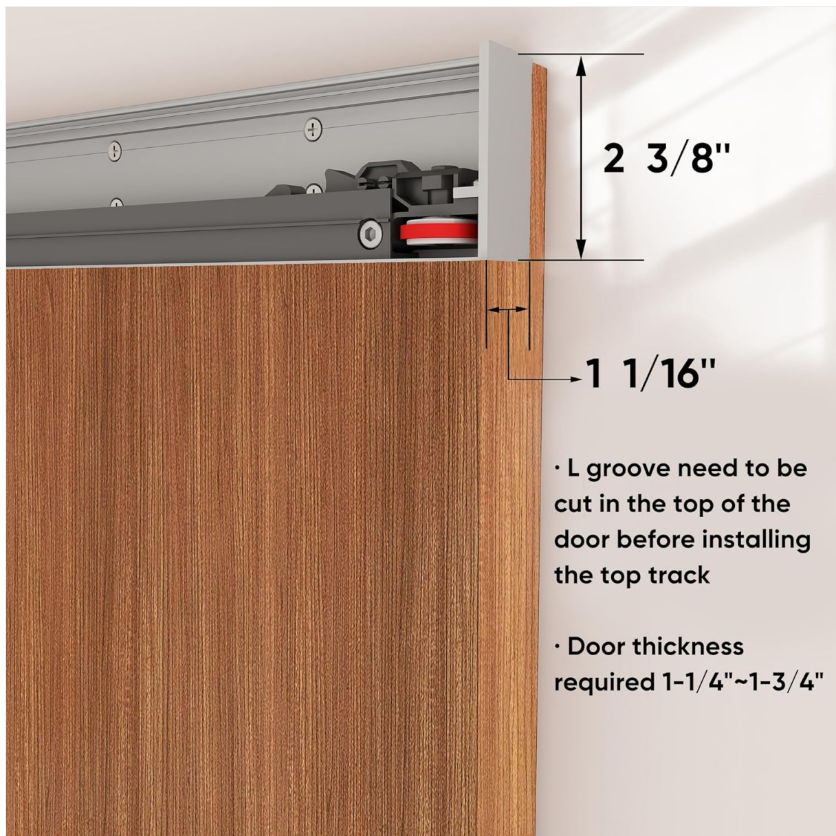
Figure 6: Required L-groove dimensions for the top of the door and overall door thickness.