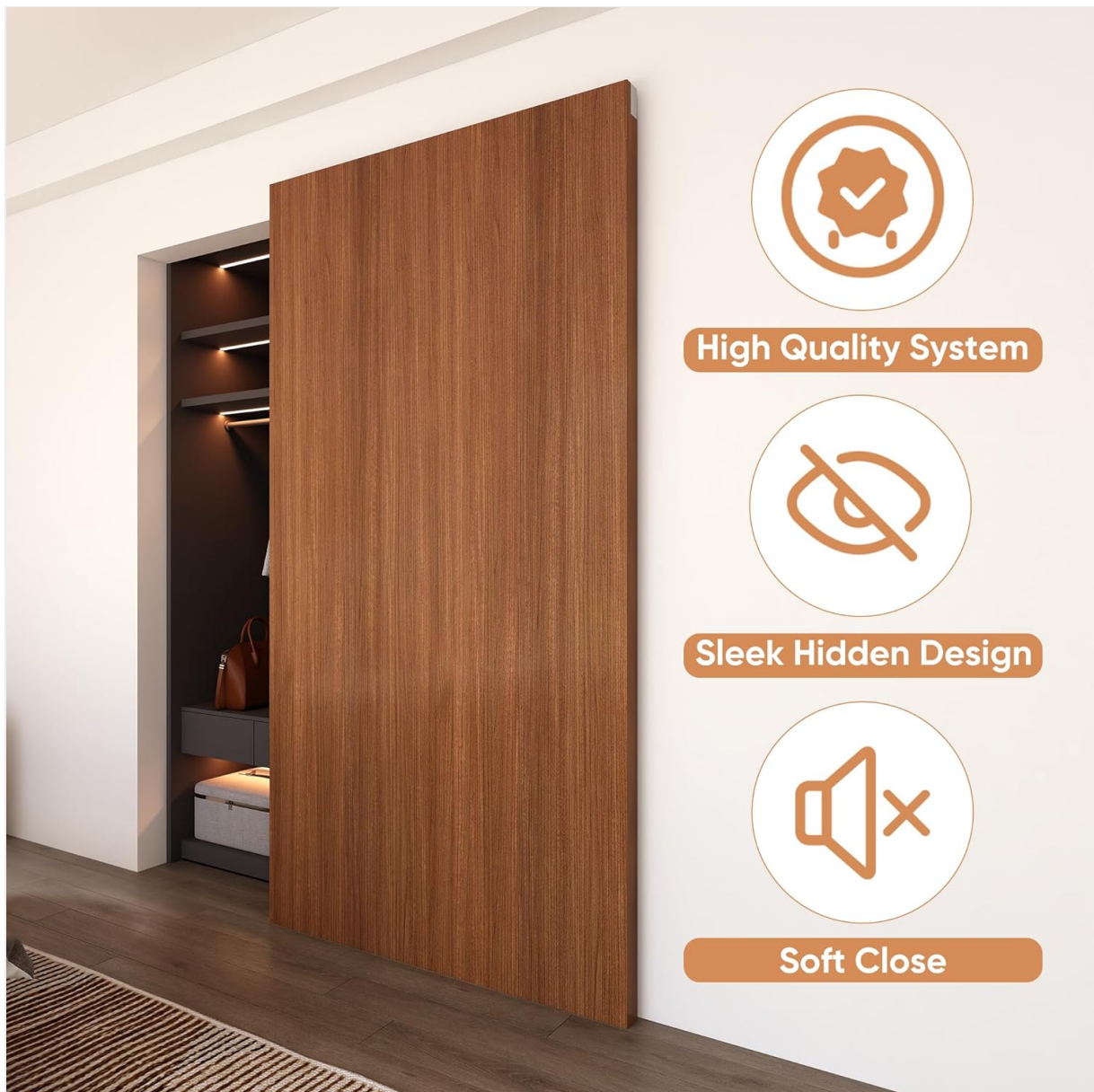
Figure 2: Key features of the JUBEST Concealed Barn Door Hardware Kit.