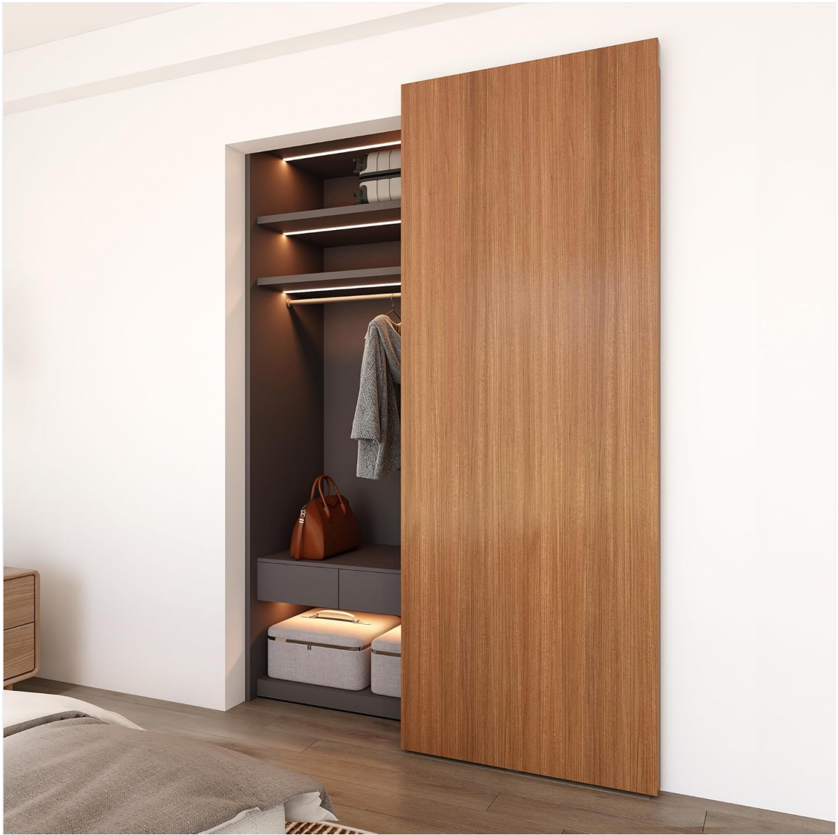
Figure 1: Example of an installed JUBEST Concealed Barn Door System.