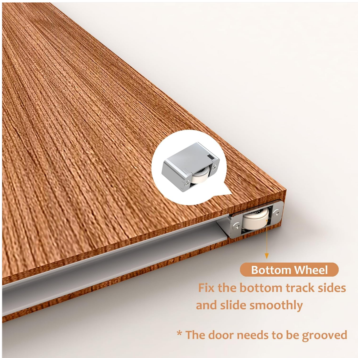
Figure 5: Bottom wheel installation and door grooving requirement.