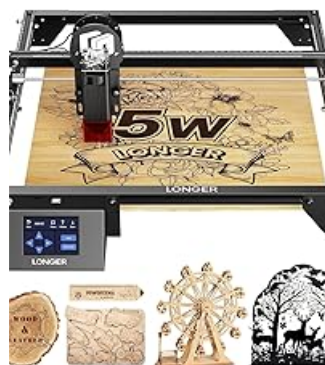
Figure 8: Detailed technical specifications of the LONGER Ray5 5W laser module.