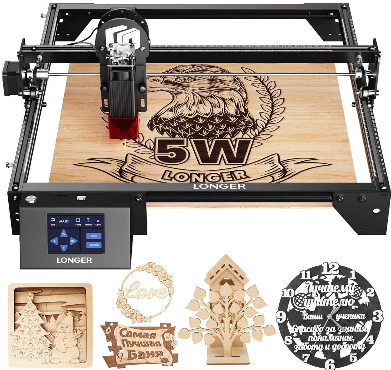
Figure 1: The LONGER Ray5 5W Laser Engraver, showcasing its design and an example of an engraved wooden piece.