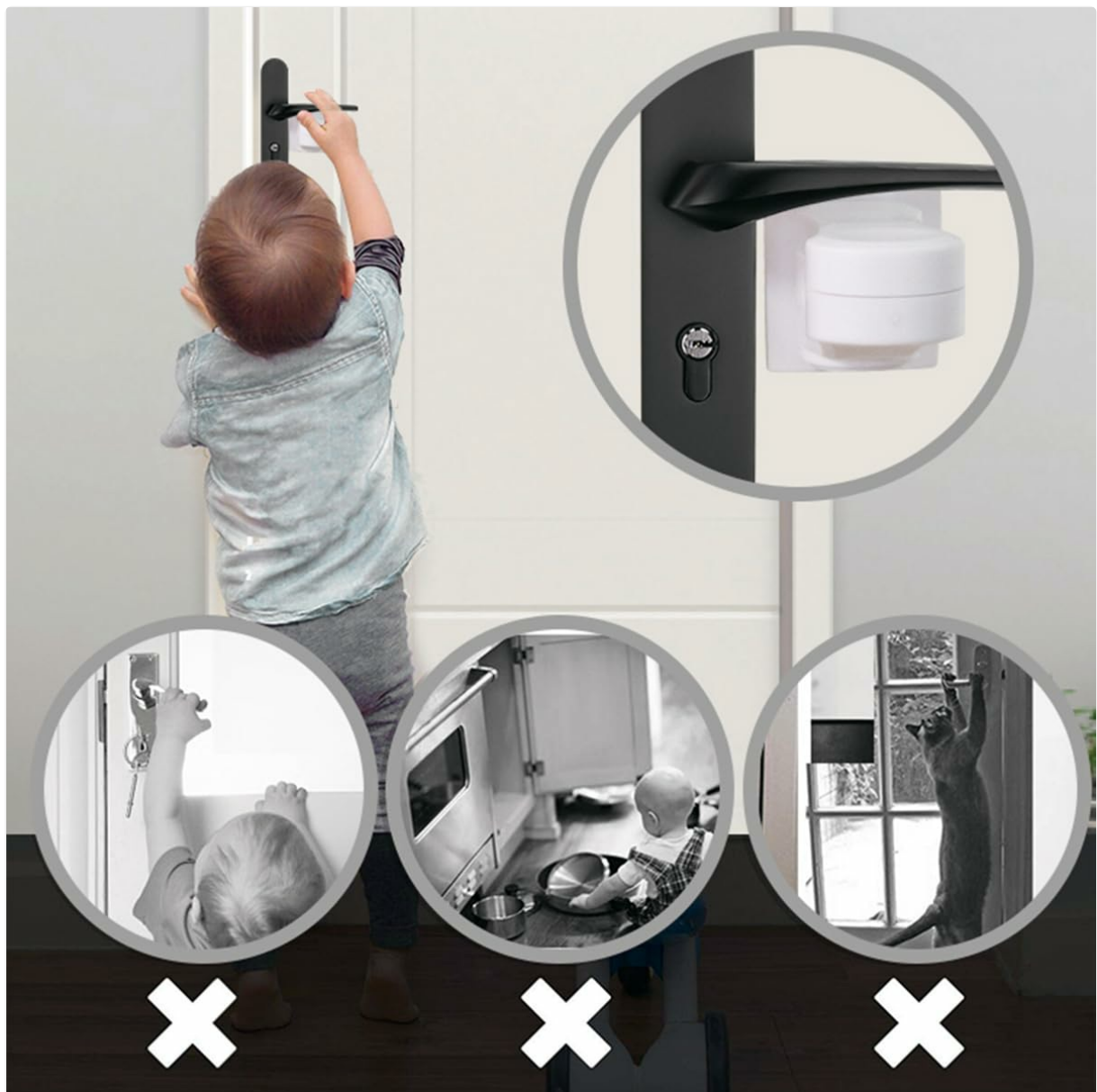
Image: The lock effectively prevents children from opening doors and accessing potentially hazardous areas.