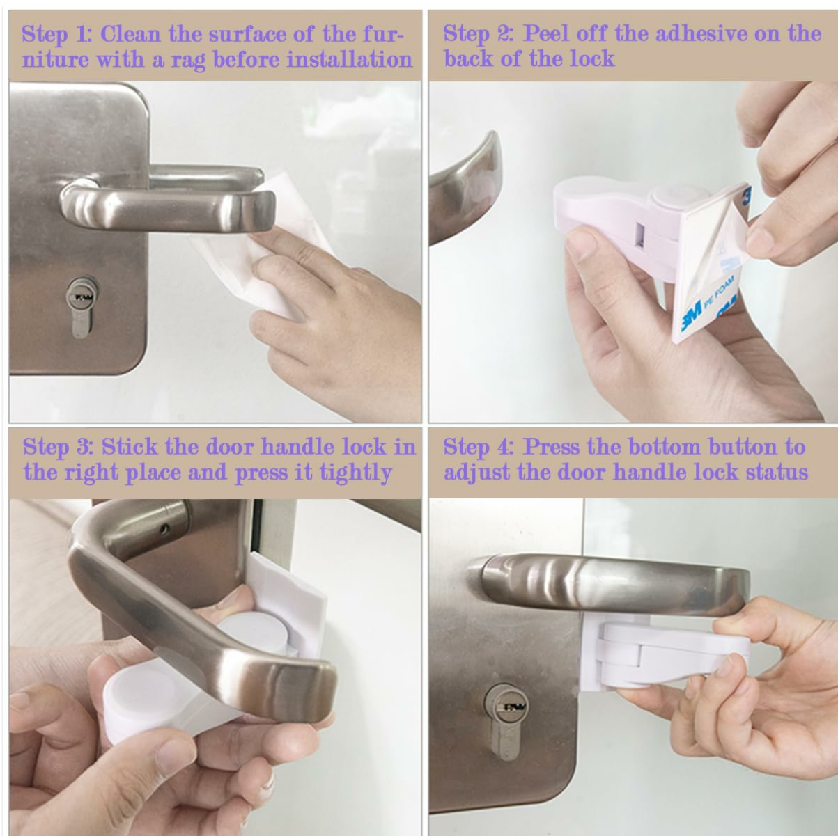
Image: Visual guide demonstrating the four simple steps for installing the door lever lock.