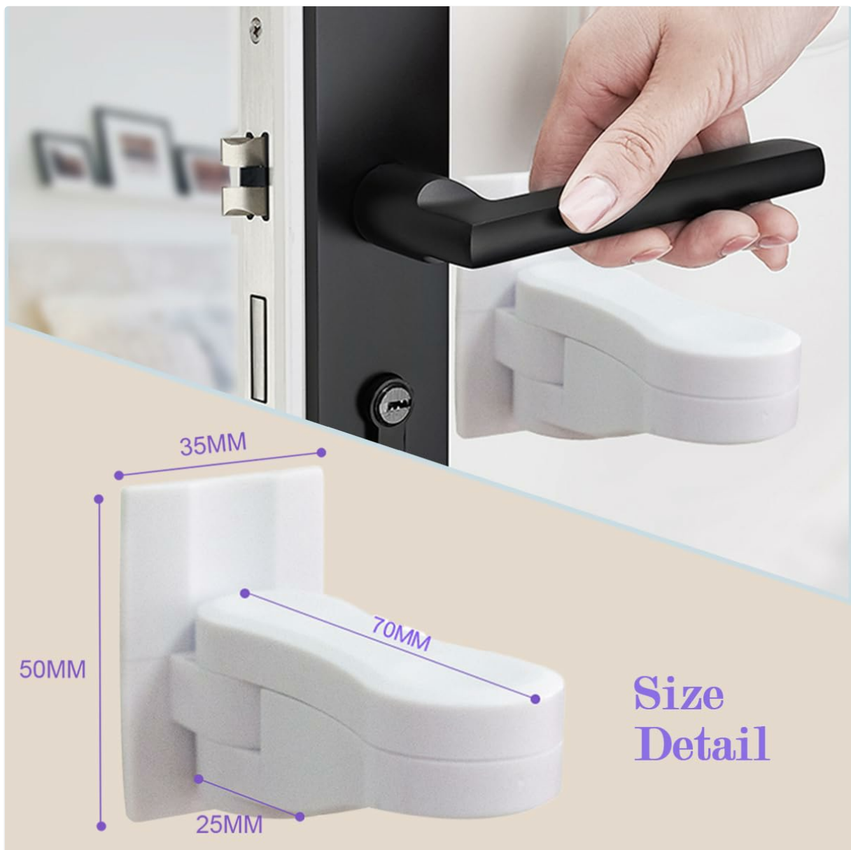
Image: Detailed dimensions of the KongNai Child Proof Door Lever Lock, showing its compact size.