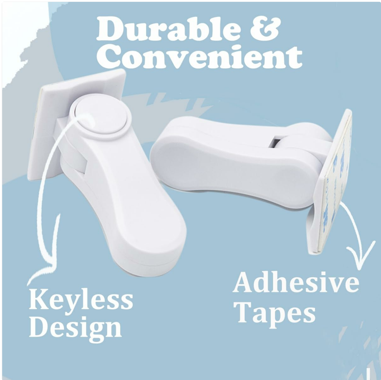
Image: Close-up view highlighting the keyless design and the strong adhesive tapes for secure mounting.