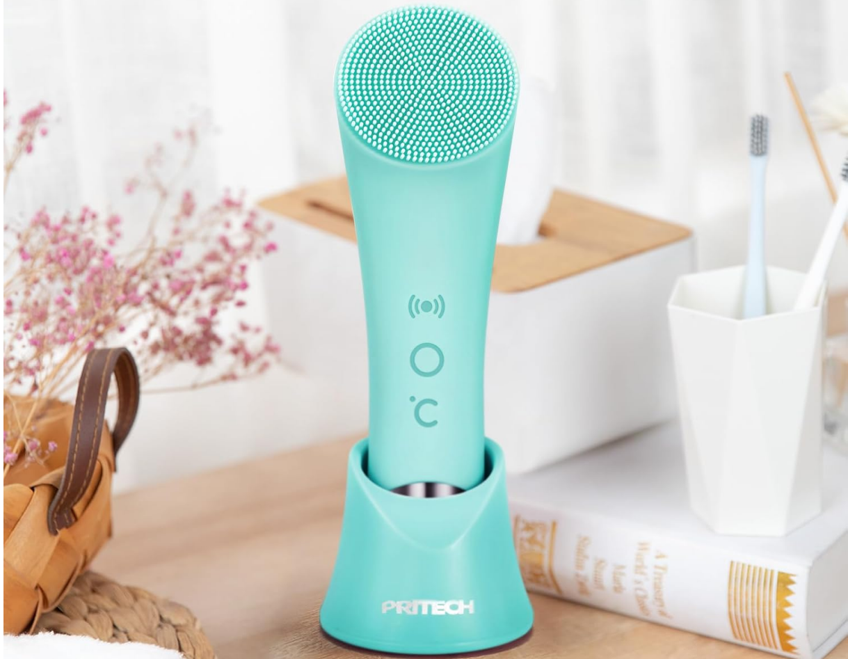
Image: The facial cleansing brush stored on its practical stand base.