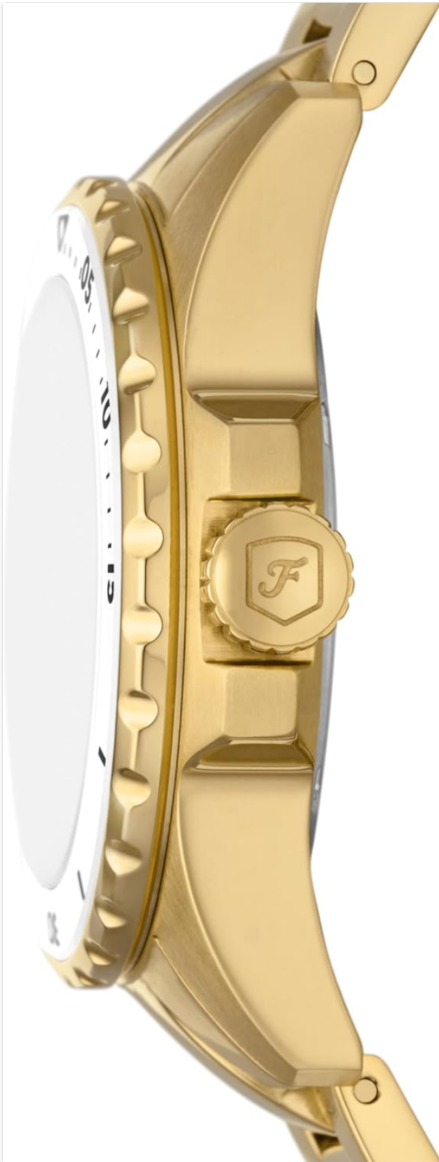
Figure 2: Side view of the watch, highlighting the crown for time adjustment and the unidirectional rotating bezel.