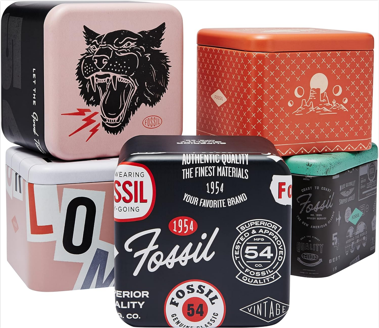
Figure 5: Example of Fossil watch tins, suitable for storage.

When not in use, store your watch in a cool, dry place, away from direct sunlight and extreme temperatures. The original Fossil tin (see Figure 5) provides excellent protection.