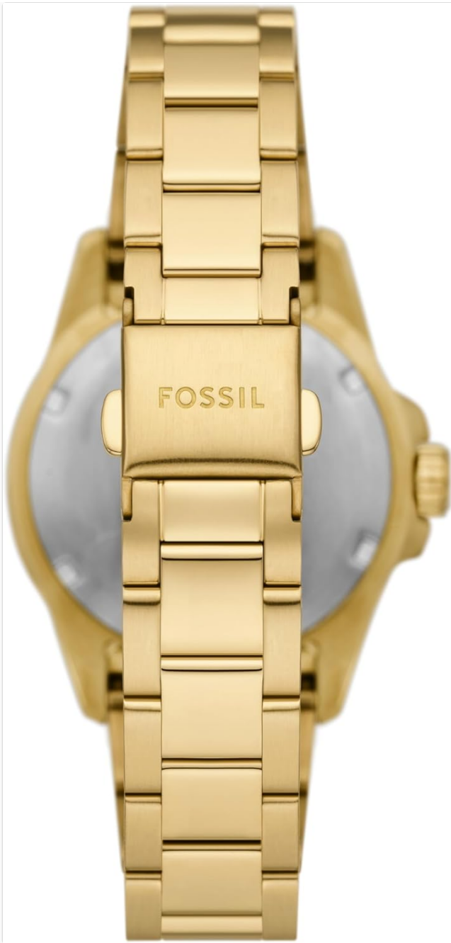
Figure 3: Rear view of the watch band, showing the fold-over clasp with the Fossil logo.