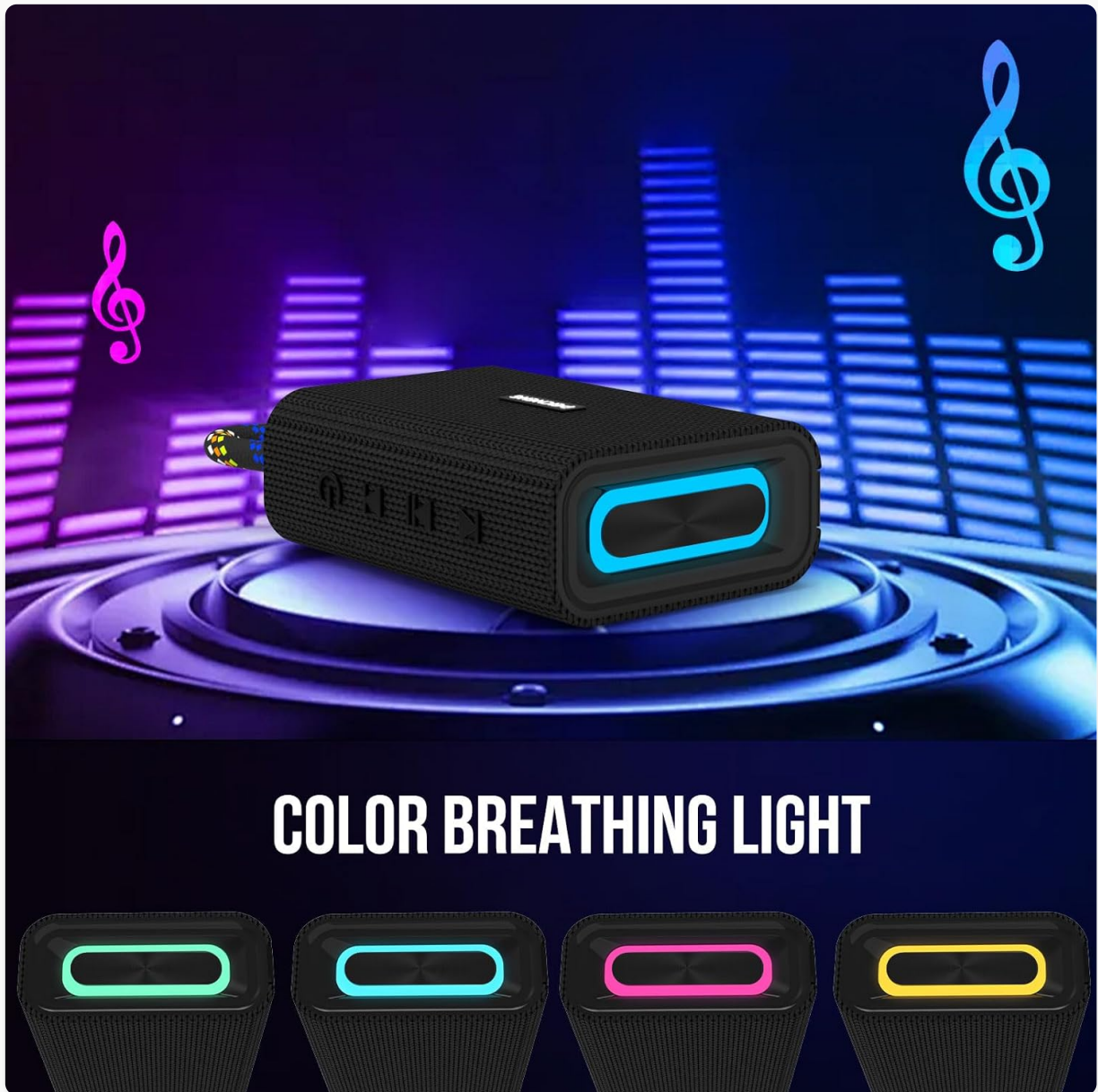
Image: The Bnegyng speaker displaying its vibrant RGB lighting effects, with various color options shown below.