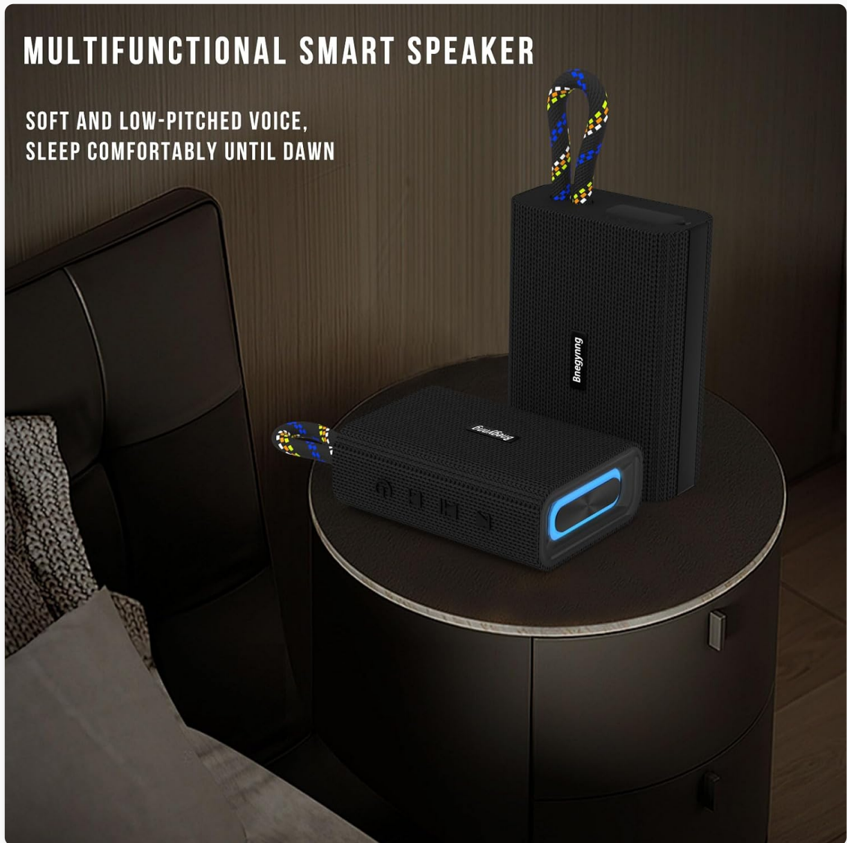
Image: Two Bnegynng speakers positioned on a nightstand, illustrating the True Wireless Stereo (TWS) pairing capability for enhanced sound.