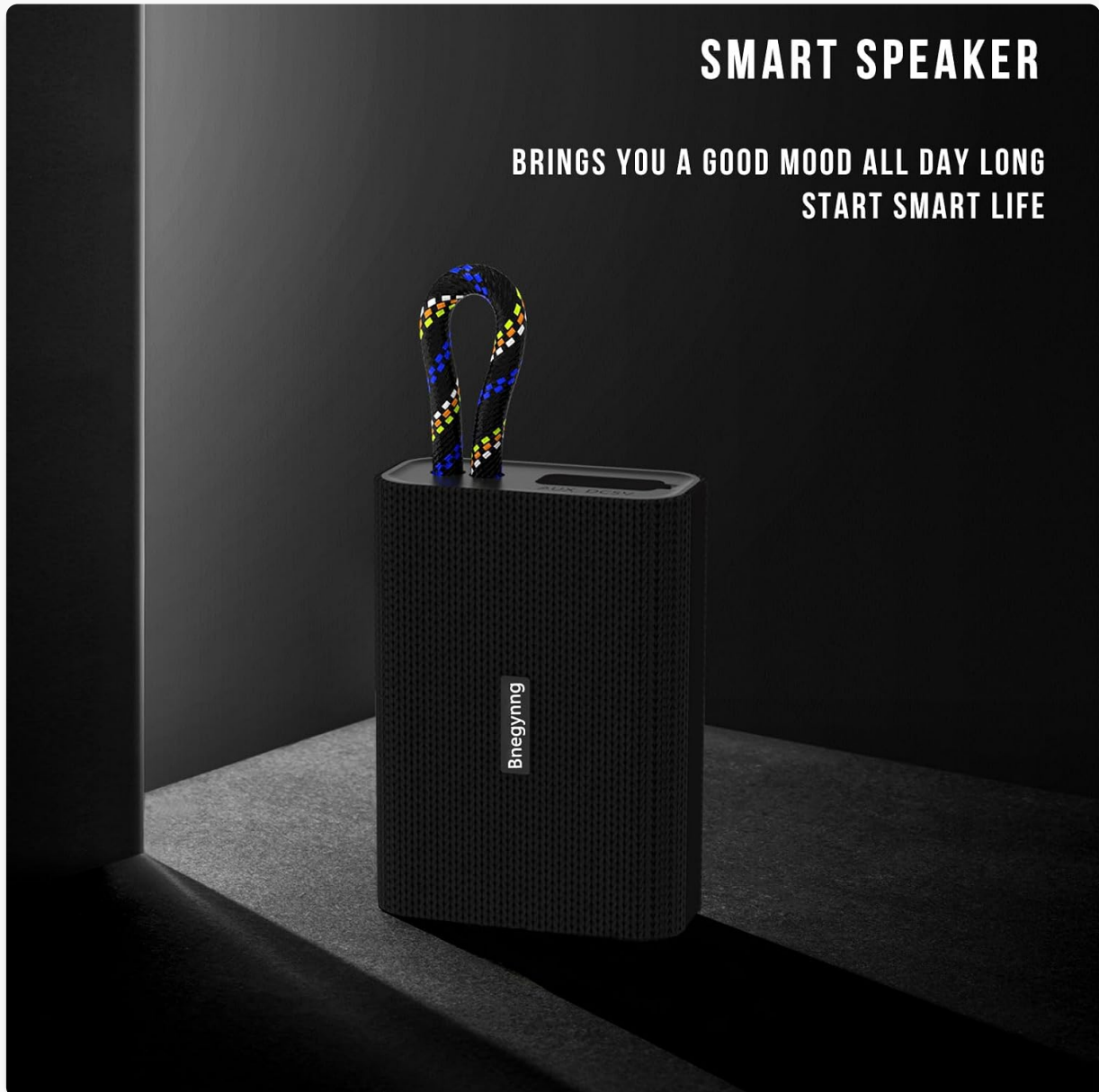
Image: The Bnegynng speaker connected wirelessly to a smartphone, demonstrating its portable use.