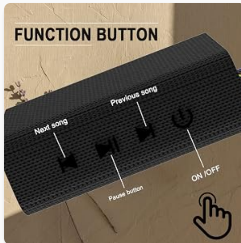
Image: Close-up view of the speaker's side panel showing the function buttons: Next Song, Previous Song, Pause Button, and ON/OFF button.

Familiarize yourself with the speaker's components and controls.