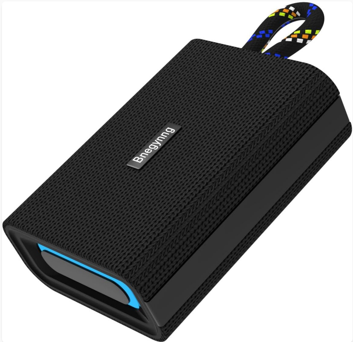
Image: The Bnegynng Portable Bluetooth Speaker, a compact black device with a colorful lanyard and blue light accent.