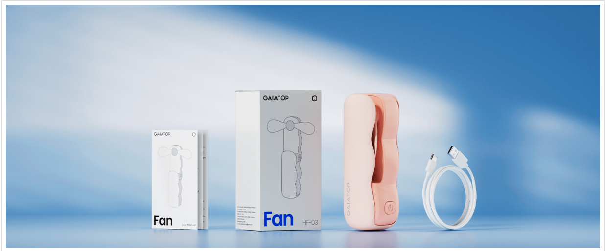
Figure 1: USB Type-C Charging Port

The fan is ready for use once fully charged.