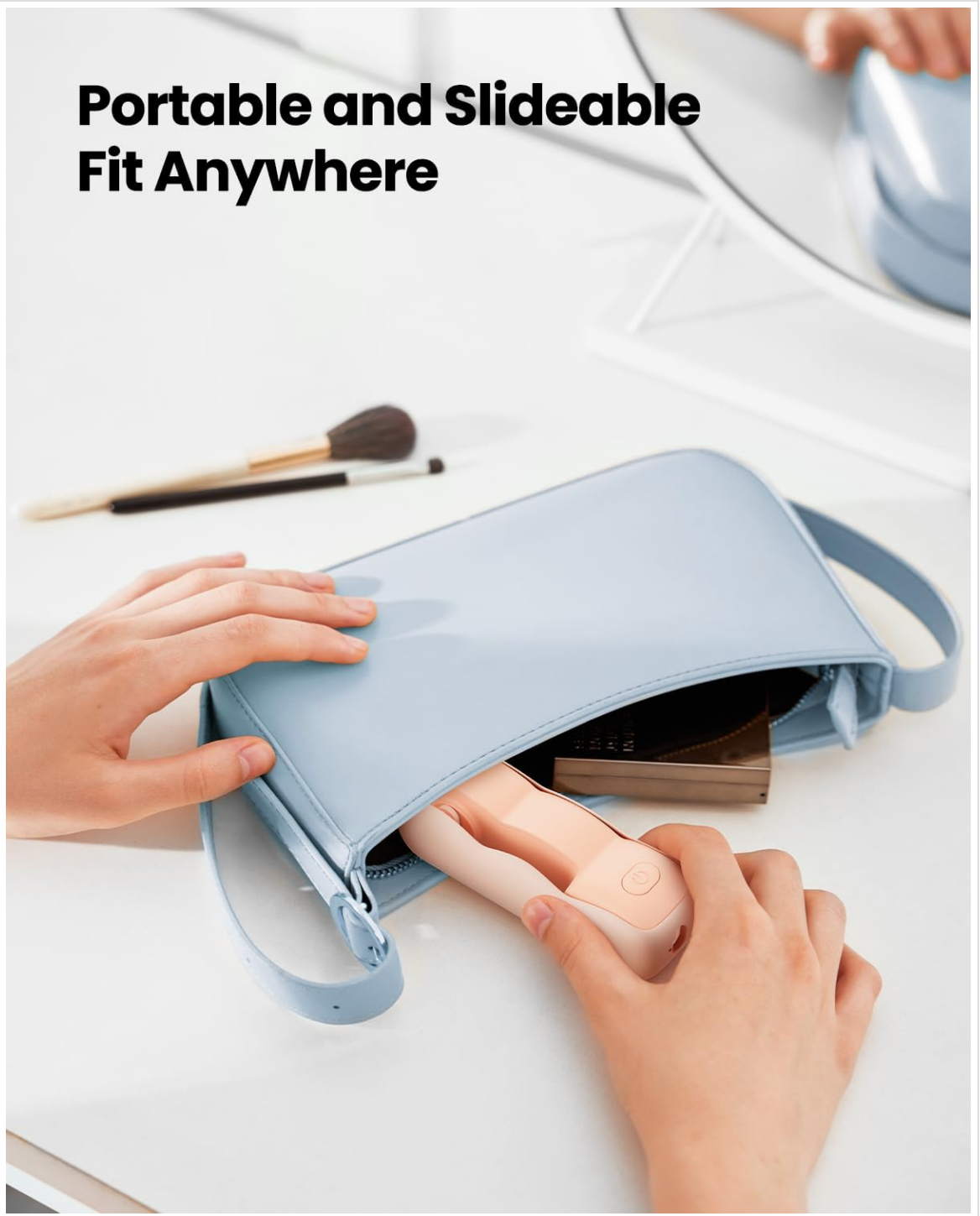
Figure 4: Fan in closed position