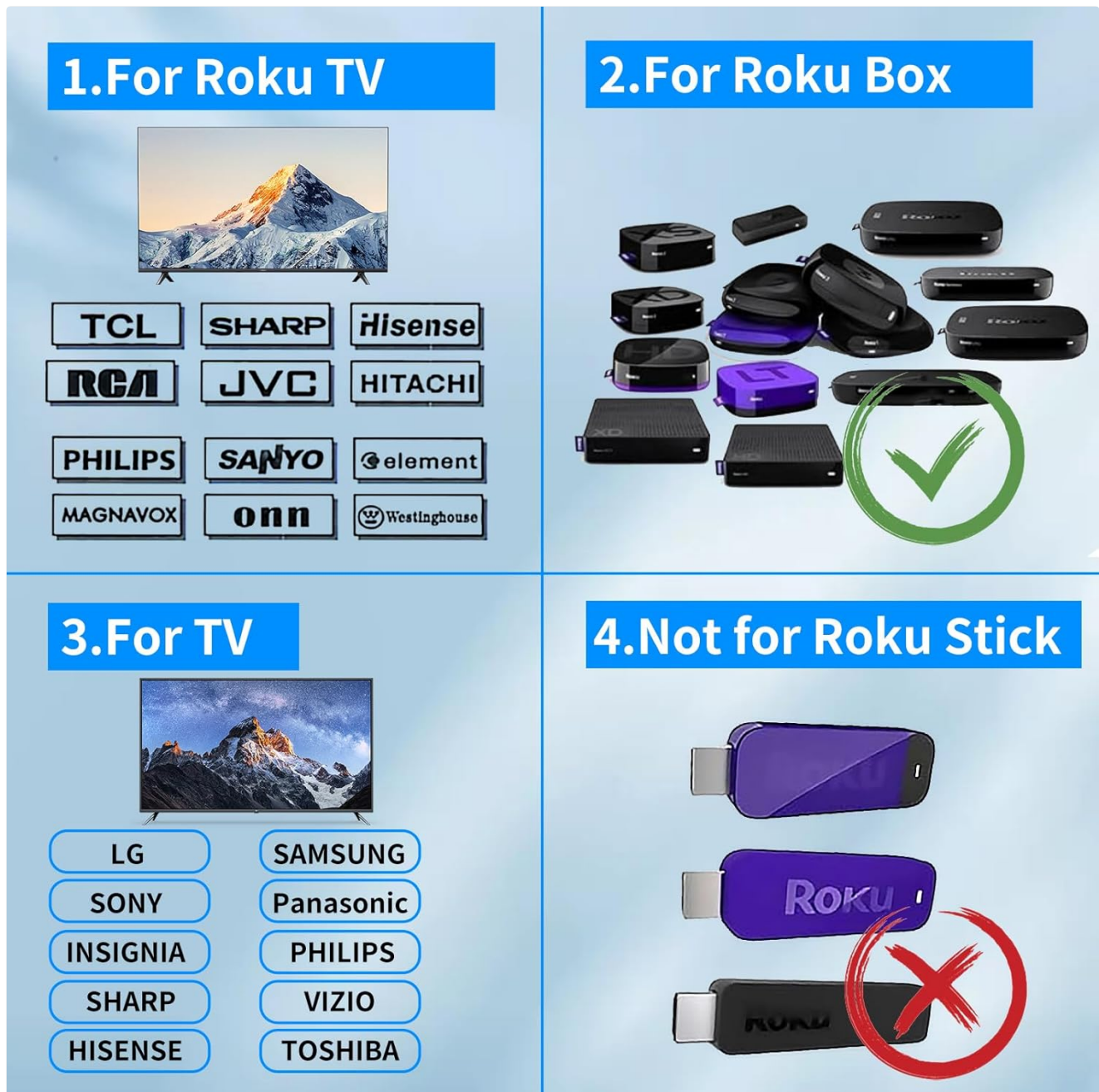
Image 2.2: Visual representation of compatible devices, including various Roku TV brands and Roku Box players. Clearly indicates incompatibility with Roku Stick devices.

Note: This remote is NOT compatible with Roku Stick devices.