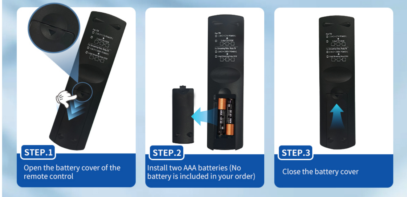
Image 3.1: Step-by-step guide for installing AAA batteries into the remote control, showing opening the cover, inserting batteries, and closing the cover.