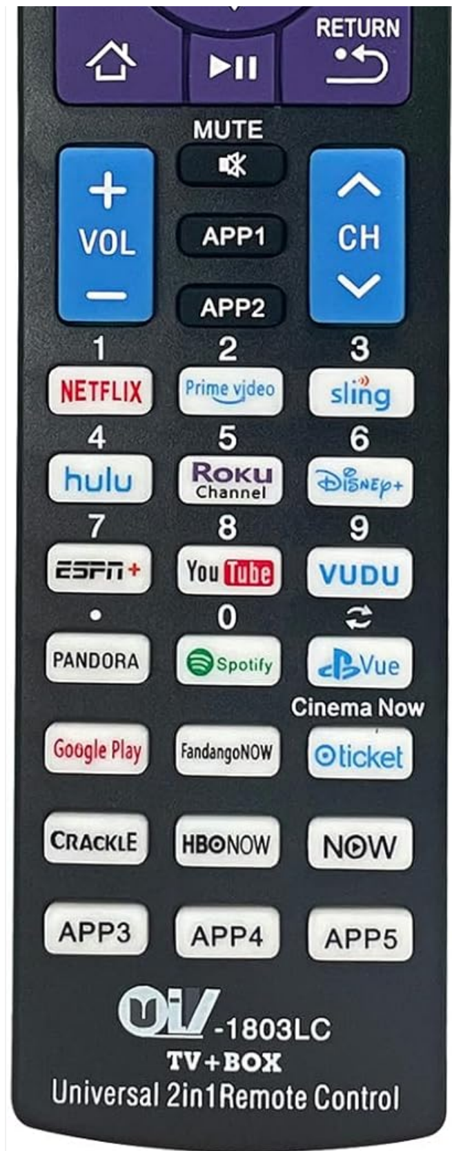
Image 2.1: Front view of the RIVIERA UTV-1803 remote control, showing all buttons including power, input, navigation, volume, channel, and dedicated app buttons for Netflix, Prime Video, Sling, Hulu, Roku Channel, Disney+, ESPN+, YouTube, Vudu, Pandora, Spotify, Vue, Google Play, FandangoNOW, Cinema Now, Crackle, HBONOW, NOW, and five customizable APP buttons.