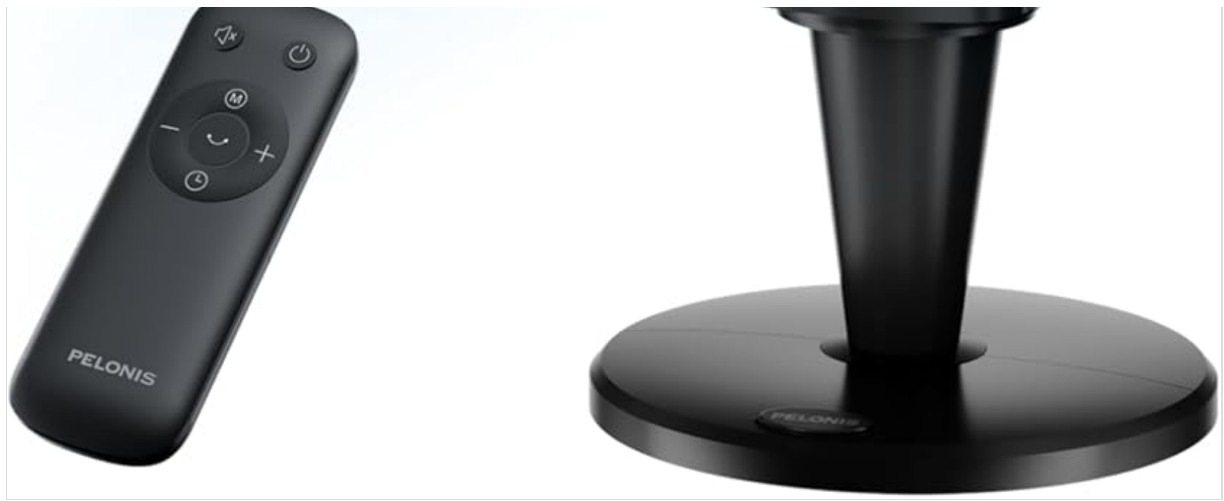
A black PELONIS 36-inch tower fan with a remote control, showing a blue airflow pattern emanating from the fan.