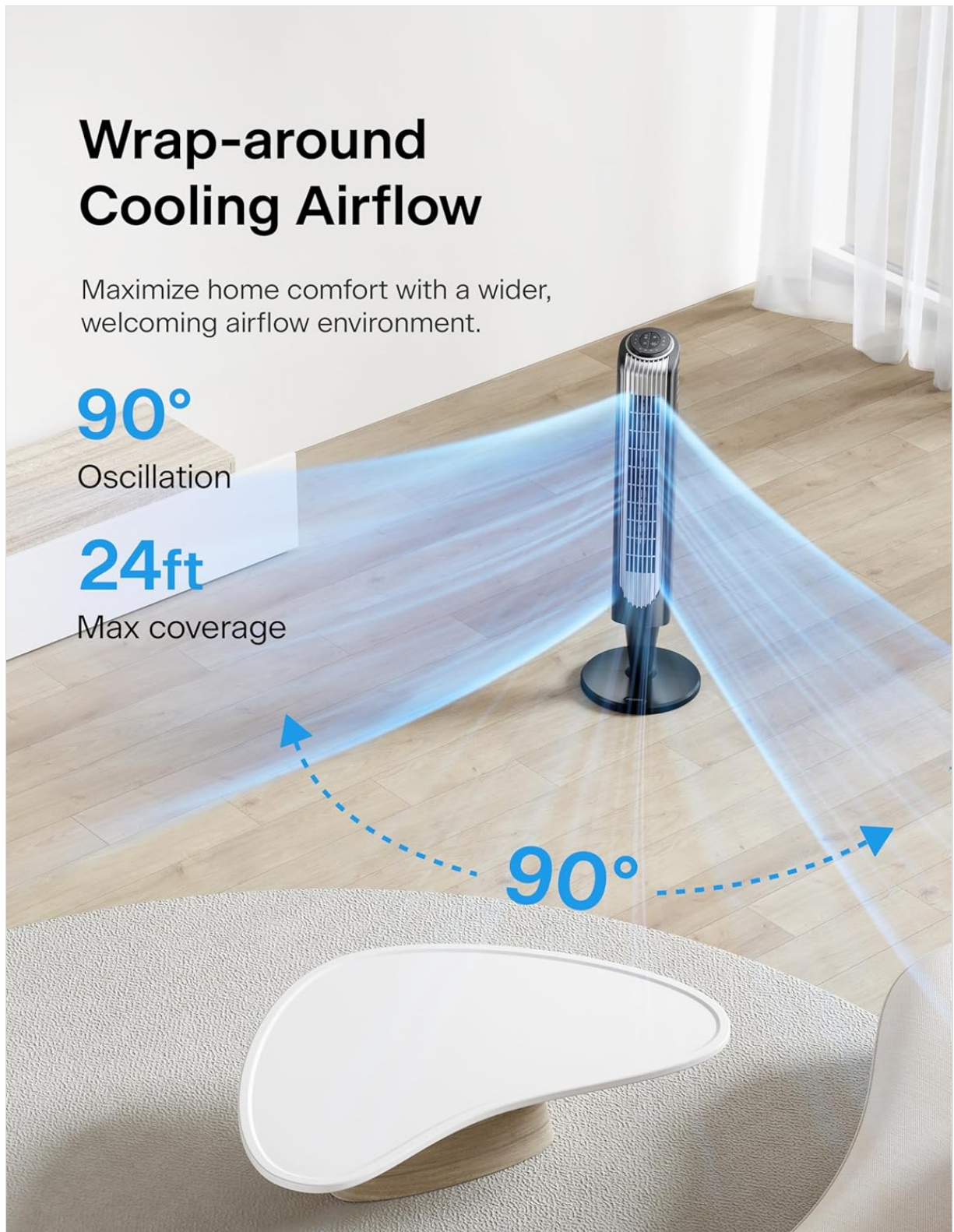
An image illustrating the 90-degree oscillation feature of the PELONIS tower fan, showing air circulating across a wide area in a living room setting.