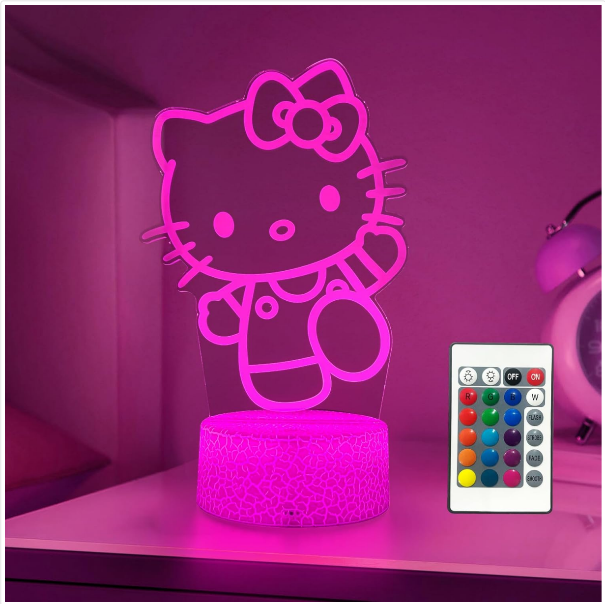
Image: The AIHYING Kitty Night Light illuminated in pink, with its remote control visible on a bedside table.

Video: Demonstrates the unboxing and assembly process of the Kitty Night Light, including inserting the acrylic panel into the base and connecting the power.