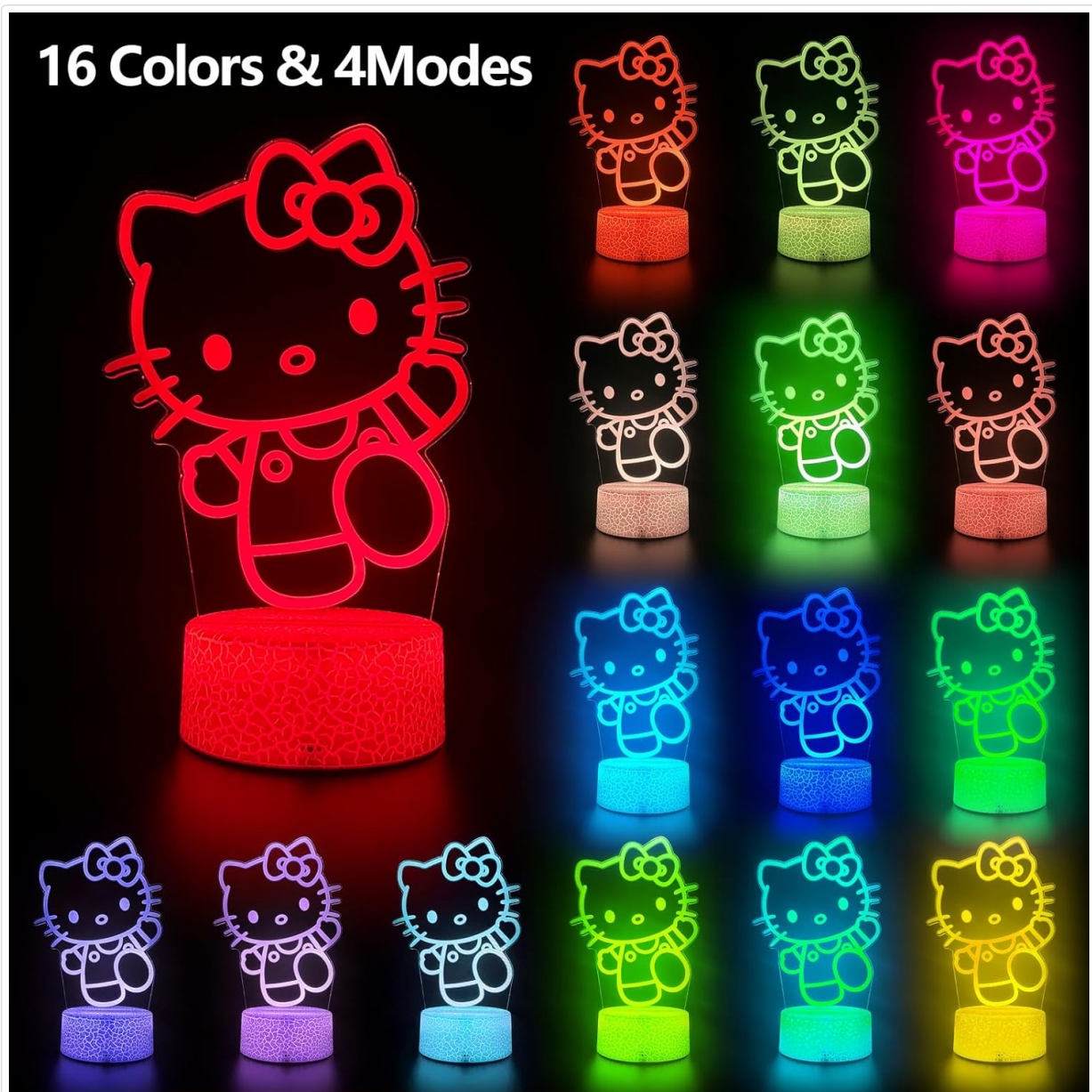
Image: Multiple Kitty Night Lights showcasing the 16 available colors and 4 dynamic modes.