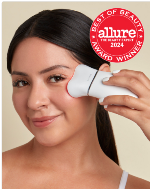
Image: The NuFACE FIX MicroWand device and its accompanying Line Smoothing FIX Serum.