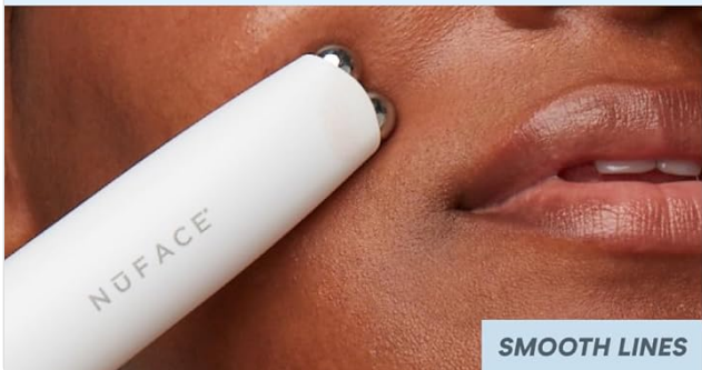
Image: Visual guide for preparing skin, applying serum, and performing treatments.