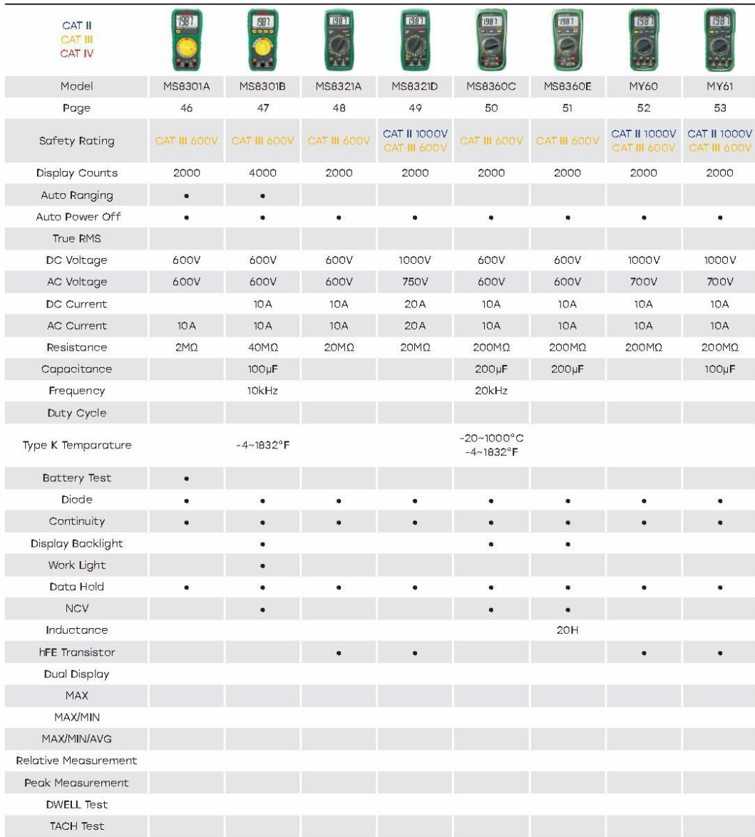
Figure 4: Manual Ranging Specifications (MS8301A column)