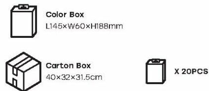
Figure 3: Package Contents