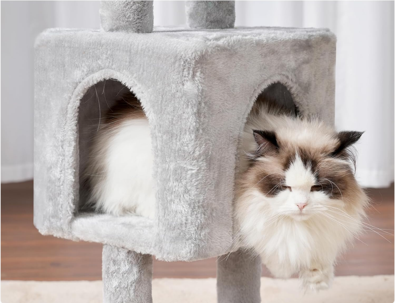
Image: A cat peeking out from inside the cozy, private cat condo, illustrating a secure resting spot.