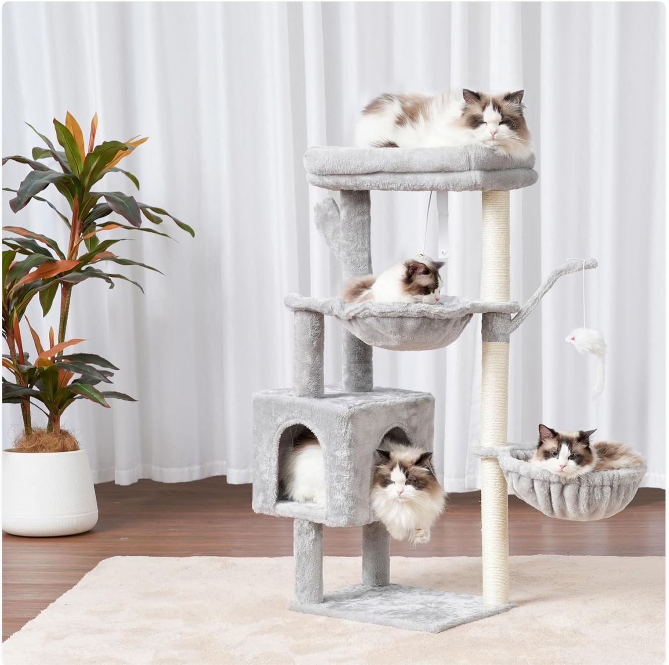
Image: The Heybly HCT006SW Cat Tree in a home setting, showcasing its various levels and features with cats enjoying the structure.