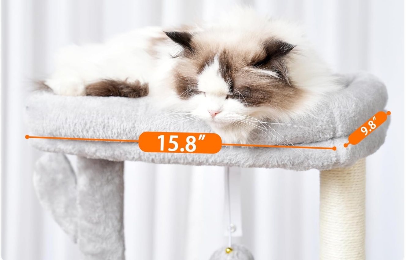
Image: A cat comfortably resting on the spacious, soft top platform of the cat tree, highlighting its comfort and size.