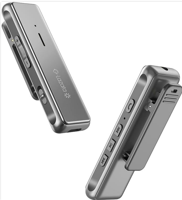
Image 2.1: Front and side view of the Glazata R80-N Wireless Audio Receiver, showing its compact design and control buttons.