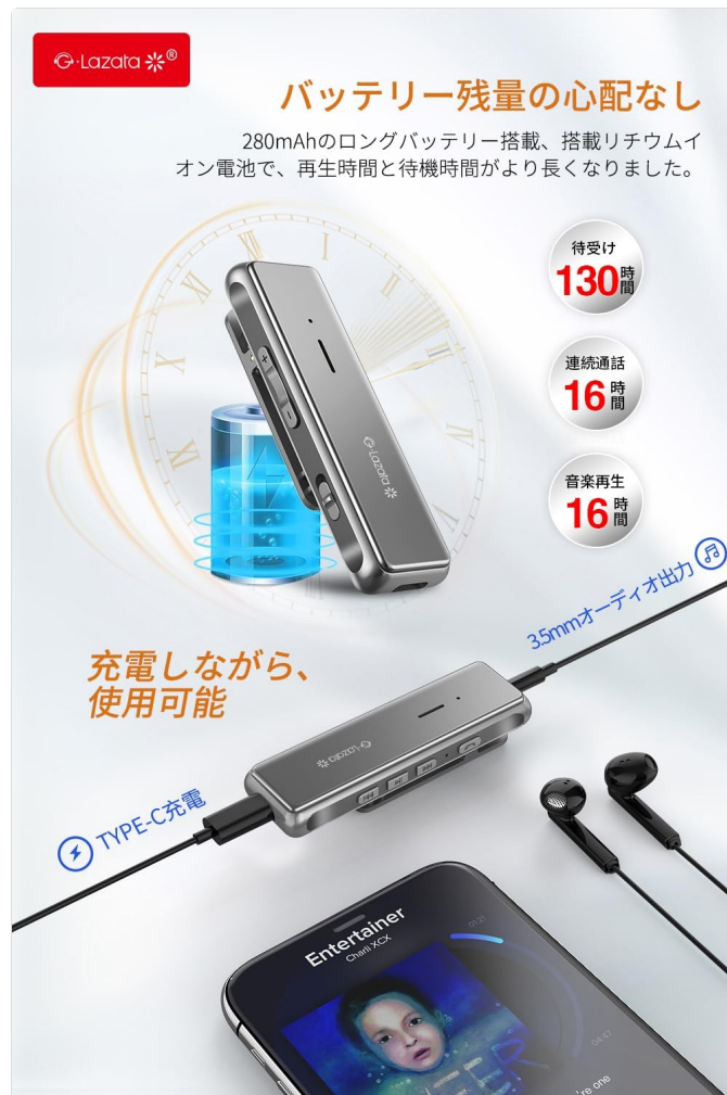
Image 3.2: The Glazata R80-N receiver connected to a smartphone and wired earphones.