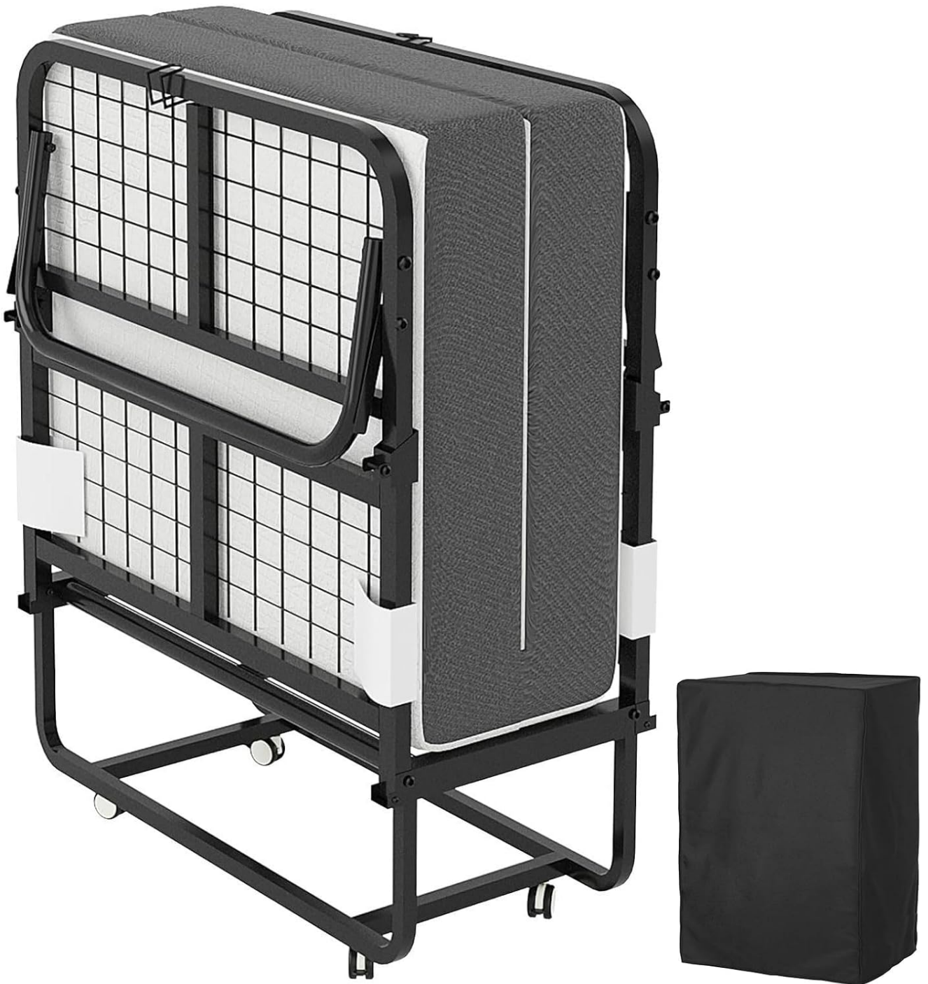
Image: The Mexin Folding Bed shown in its compact, folded position, accompanied by its protective dust cover. This illustrates its space-saving design.