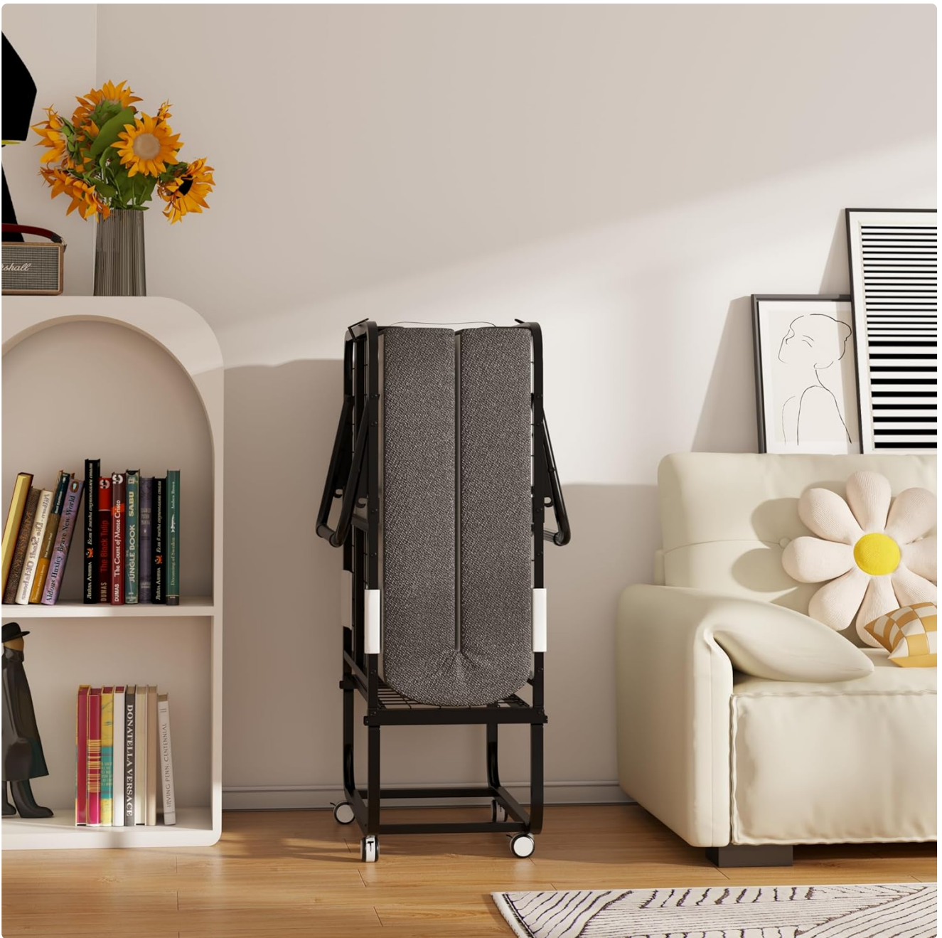
Image: The Mexin Folding Bed standing upright in its folded configuration within a room, highlighting its minimal footprint when stored.