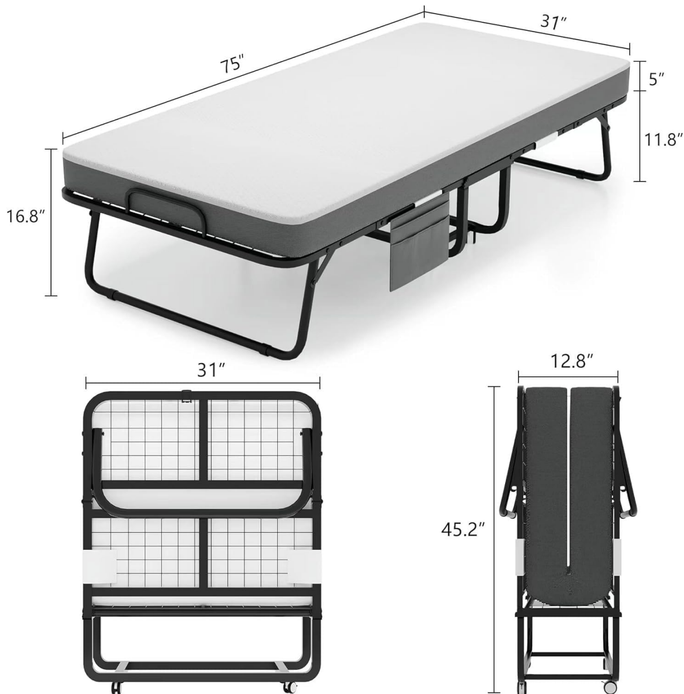
Image: A visual guide demonstrating the simple steps for both setting up and folding the bed for storage. It shows releasing buckles, using the metal hook closing strap, and easily pushing the bed for storage.

5. Allow Mattress to Expand: If the mattress was compressed for shipping, allow it to fully expand in a well-ventilated room for a few hours before first use. A slight odor may be present initially, which is normal and will dissipate.