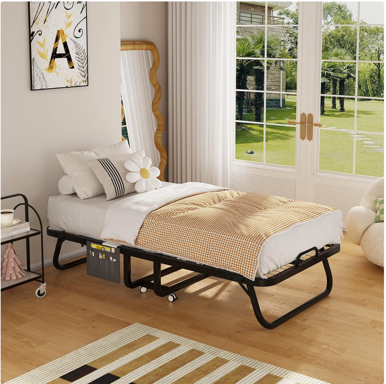
Image: The Mexin Folding Bed fully extended and prepared for use, positioned in a well-lit room, demonstrating its appearance as a functional bed.