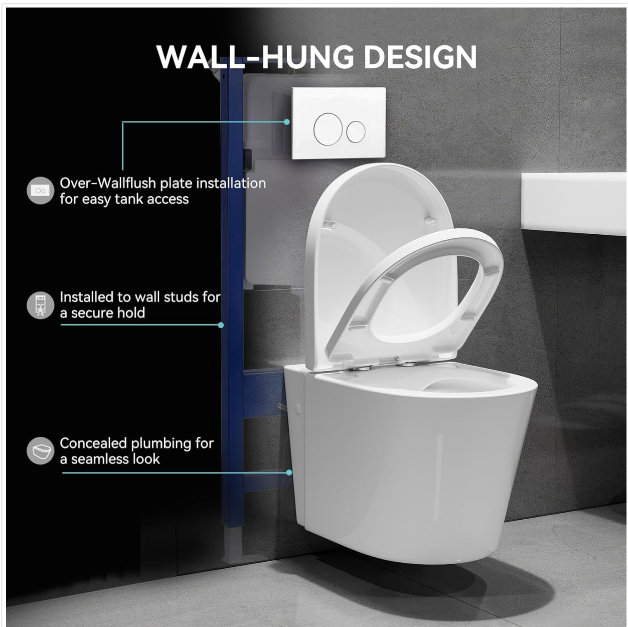
Image: A wall-hung toilet installed with the concealed carrier system, showing the flush plate and the seamless integration into the bathroom wall.

Refer to the detailed step-by-step instructions included with your product for specific measurements and procedures.