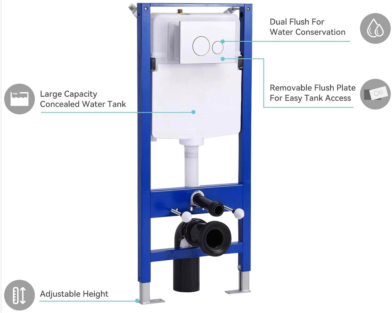
Image: Diagram highlighting key features such as large capacity concealed water tank, dual flush for water conservation, removable flush plate for easy tank access, and adjustable height.