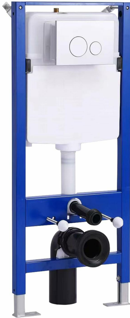
Image: The HOROW Concealed In-Wall Toilet Tank Carrier System, featuring a blue frame, white tank, and dual flush mechanism.