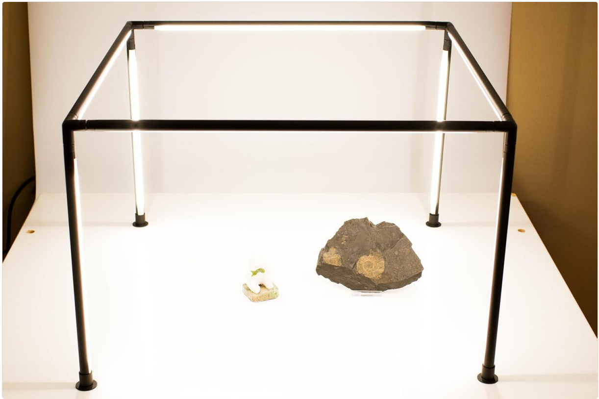
Image: The LED light frame positioned inside a display case, effectively illuminating various items from multiple angles.