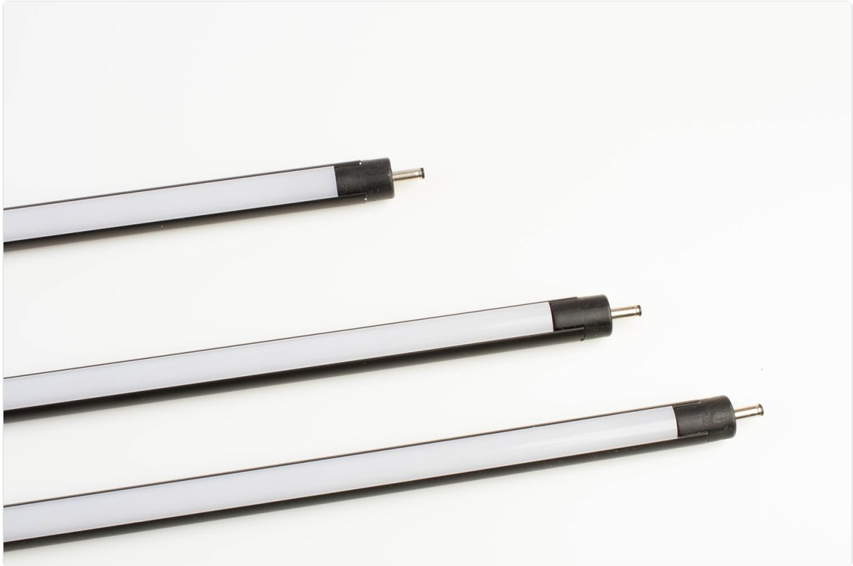
Image: Close-up view of the LED light bars and their connectors, showing the male and female ends for assembly.