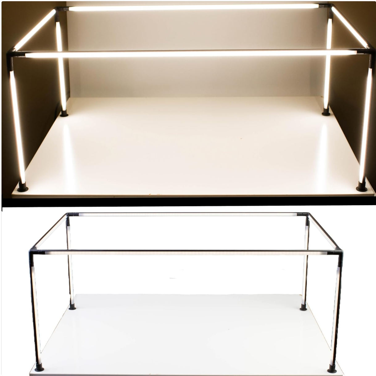
Image: The fully assembled 4-sided LED light frame, ready for placement.