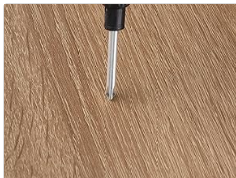
Figure 9: A close-up of the desk's engineered wood surface, demonstrating its robust and easy-to-maintain finish.