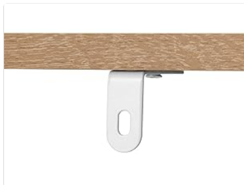
Figure 3: A close-up view of the anti-tipping device, which should be securely fastened to a wall for enhanced stability.