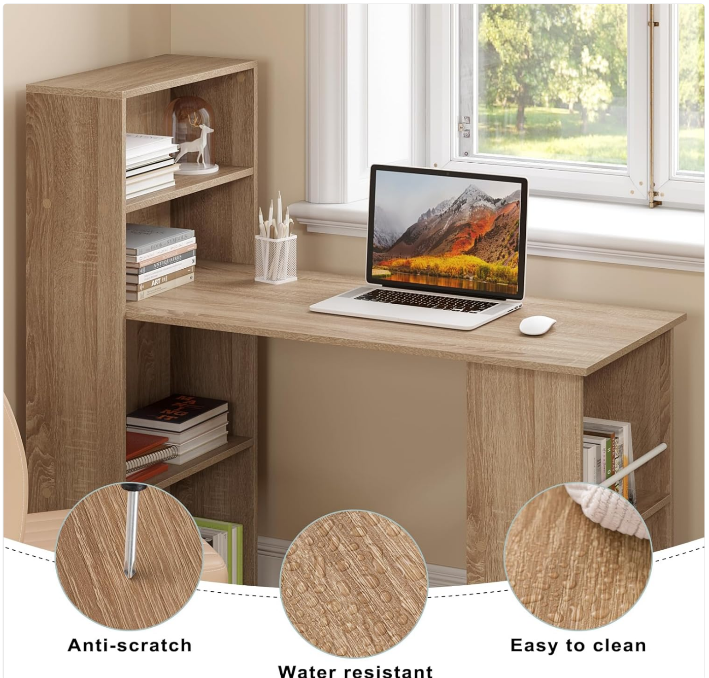
Figure 8: Key features for maintenance: anti-scratch, water-resistant, and easy-to-clean surfaces.