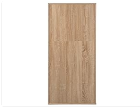
Figure 4: Detail of the desk's back panel, which provides structural integrity and finishes the look of the storage sections.