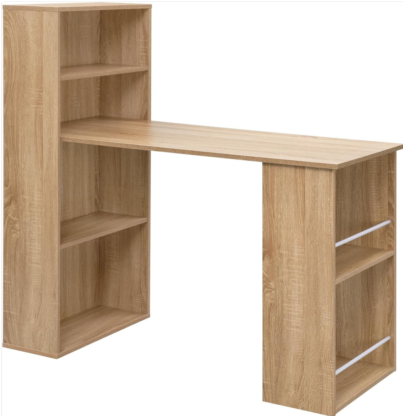
Figure 1: A full view of the eSituro Desk, showcasing its integrated storage and bookshelf design.