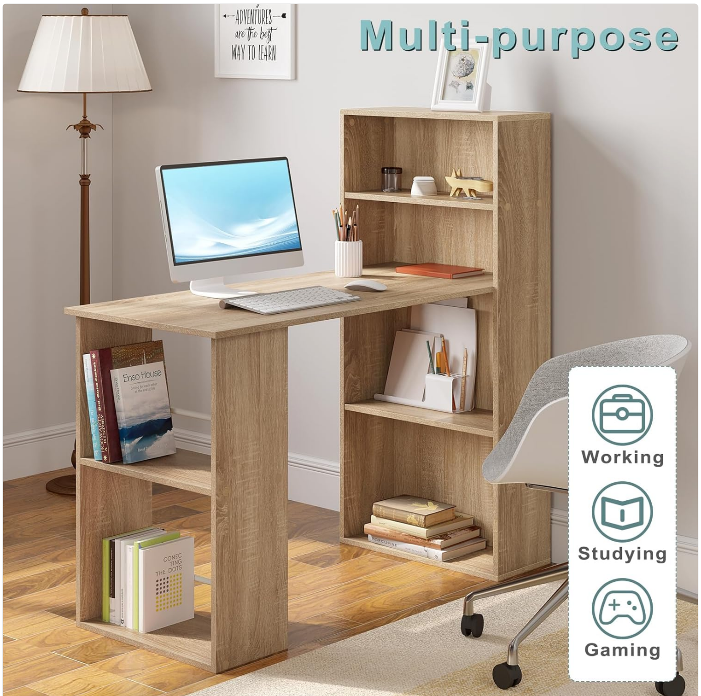
Figure 7: The desk's multi-purpose functionality, suitable for working, studying, and gaming.