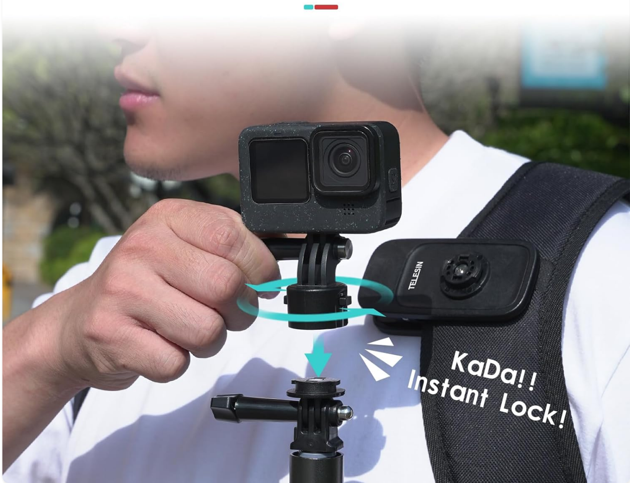
Image: Demonstration of the TELESIN S2 Quick Release mechanism, allowing for effortless single-handed attachment and detachment of the camera.

Experience effortless single-handed operation with clear audible feedback.