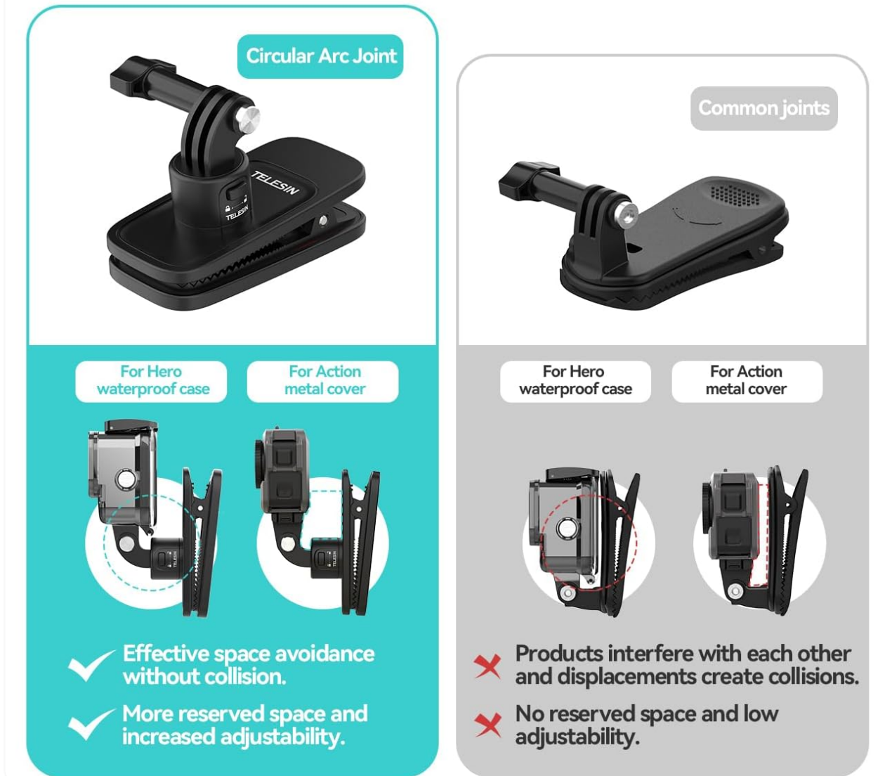
Image: Illustration of the Circular Arc Joint design, which optimizes space and prevents interference, allowing for greater adjustability compared to common joints.

Efficient use of space and avoidance of interference