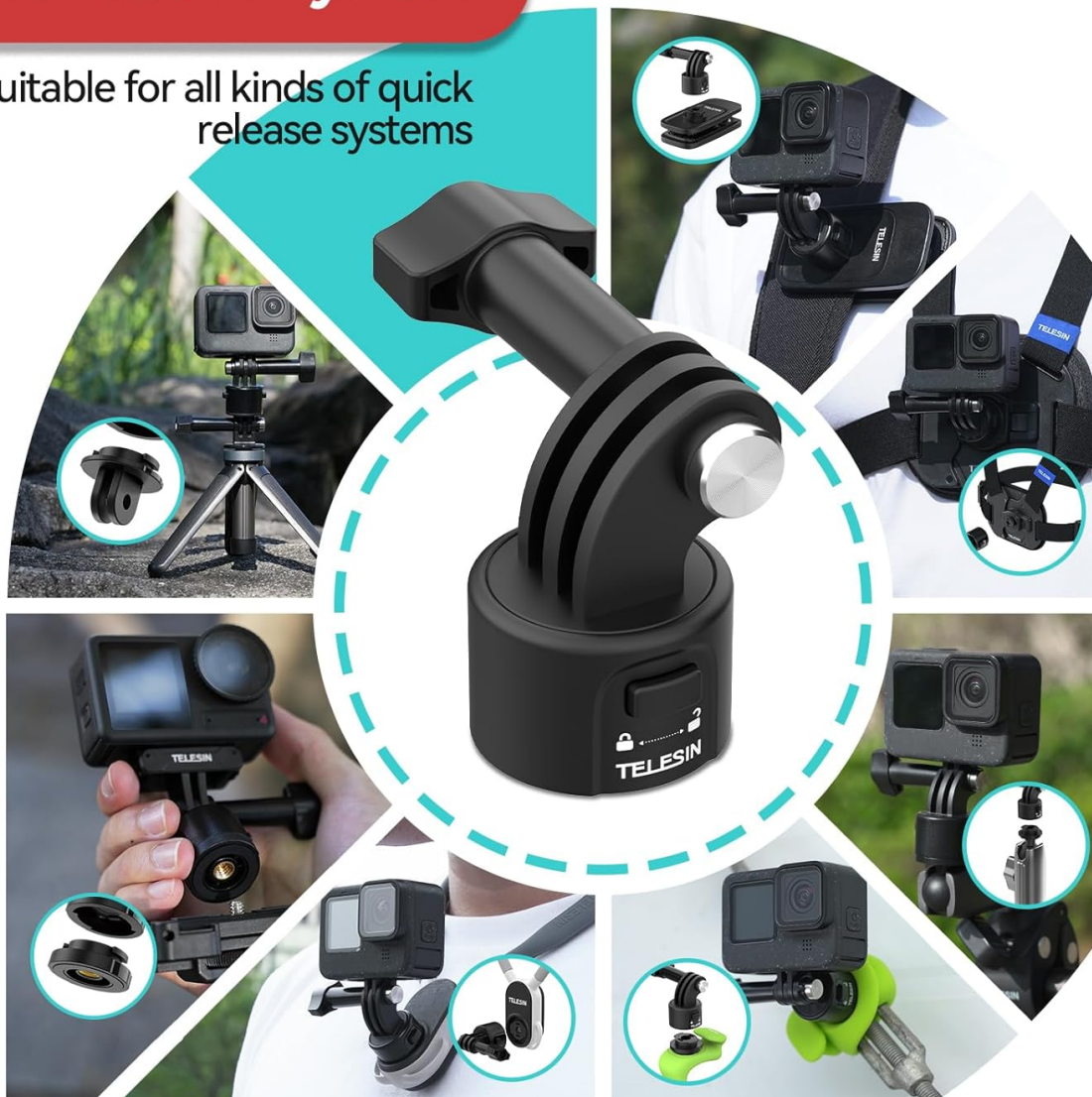
Image: The TELESIN S2 Quick Release System illustrating its adaptability to different mounting scenarios, including tripods, chest harnesses, and backpack straps.

Suitable for all kinds of quick release systems